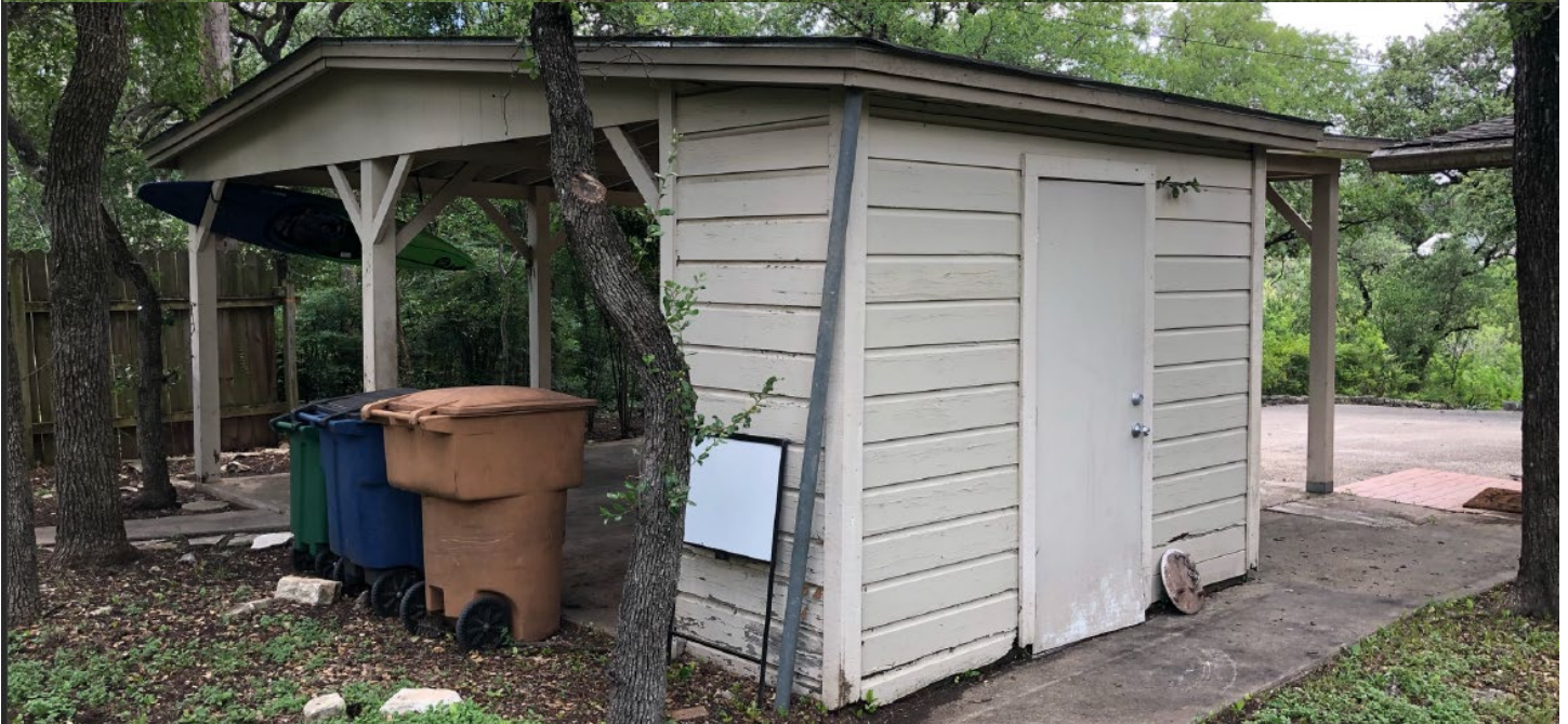
Demolition permit application, 2022