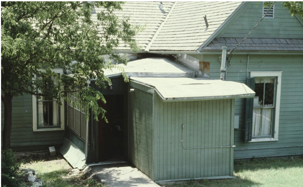
Texas Historical Commission. [Historic Property, Photograph 3491-01], photograph, Date Unknown; ( https://texashistory.unt.edu/ark:/67531/metaph959373/m1/1/?q=%22902%20e%207th%22 : accessed April 15, 2022), University of North Texas Libraries, The Portal to Texas History, https://texashistory.unt.edu ; crediting Texas Historical Commission.