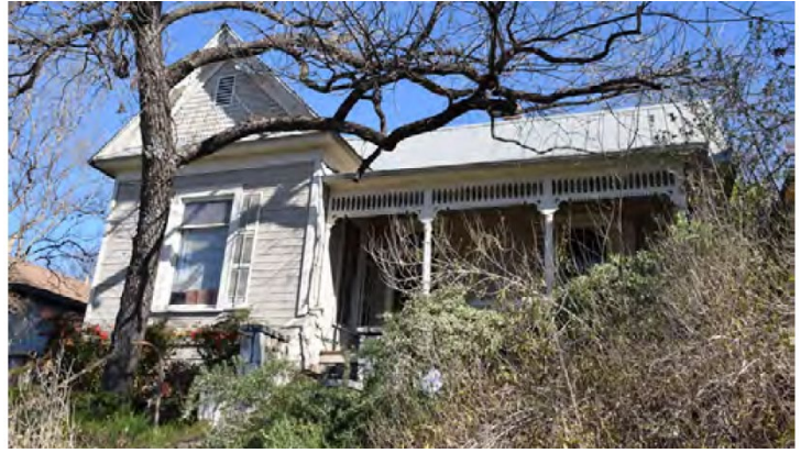
2016 East Austin Historic Resource Survey; HHM, Inc.