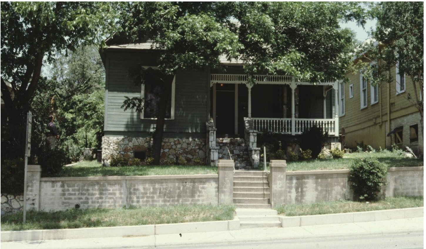
Texas Historical Commission. [Historic Property, Photograph 3491-08], photograph, Date Unknown; ( https://texashistory.unt.edu/ark:/67531/metaph970097/m1/1/?q=%22902%20e%207th%22 : accessed April 15, 2022), University of North Texas Libraries, The Portal to Texas History, https://texashistory.unt.edu ; crediting Texas Historical Commission.