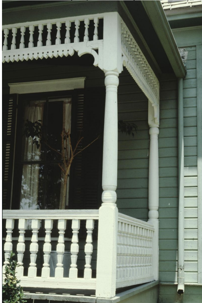
Texas Historical Commission. [Historic Property, Photograph 3491-02], photograph, Date Unknown; ( https://texashistory.unt.edu/ark:/67531/metaph960046/m1/1/?q=%22902%20e%207th%22 : accessed April 15, 2022), University of North Texas Libraries, The Portal to Texas History, https://texashistory.unt.edu ; crediting Texas Historical Commission.