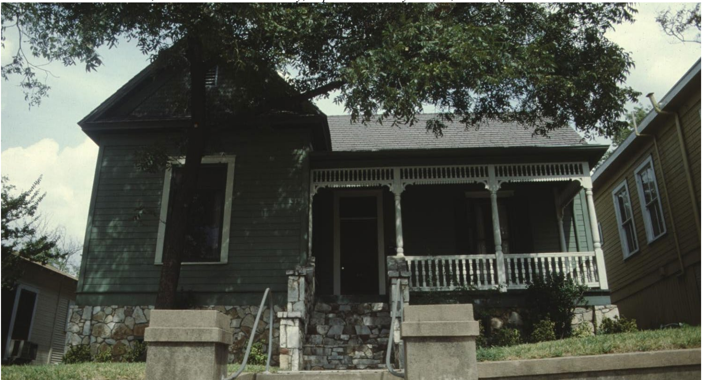
Texas Historical Commission. [Historic Property, Photograph 3358-17], photograph, September 1, 1984; ( https://texashistory.unt.edu/ark:/67531/metaph970947/m1/1/?q=%22902%20e%207th%22 : accessed April 15, 2022), University of North Texas Libraries, The Portal to Texas History, https://texashistory.unt.edu ; crediting Texas Historical Commission.