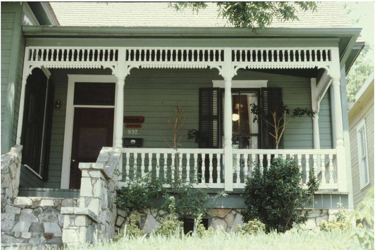
Texas Historical Commission. [Historic Property, Photograph 3491-05], photograph, Date Unknown; ( https://texashistory.unt.edu/ark:/67531/metaph963951/m1/1/?q=%22902%20e%207th%22 : accessed April 15, 2022), University of North Texas Libraries, The Portal to Texas History, https://texashistory.unt.edu ; crediting Texas Historical Commission.