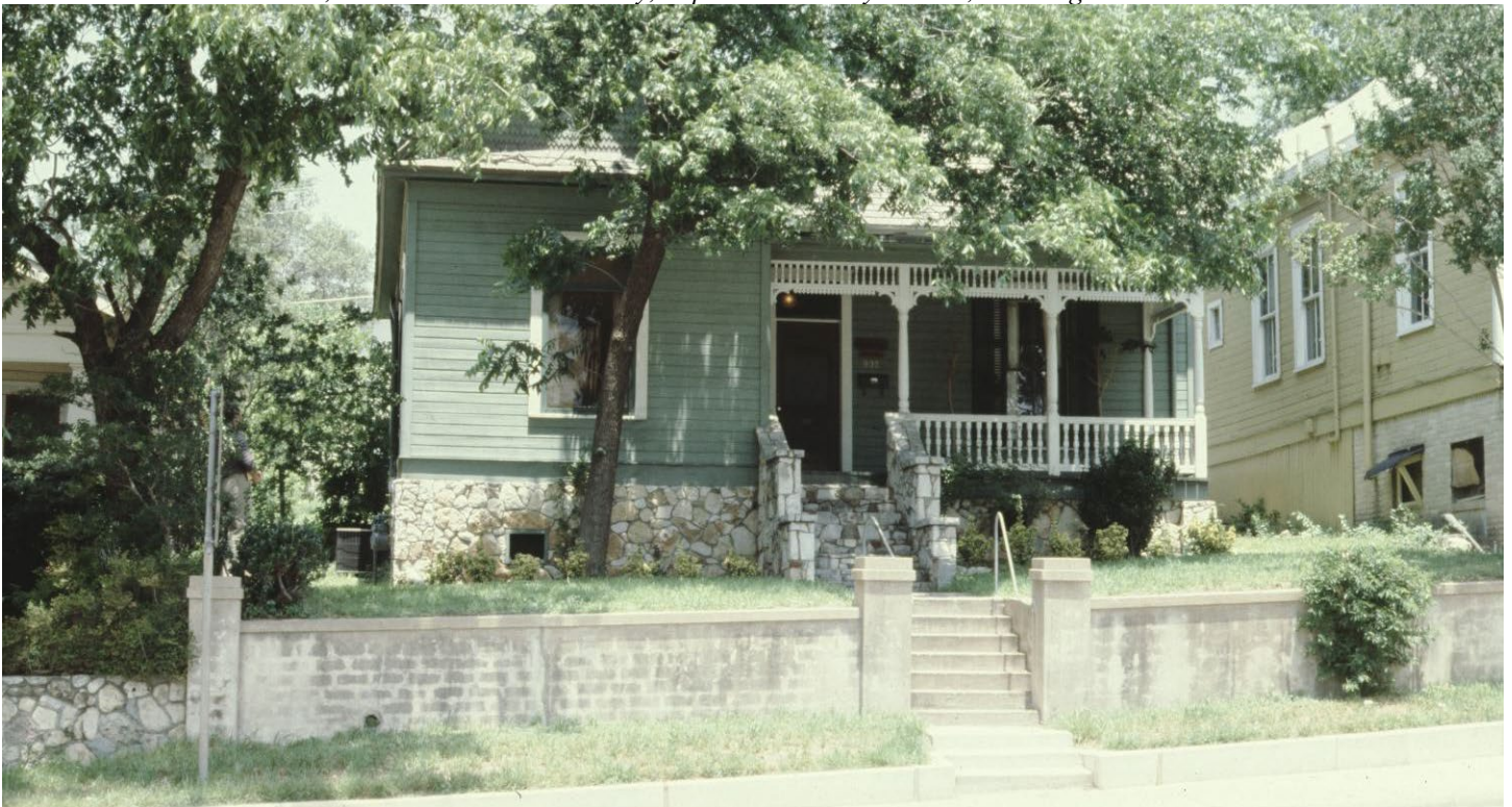
Texas Historical Commission. [Historic Property, Photograph 3491-03], photograph, Date Unknown; ( https://texashistory.unt.edu/ark:/67531/metaph963292/m1/1/?q=%22902%20e%207th%22 : accessed April 15, 2022), University of North Texas Libraries, The Portal to Texas History, https://texashistory.unt.edu ; crediting Texas Historical Commission.