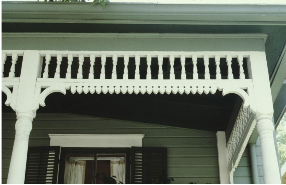
Texas Historical Commission. [Historic Property, Photograph 3491-07], photograph, Date Unknown; ( https://texashistory.unt.edu/ark:/67531/metaph968071/m1/1/?q=%22902%20e%207th%22 : accessed April 15, 2022), University of North Texas Libraries, The Portal to Texas History, https://texashistory.unt.edu ; crediting Texas Historical Commission.