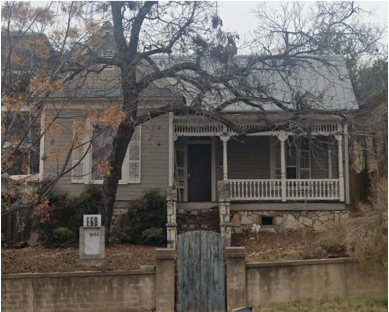
Google Street View, 2022