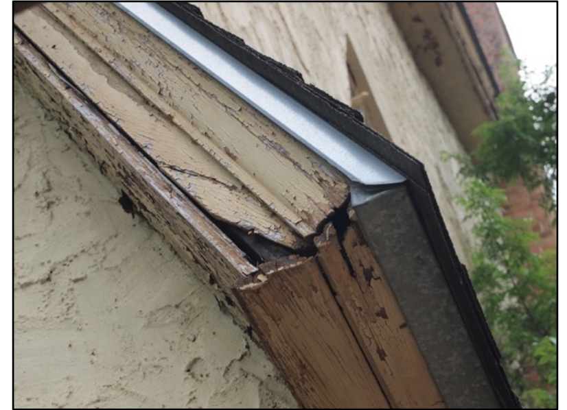
Main House – Repair and replace rotted wood