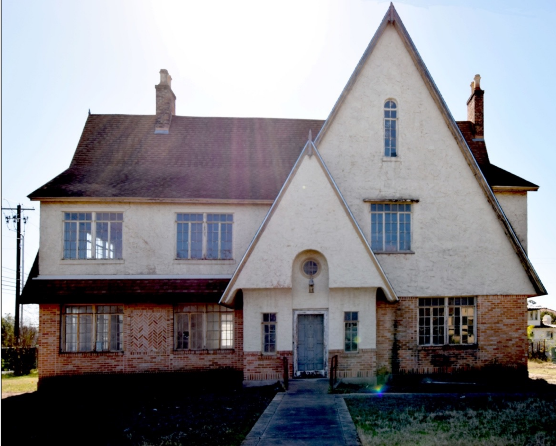
813 Park Blvd. ca. 1929 Miller-Long House