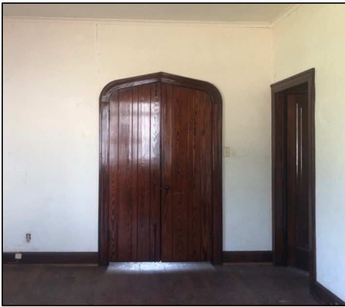
Main House – Restore interior woodwork