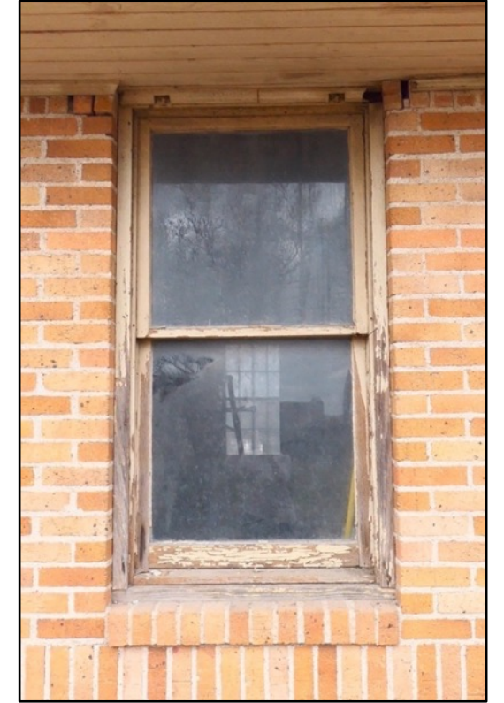
Garage - Double hung windows