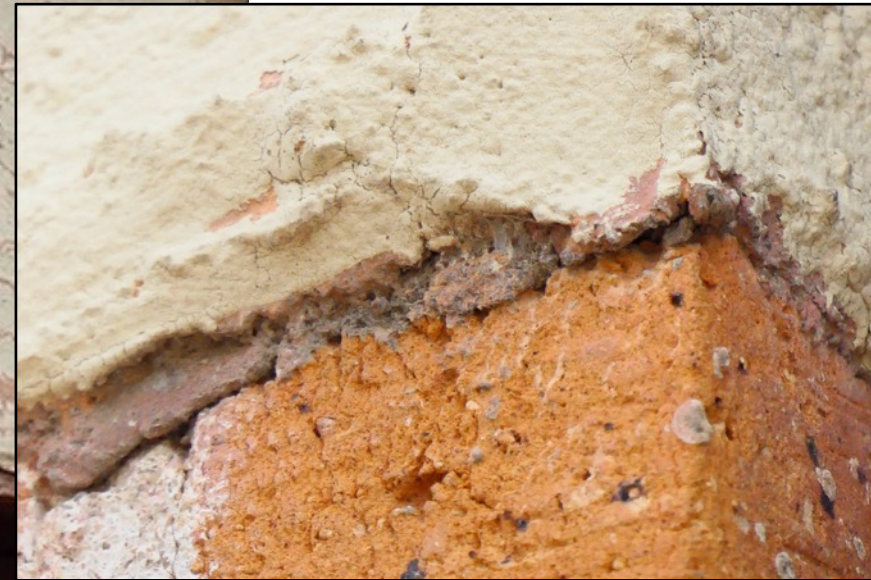
Garage – Stucco and evidence of original awning