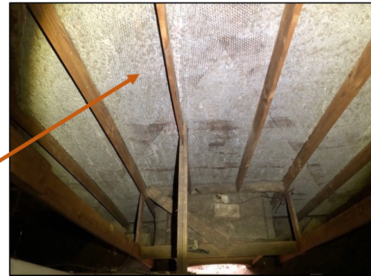
Stucco and historic lighting