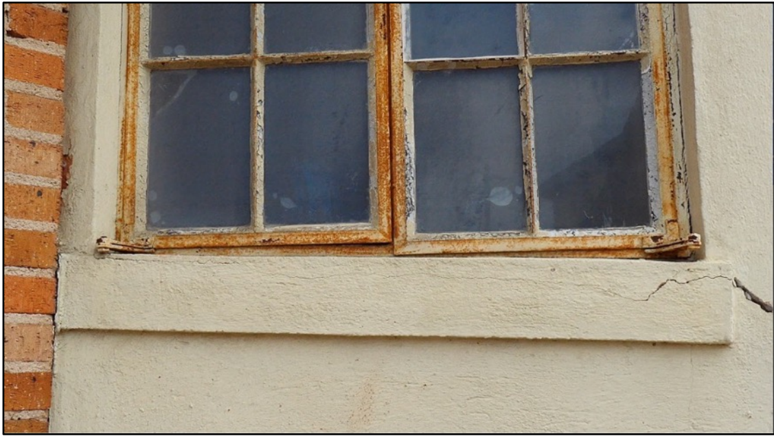
Main House – Steel sash casement windows