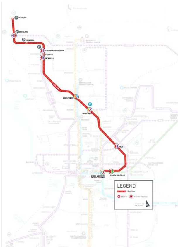
Figure 1: Project Connect MetroRail Red Line and Stations

sfvrsn=29897f4b 6> on the Project Connect website ( https://projectconnect.com/projects/red-line ).