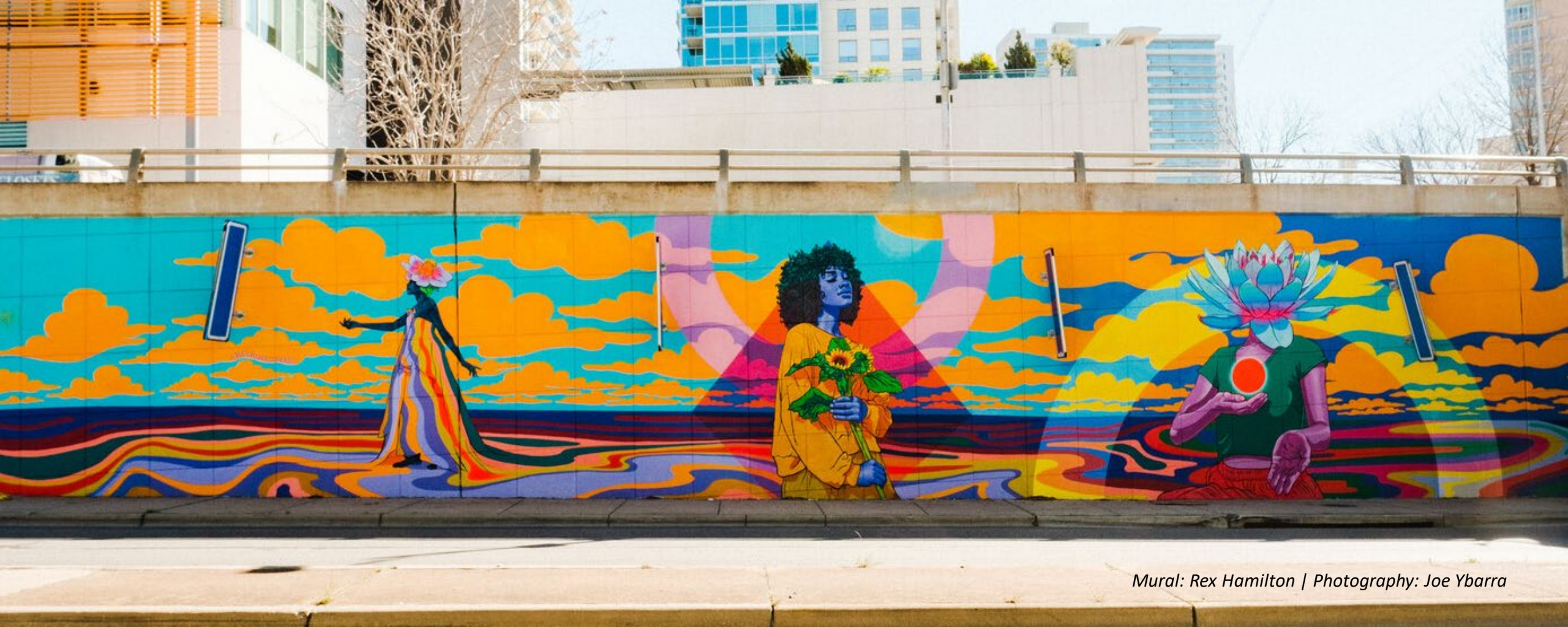
Mural: Rex Hamilton