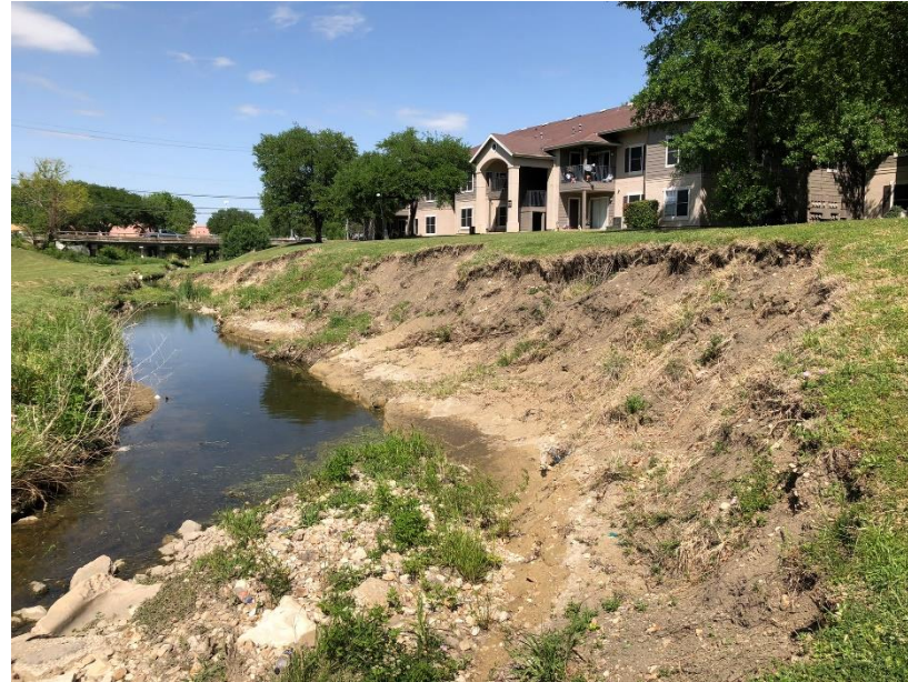
Erosion along Country Club Creek West, looking north towards E Riverside Dr