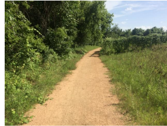
Roy G Guerrero Park to Elmont Dr Crushed gravel trail