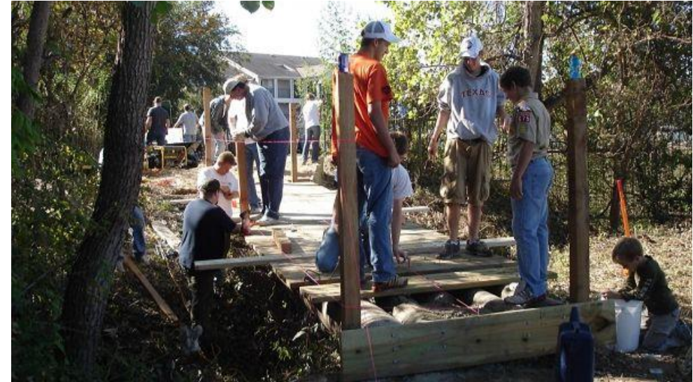
Volunteers building a wooden pedestrian bridge north of Elmont Dr