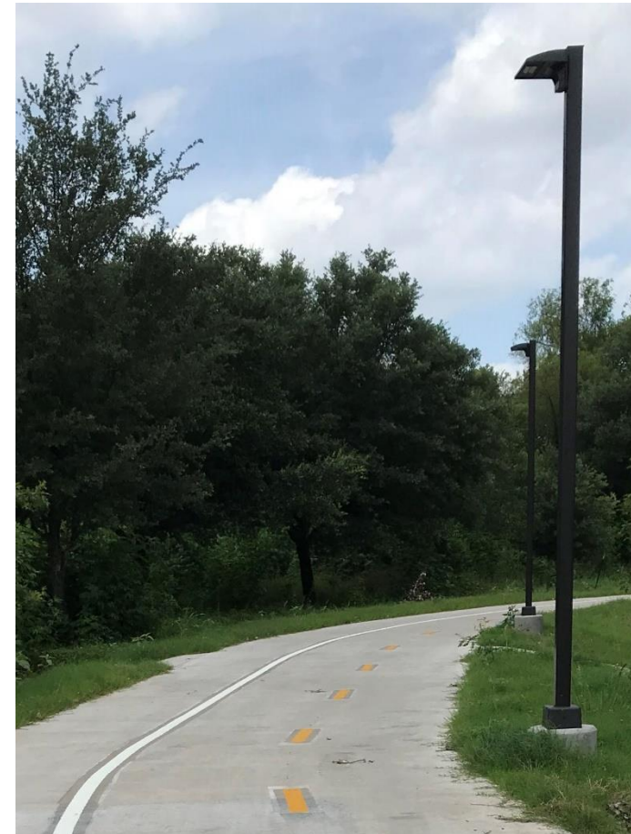
Lithonia D-series lighting used on Upper Boggy Creek Trail