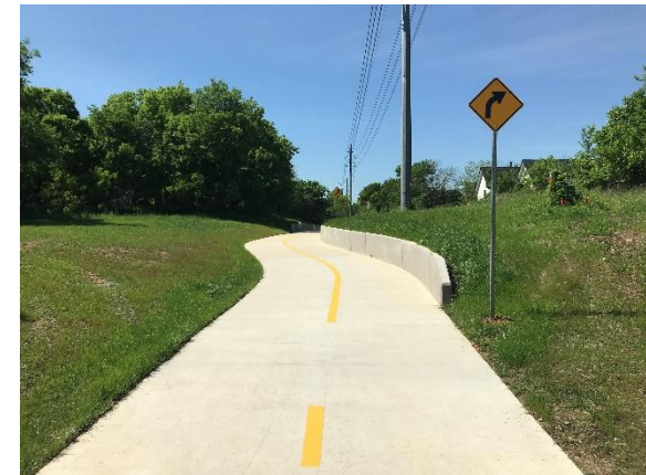
Burleson Rd to Ventura Dr Off-street trail in Austin Energy easement