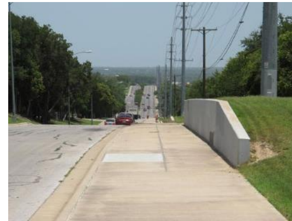
Oltorf St to Burleson Rd Shared use paths along both sides of S Pleasant Valley Rd