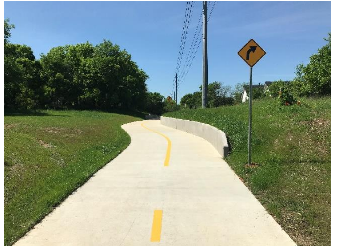
Country Club Creek Trail south of Burleson Rd