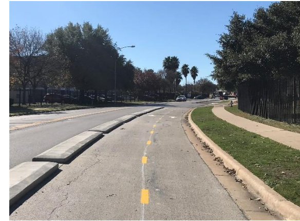
Elmont Dr to Riverside Dr Two-way protected bikeway with barrier curb + sidewalk