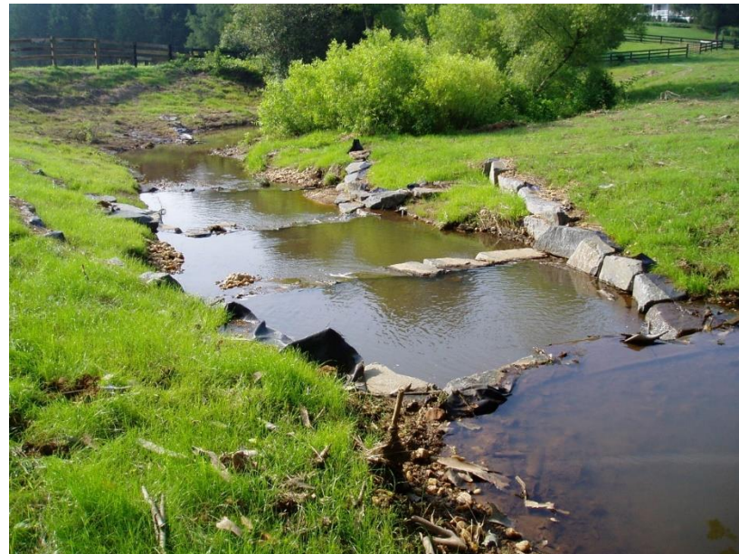
Example of protective works