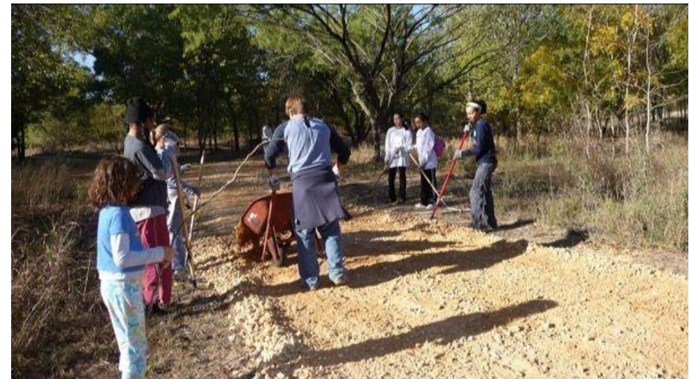
Volunteers laying the subgrade for 1.1 miles of trail in Roy G Guerrero Park