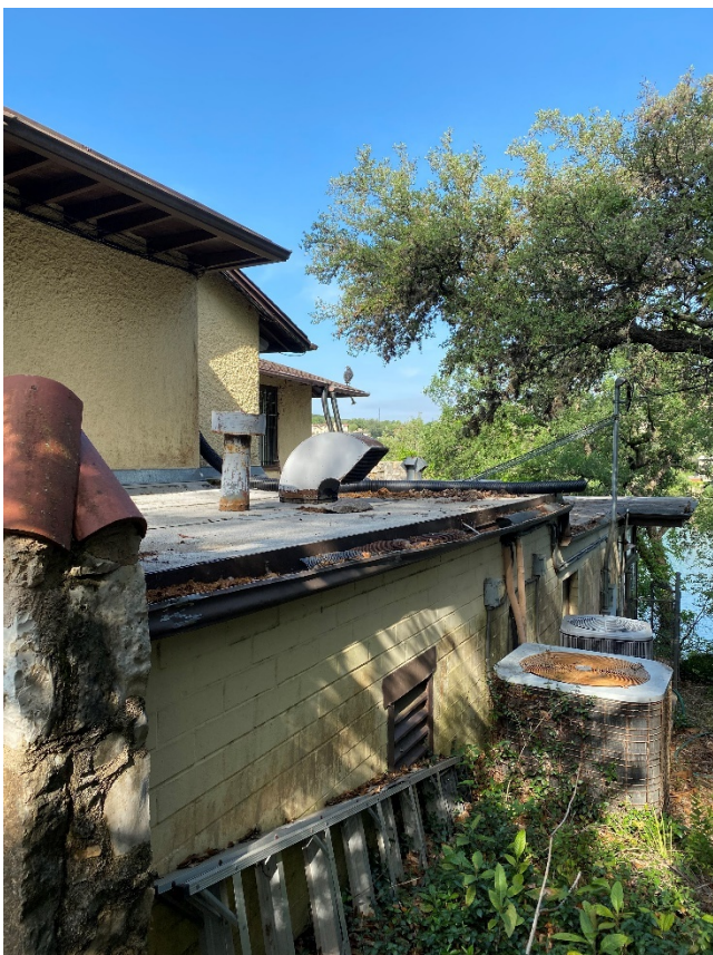
North elevation of primary residence