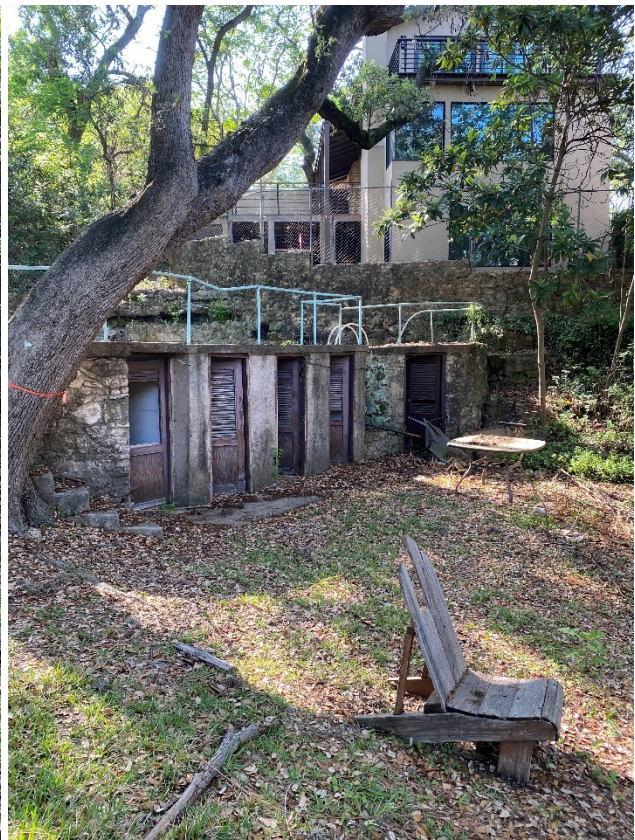
Landscape (Southside of property)