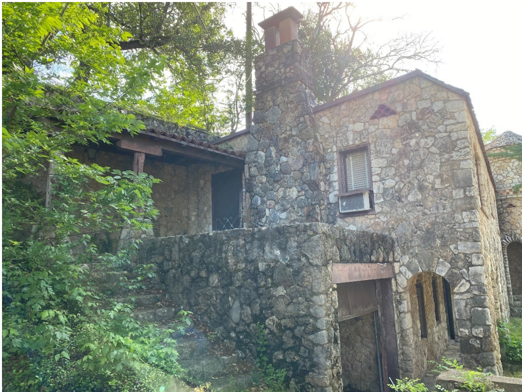
West elevation of accessory building