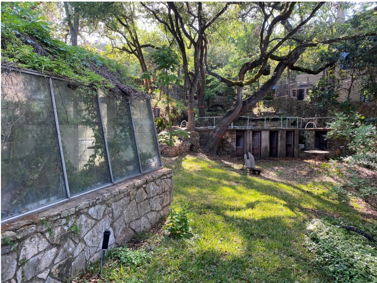
Landscape (Southside of property)