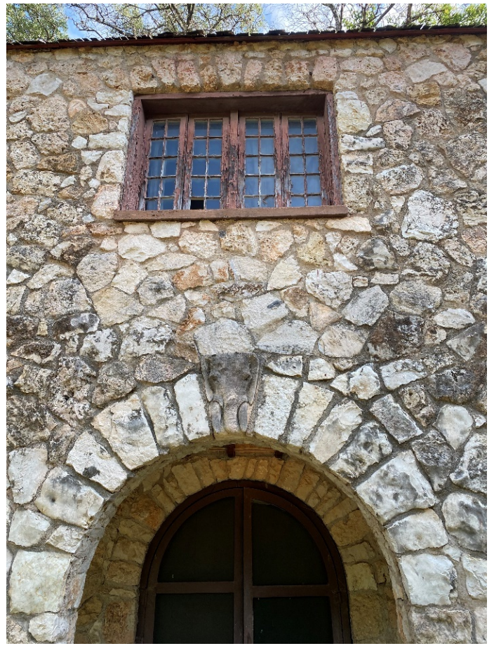
North-facing view of accessory building (middle window)