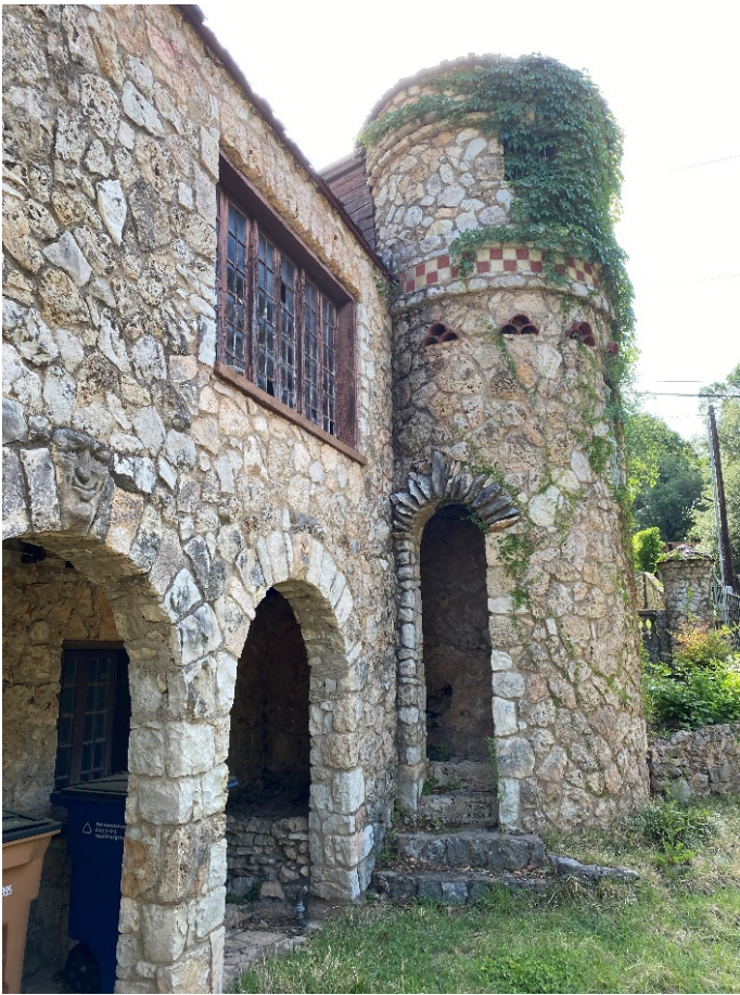
West-facing view of accessory building