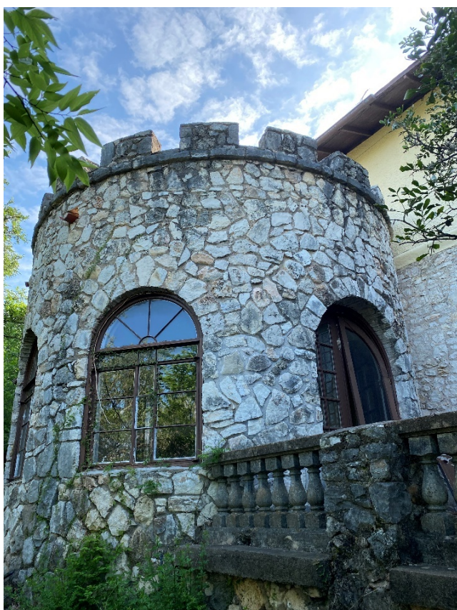
West elevation turret (primary residence)