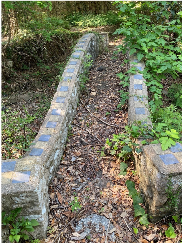
Bridge (Southside of property)