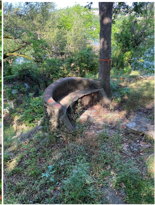
Bench (South of primary residence)