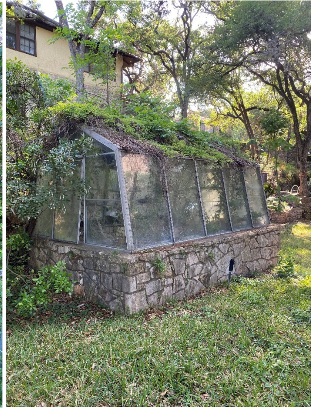
Landscape (Southside of property)