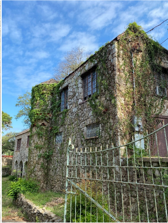
Northwest view of accessory building