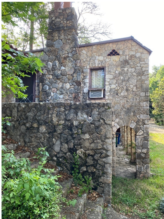
West elevation of accessory building