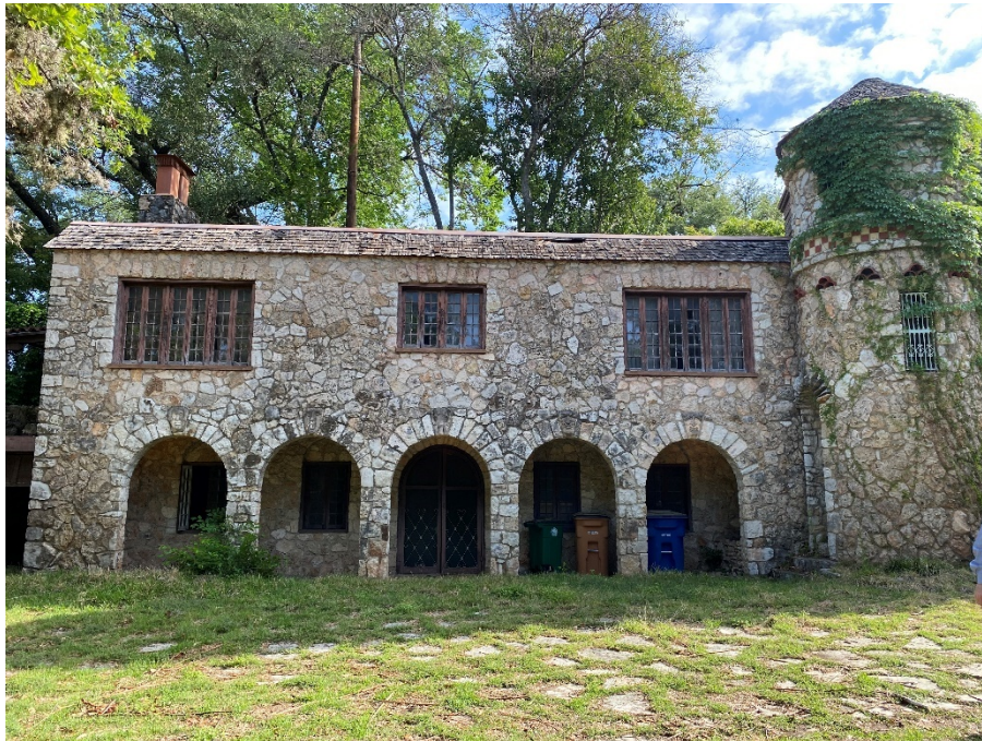
North-facing view of accessory building