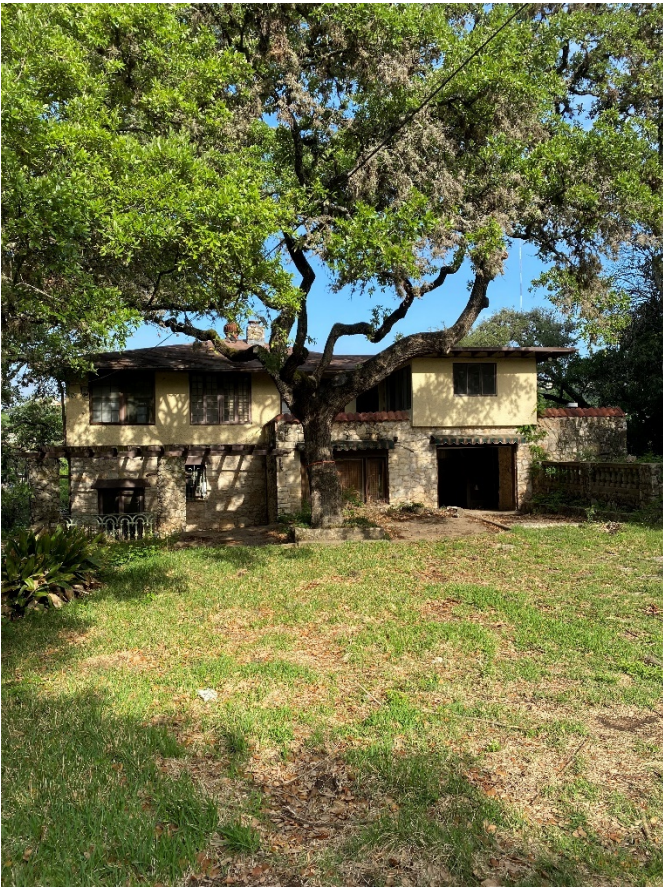
Northwest view of primary residence