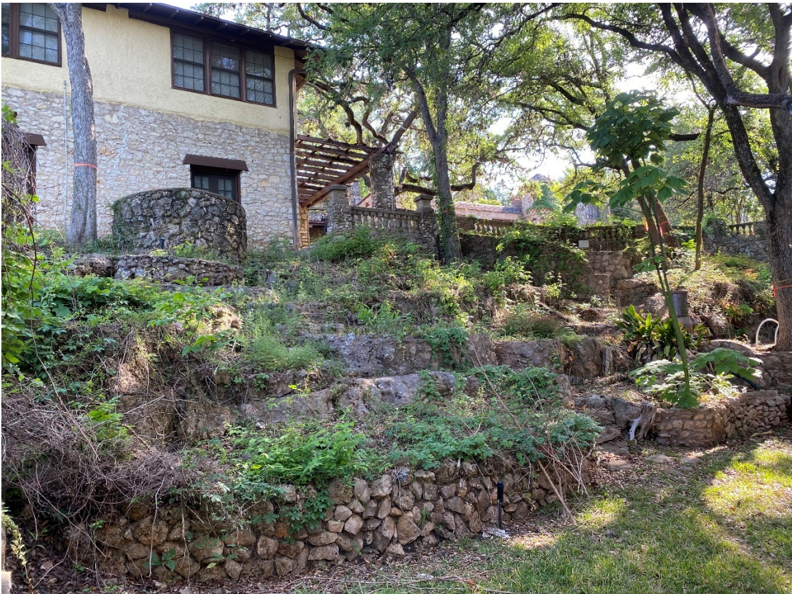
Landscape (Southside of property)