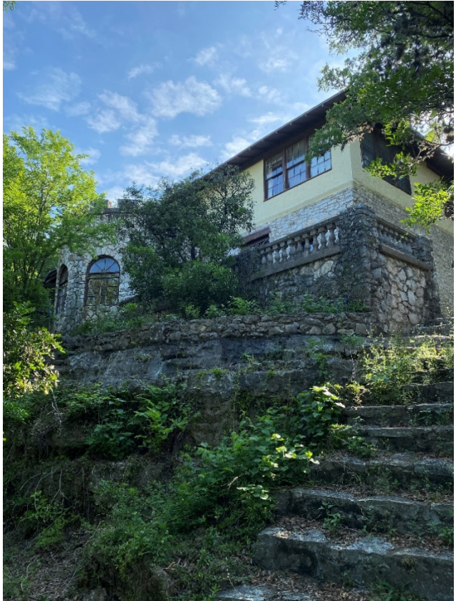
West elevation (primary residence)