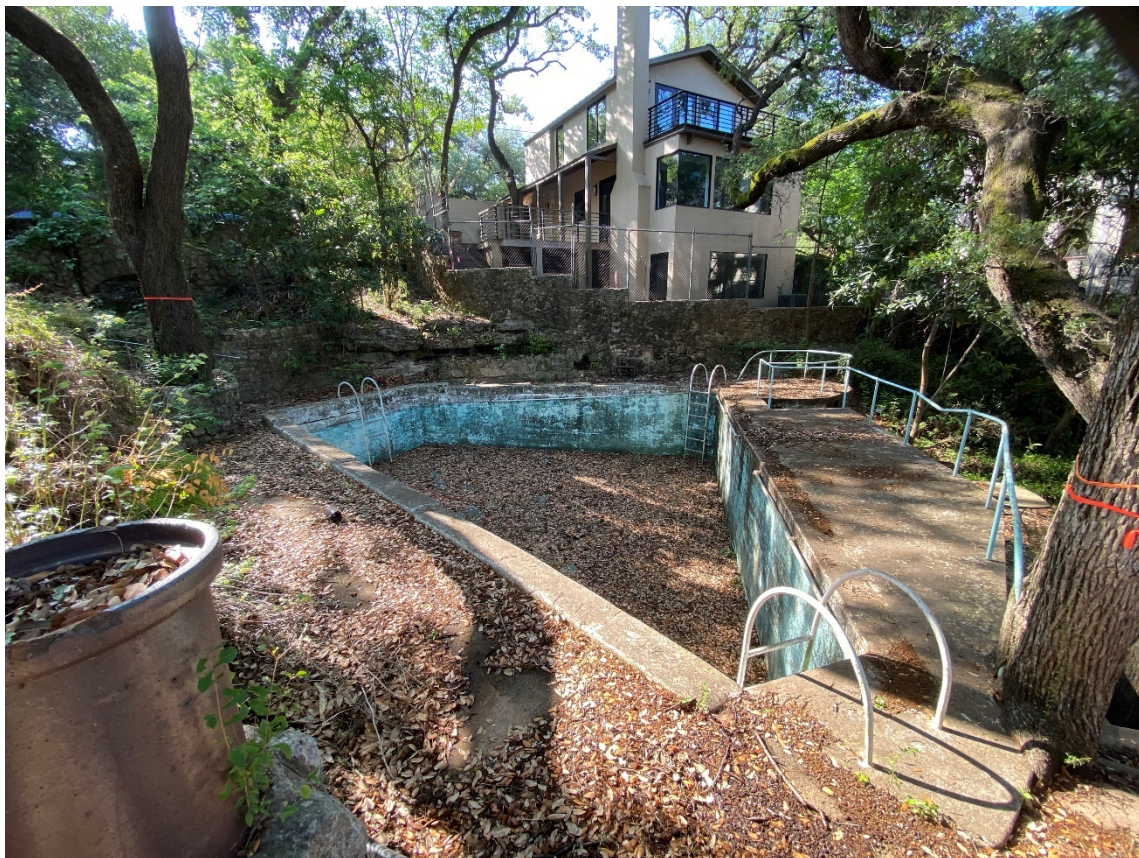
Pool (Southside of property)