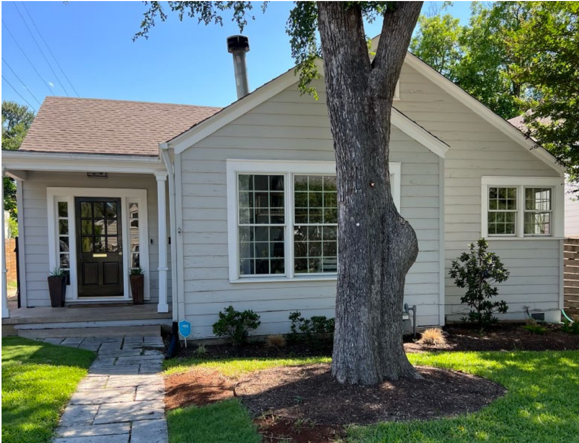
Relocation application, 2022