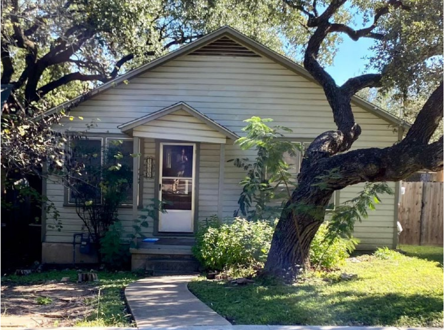
Demolition permit application, 2022