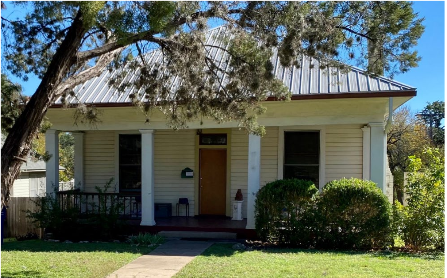
Demolition permit application, 2022