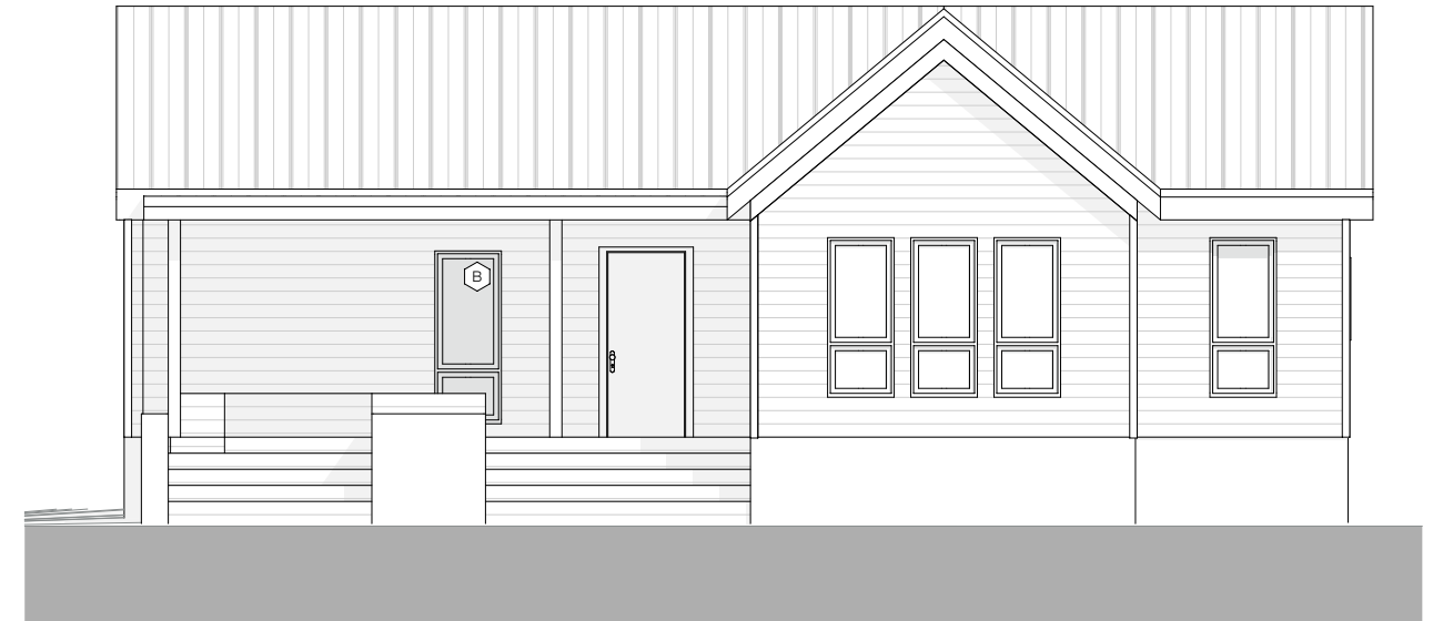
PROPOSED STREET ELEVATION