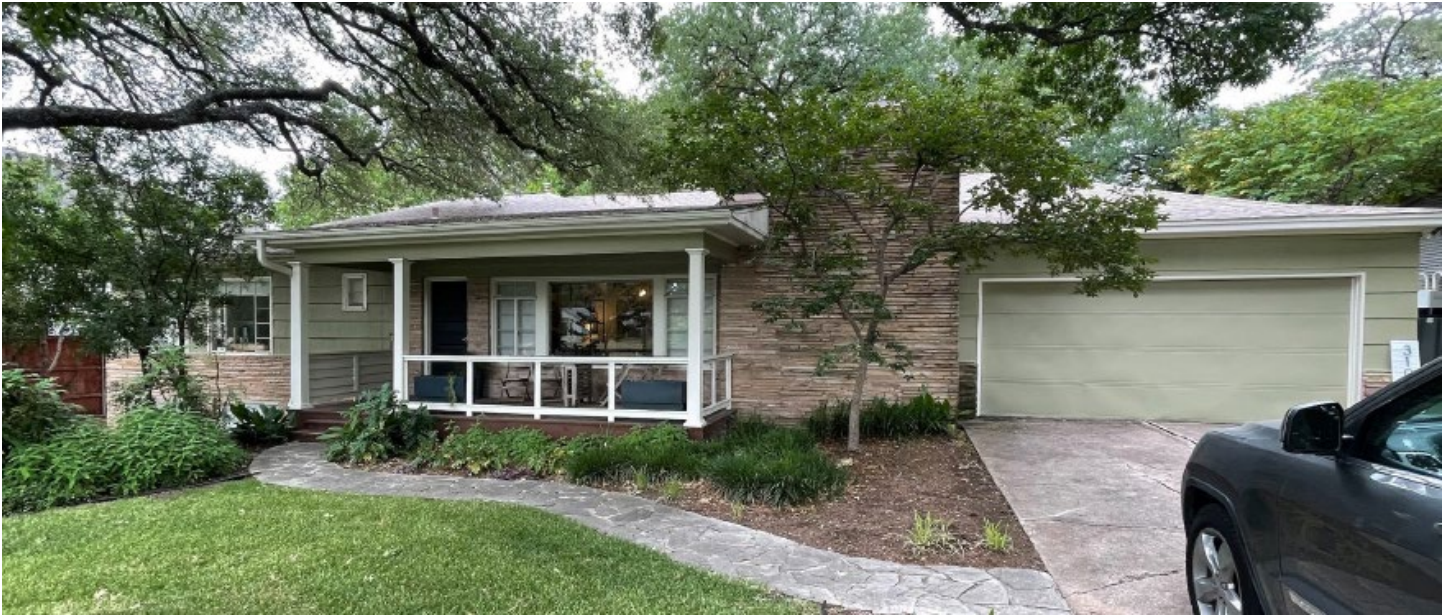
Demolition permit application, 2022