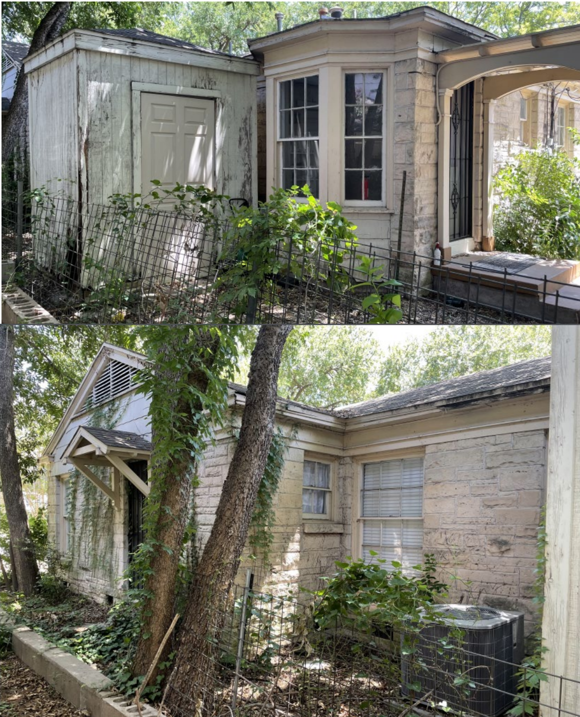
Demolition permit application, 2022