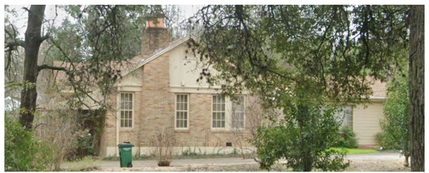
Google Street View, 2022