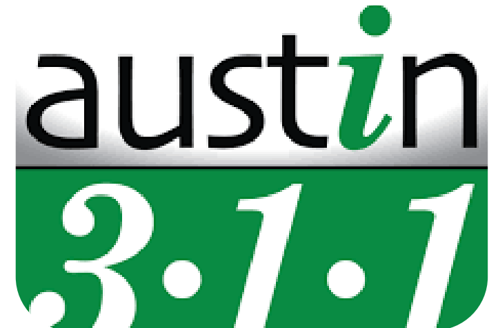
Customer Service Request System used by Austin 3-1-1