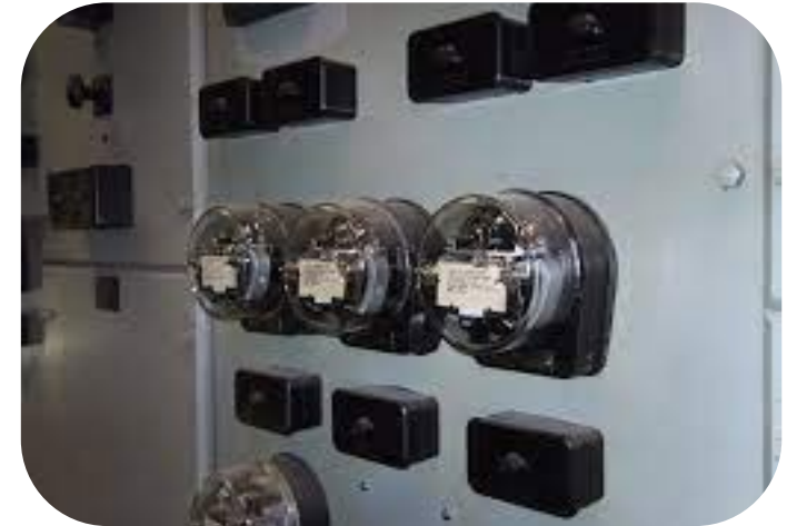
Protective Relays for Switchgear and Relay Panels