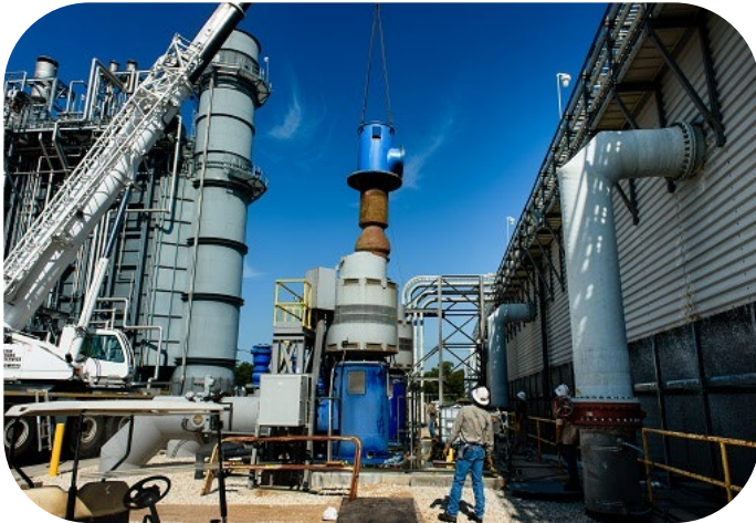
Power Production Maintenance