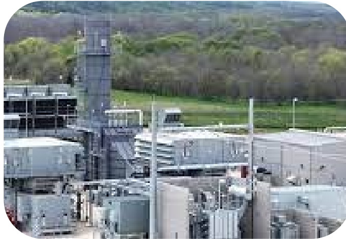
Air Inlet Chiller Maintenance & Repair