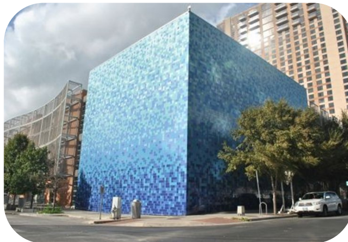
Heat Exchanger Skids used by Austin Energy chilled water customers