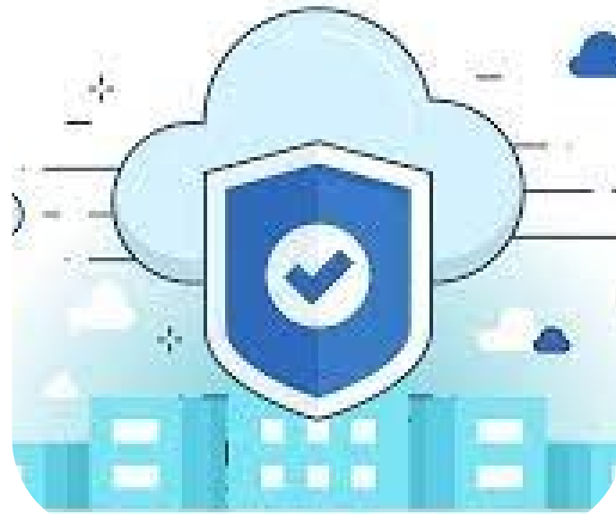
Technical Cloud Analytic Services