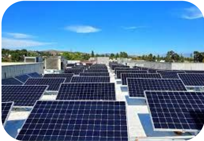
Production-Based Incentive for Customer-Sited Solar by a Commercial Customer