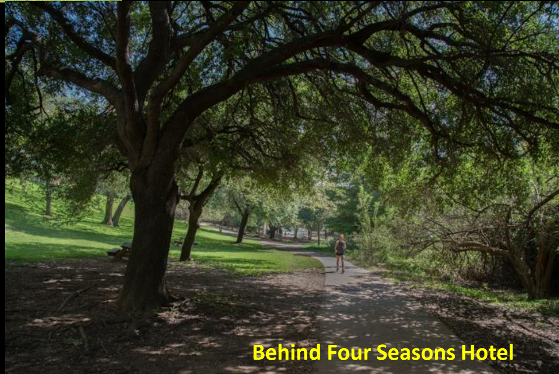
Behind Four Seasons Hotel

Brush trimming and landscaping along river walk