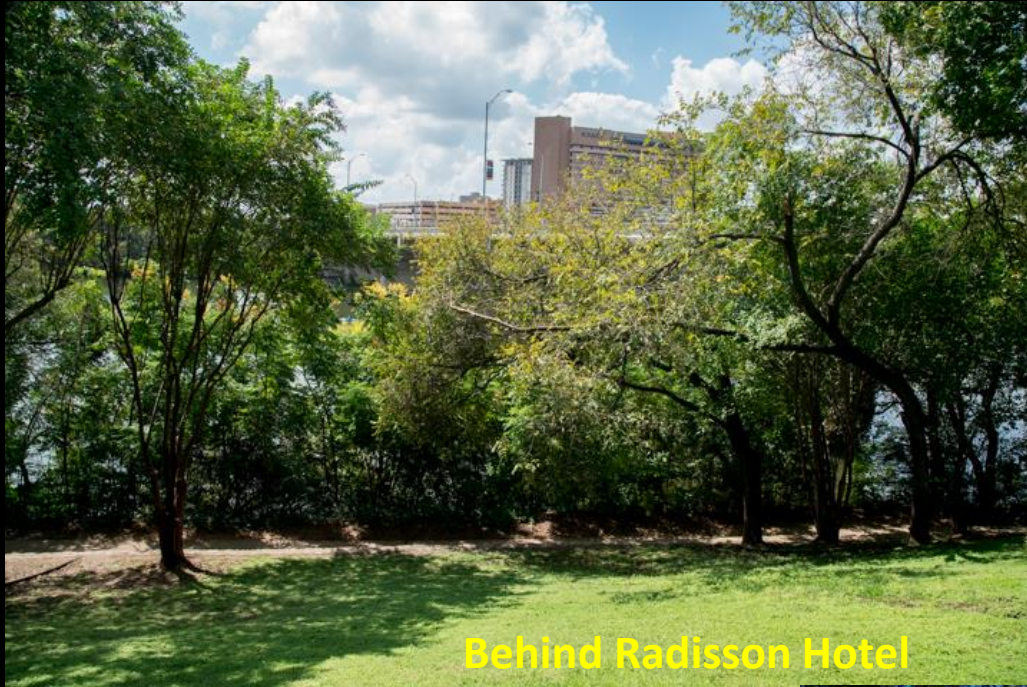
Behind Radisson Hotel

Brush trimming and landscaping along river walk