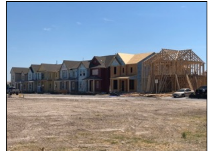
Section 11 Lots and Homes