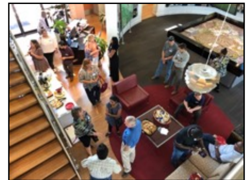
Networking event example