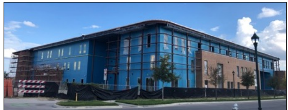
General Marshall Middle School site as of Sept 2022