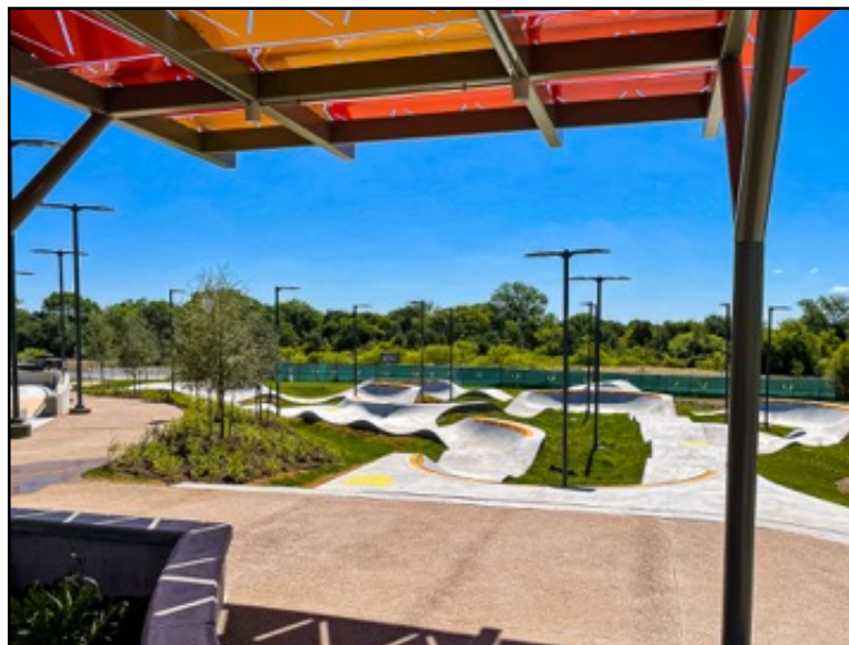
Pump Track at Southeast Greenway