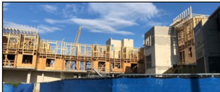
Austin Modern Lofts at Berkman