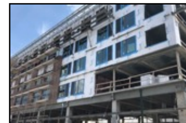
AMLI Branch Park