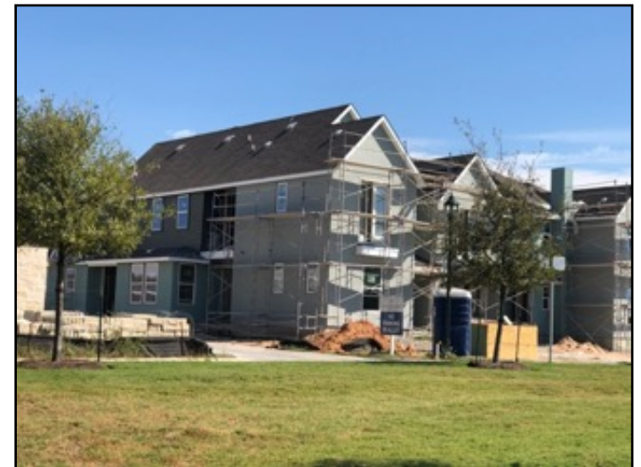
Mueller House Condos