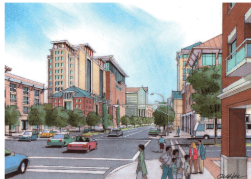
Typical examples of buildings in the Commercial Mixed Use Subdistrict.