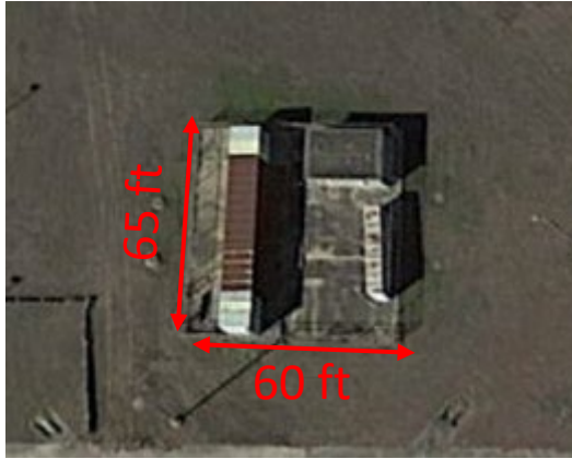
Existing Electrical Substation No.1