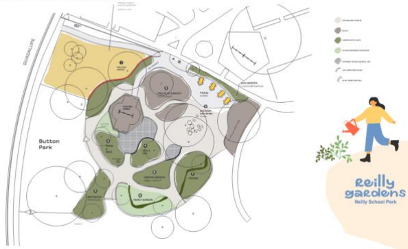
REILLY SEL GARDENS MATERIALS OVERVIEW