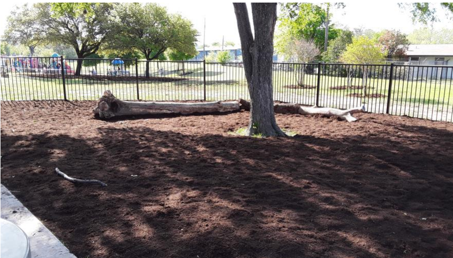
New nature play features at Mustang Button Park.