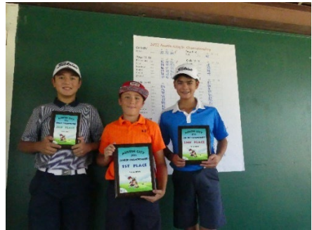
Senior, Senior Ladies and Junior City Champions