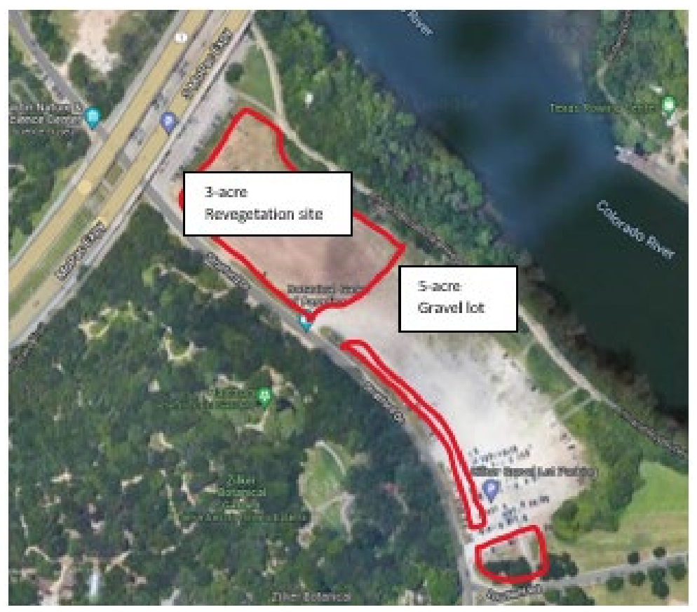
Arial view of the Zilker Metro Park Maintenance Project. The red outline indicates areas off-use to the public during the maintenance period.

Prescribed Burn at Onion Creek Wildlife Sanctuary: The Land Management Program conducted the first every park and recreation led prescribed burn at Onion Creek Wildlife Sanctuary. All burn plans are reviewed and permitted by the Austin Fire Department (AFD) as well as implemented in partnership with AFD and other partner land management agencies. The successful permitting of this burn plan shows the importance of a multi-agency effort to manage public natural resources and reduce fire risk across Austin across jurisdictional boundaries. Prescribed burns are a critical tool for restoring ecosystem health and mitigating wildfire risk. Members of the PARD Prescribed Burn Team attended training at the annual Texas Interagency Incident Management Academy at Camp Swift in October. Several others are planned and will occur when weather conditions are right, and resources are available. District 2