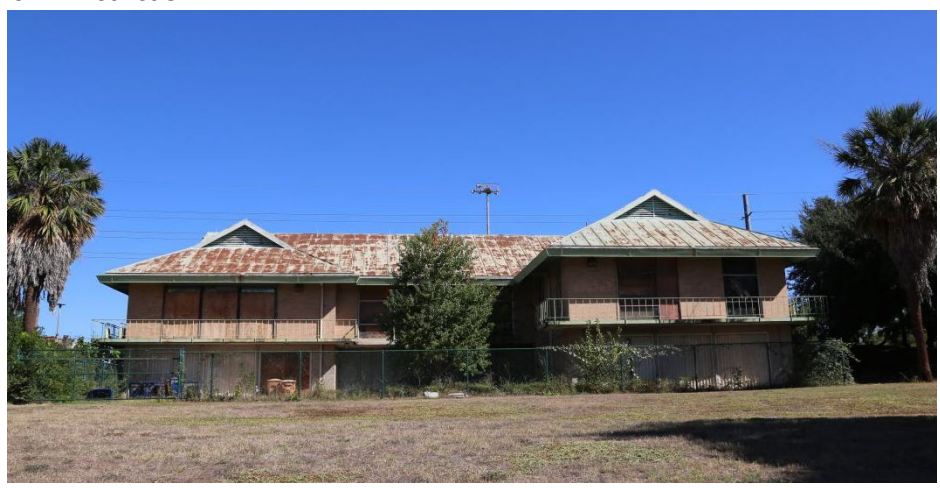
Nash Hernandez Building

Nash Hernandez Building Renovation: As a result of City Council Resolution 20220616-89, a report was issued to Council studying the feasibility and financial impact of an Intergenerational Resource and Activity Center (IRAC) program in the Nash Hernandez Building. Several factors were considered as part of this feasibility study, including the programmatic limitations of an IRAC due to the building's physical layout, the renovation costs due to the poor condition of the building, the building location relative to other resources for older adults and childcare, and the fact that funding sources for the design and construction of a pilot IRAC facility have not yet been identified. Council was updated via memo on October 17, 2022. District 3