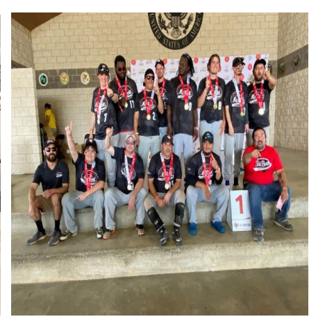
Special Olympic McBeth Participants Receiving Awards

Austin Nature and Science Center Ambassadors: Two new porcupines became ambassador animals at the Austin Nature and Science Center over the last month. They made their debut at Austin Museum Day on September 24, 2022, with more than 500 people in attendance and will be officially named at Fall Fest on November 12, 2022, at the Austin Nature and Science Center. The Friends of Austin Nature and Science Center are taking name suggestions through their Instagram. Name suggestions range from "Pins and Needles" to "Quilly Nelson." <a href="https://www.instagram.com/friendsofansc/">https://www.instagram.com/friendsofansc/</a>