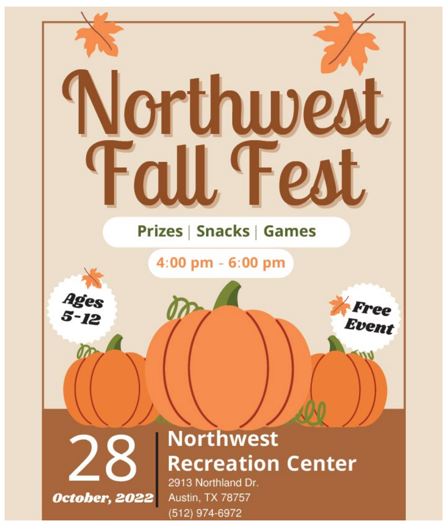
Northwest Fall Festival Flyer

Fall Festival: The Northwest Recreation Center will hold its first Fall Festival on Friday, October 28, 2022, from 4:00-6:00 PM. The event will include games, prizes and fun for all. Please visit <a href="https://doi.org/10.1001/jtms.com/">TTF Flyer.JPG</a> (540×822) (austintexas.gov) for more details.