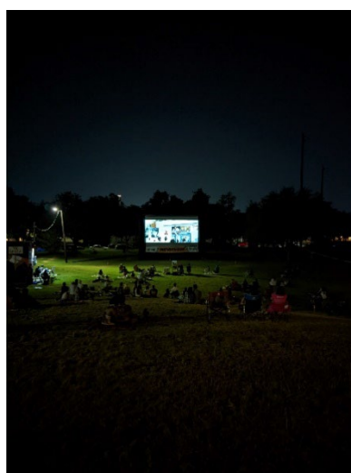
Pan Am Recreation Movies in the Park sponsored by the Austin Parks Foundation

Pumpkin Carving: The Parque Zaragoza Recreation Center will host a Pumpkin Carving event on Friday, October 21, 2022, from 6:30-8:30 PM. Games, prizes and fun for all.