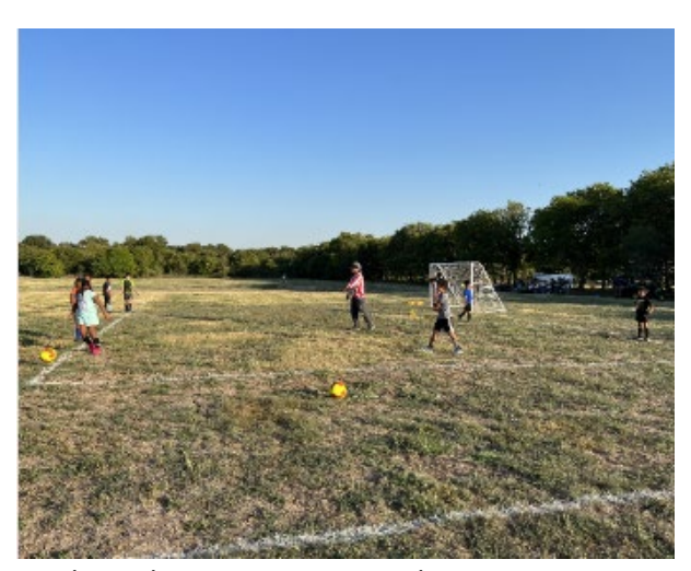
Soccer practices taking place at George Morales Dove Springs Recreation Center

Fall Youth Soccer: The George Morales Dove Springs Recreation Center fall youth soccer season kicked off on Saturday, October 8, 2022. This is the first youth soccer league to take place since the start of the pandemic in 2020. Parents, players and coaches are excited to be back to full league play. Currently, 95 participants are enrolled at the George Morales Dove Springs Recreation Center site. In total, 201 participants are enrolled between all the south district recreation sites.