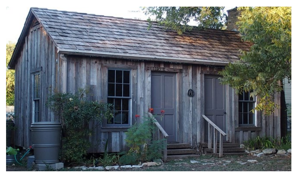
Haskell House