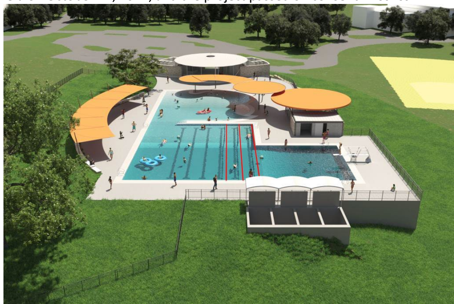
Rendering, Givens Aquatic Facility

Givens Aquatic Facility: The renovation for the aquatic facility is currently in the Site Plan permitting stage. This requires a hearing before the Planning Commission as part of the approval process. The meeting was held on October 11, 2022, and the project passed on consent. District 1