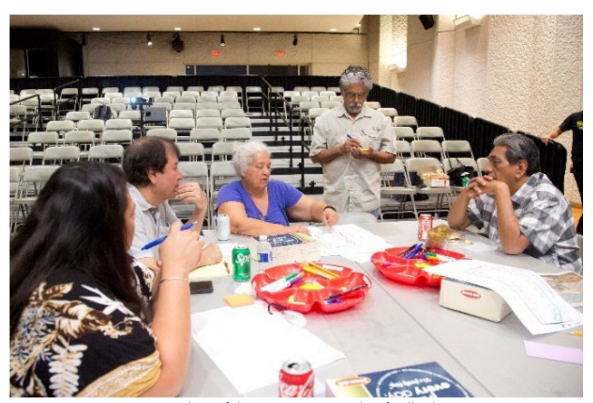
Members of the community providing feedback

64 Rainey Street Community Community Engagement: The Emma S. Barrientos Mexican American Cultural Center (ESB MACC) and the Advisory Board held a community engagement event on Thursday, September 29, 2022, to get feedback for the 64 Rainey Street property. After years of leasing the space for staging for the high-rise at 70 Rainey Street, the lot at 64 Rainey Street is now available to develop into a meaningful park space for visitors. Under the guidance of <a href="City Council Resolution no. 20220609-123">City Council Resolution no. 20220609-123</a>, the Parks and Recreation Department in collaboration with the Mexican American Cultural Center Advisory Board (MACC Board) sought community input on this future park space. The results will be shared with the City Council to prioritize funding. There were 27 people in attendance. The project website can be found at <a href="https://www.austintexas.gov/department/64-rainey-street-park-planning">https://www.austintexas.gov/department/64-rainey-street-park-planning</a>.