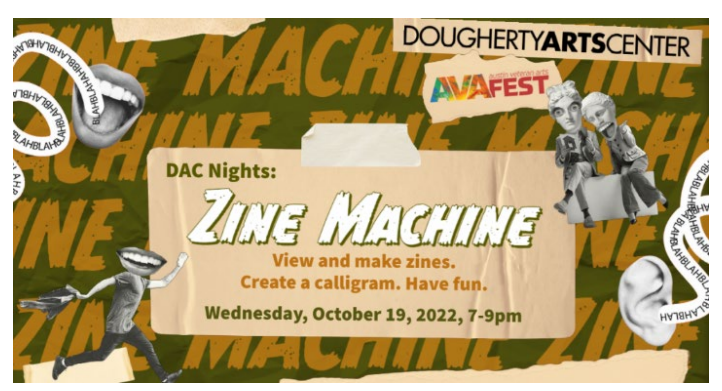
Dougherty Arts Center Community Night Banner

Austin Veterans Arts Festival Zine Machine: Dive into a world of zines and calligrams at our upcoming event Dougherty Arts Center Community Night: Austin Veterans Arts Festival Zine Machine on Wednesday, October 19, 2022, 7:00-9:00 PM. Create a reproduceable mini zine, discover a new form of expression, view select zines from Austin's Central Library's Zine Catalogue, and sign up for a Library Card. This event is part of the fourth annual Austin Veterans Arts Festival, created by the Veterans Suicide Prevention Channel to use the arts to promote wellness in Veterans. Attending Veterans will receive free therapeutic arts and craft kits provided by the Help Heal Veterans organization. There were 50 people in attendance. For more information, visit <a href="https://www.austintexas.gov/page/dougherty-arts-center-programs-and-events">https://www.austintexas.gov/page/dougherty-arts-center-programs-and-events</a>.