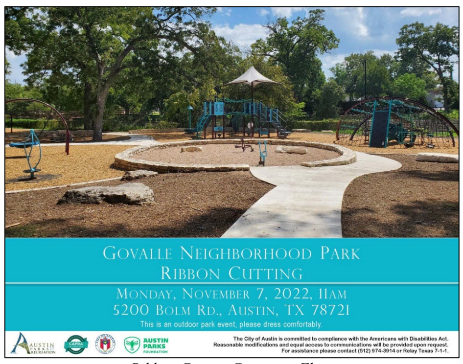
Ribbon Cutting Ceremony Flyer

Govalle Neighborhood Park Ribbon Cutting: The Department will host a ribbon-cutting event at Govalle Neighborhood Park on November 7<sup>th</sup> in partnership with Austin Parks Foundation (APF). Attendees will celebrate the renovation of the playground area and the installation of a new multi-purpose field that was made possible in part through APF board-designated Austin City Limits funding. APF and the Department collaborated with the community to develop the design of the new playground and the scope of the improvements throughout the park. The event is open to the community and Council Member attendance is anticipated. Additional funding was provided by the Tres Grace Foundation, Jay Paul Company (Tank Farm), Hershey Funding, Urban Forestry Grant, and Parkland Dedication fees. District 3