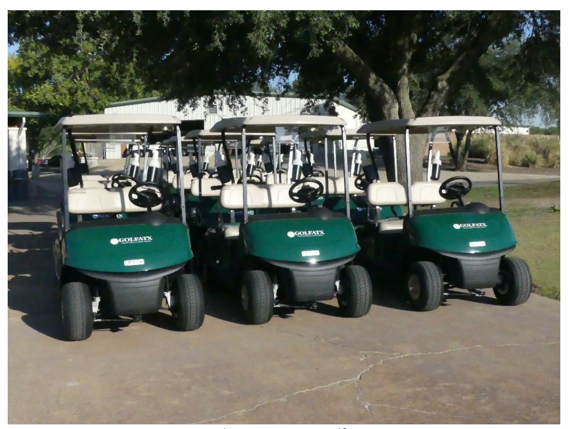
Brand New GOLFATX Golf Carts

New Golf Carts have Arrived: The golf division's new golf cart fleet began arriving the week of Sept 24, 2022. Lions Municipal and Grey Rock golf courses will receive their new fleet of golf carts in late October and December respectively. The new carts feature USB charging portals, the Golf ATX logo and electronic parking brakes. Districts 1, 2, 8 and 10