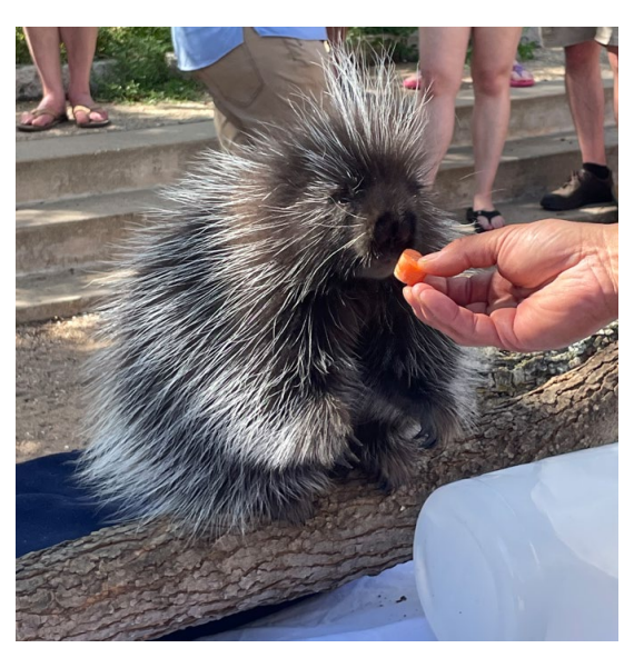
One of the newest animal ambassadors at the Austin Nature and Science Center

Austin Nature and Science Center Ambassadors: Two new porcupines became ambassador animals at the Austin Nature and Science Center over the last month. They made their debut at Austin Museum Day on September 24, 2022, with more than 500 people in attendance and will be officially named at Fall Fest on November 12, 2022, at the Austin Nature and Science Center. The Friends of Austin Nature and Science Center are taking name suggestions through their Instagram. Name suggestions range from "Pins and Needles" to "Quilly Nelson." <a href="https://www.instagram.com/friendsofansc/">https://www.instagram.com/friendsofansc/</a>