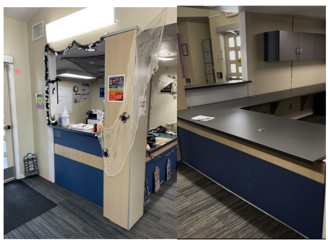
Alamo Recreation Center Front Desk

Alamo Recreation Center : The front desk/administrative office received a much-needed upgrade. Staff worked closely with department maintenance staff and the contractor to demo, design, and install a more inclusive, ADA accessible space that's both inviting and more functional. Additionally, new flooring was installed to address mobility concerns for the Senior participants and those in walkers/wheelchairs. District 1