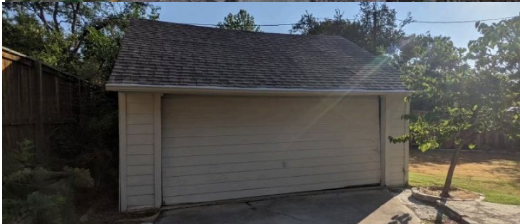
Demolition permit application, 2022