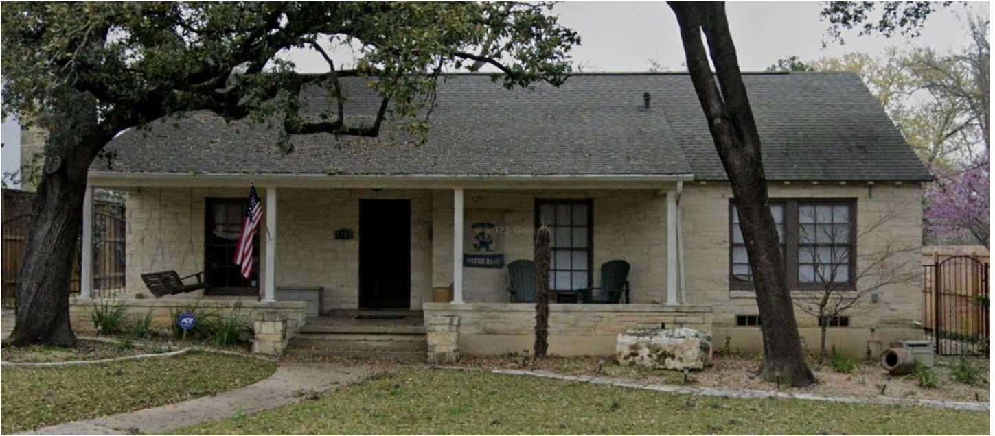
Google Street View, 2022