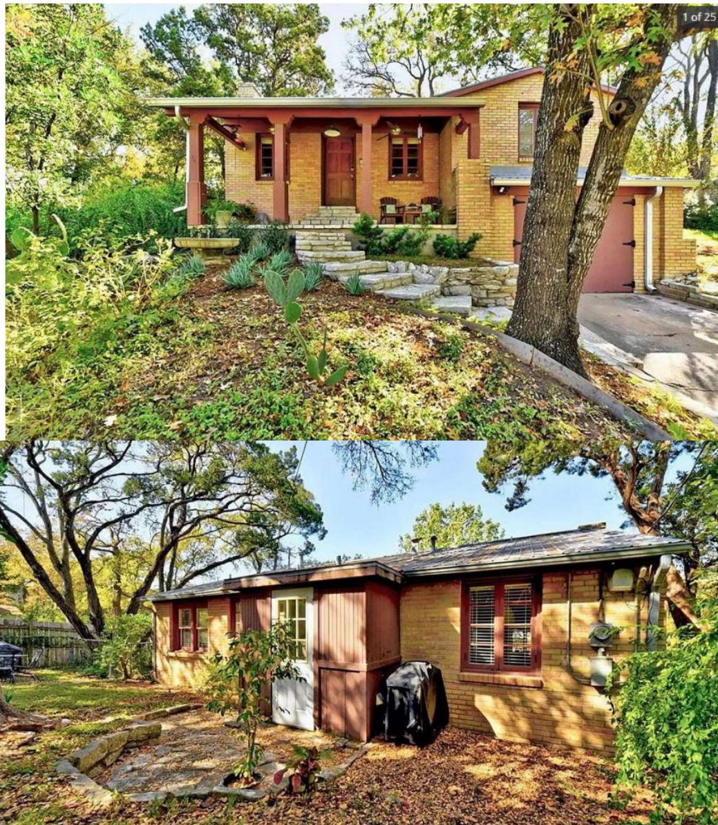
Demolition permit application, 2022