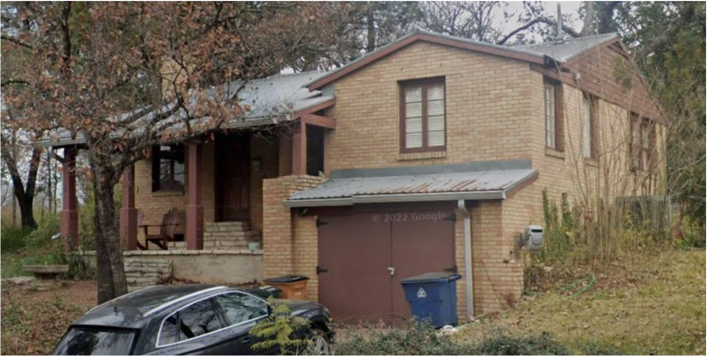
Google Street View, 2022