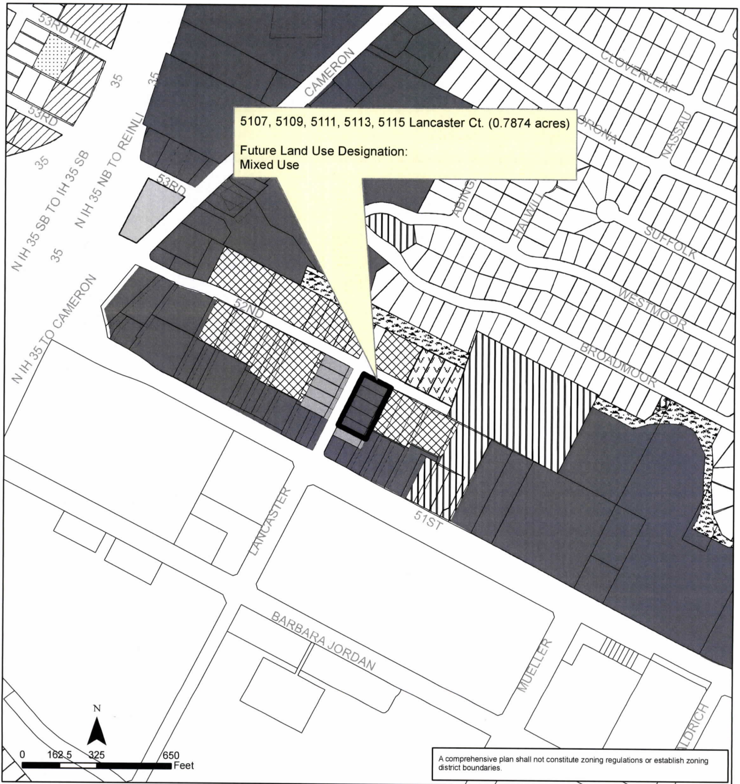
Exhibit A University Hills/Windsor Park Combined (Windsor Park) Neighborhood Planning Area NPA-2022-0023.01.SH

This product is for informational purposes and may not have been prepared for or be suitable for legal, engineering, or surveying purposes. It does not represent an on-the-ground survey and represents only the approximate relative location of property boundaries.