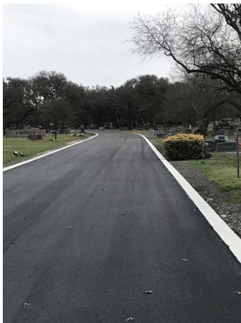
Road repavement at Austin Memorial Park