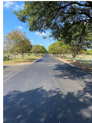
Road repavement at Evergreen Cemetery