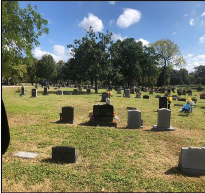
City of San Antonio Cemetery

City of Austin Cemeteries is seeking uniform and consistent rules and regulations similar to other City Municipalities.