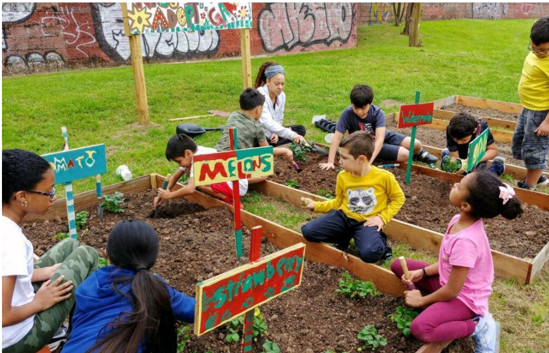
Above: Children's Adopt-A-Garden program

Kids, some of whom may not have any gardening experience, get the chance to learn about their natural environment and explore it in a new, hands-on way. The program works to encourage curiosity in growing their food and learning about new species of edible plants that they otherwise wouldn't be introduced to. Additionally, TTC helps to maintain these beds year-round.