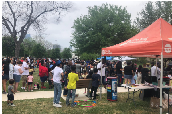
Above: Holly Trail ribbon cutting ceremony and Chicano Park Egg Hunt