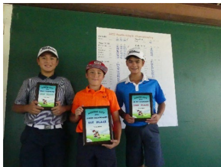
Senior, Senior Ladies and Junior City Champions