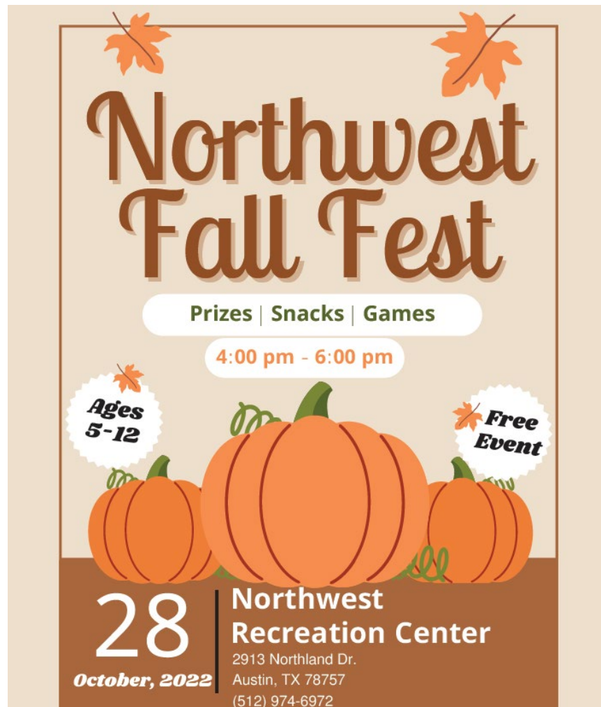
Northwest Fall Festival Flyer

Fall Festival: The Northwest Recreation Center will hold its first Fall Festival on Friday, October 28, 2022, from 4:00-6:00 PM. The event will include games, prizes and fun for all. Please visit TTF Flyer.JPG (540×822) ( austintexas.gov ) for more details.