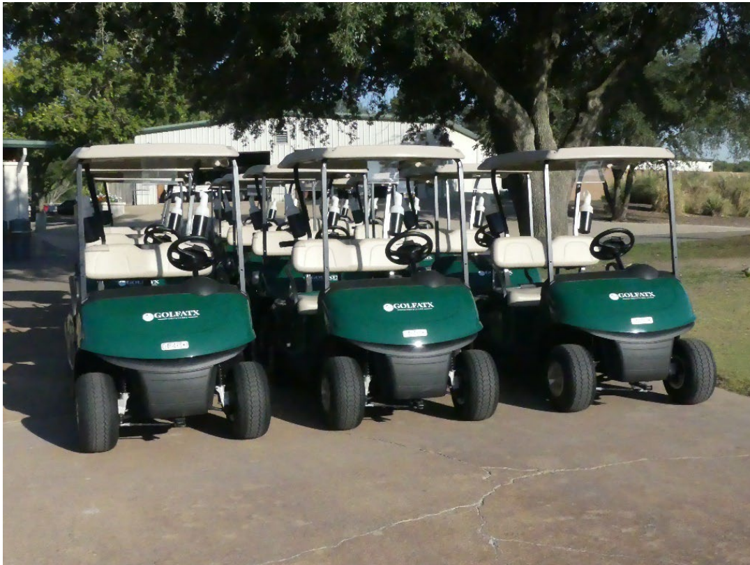
Brand New GOLFATX Golf Carts

New Golf Carts have Arrived: The golf division's new golf cart fleet began arriving the week of Sept 24, 2022. Lions Municipal and Grey Rock golf courses will receive their new fleet of golf carts in late October and December respectively. The new carts feature USB charging portals, the Golf ATX logo and electronic parking brakes. Districts 1, 2, 8 and 10