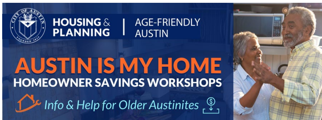
Promotional Flyer for Housing & Planning Workshop Series

Tax Exemption Community Meeting: The George Morales Dove Springs Recreation Center hosted a Senior Homestead Tax Exemption Community Meeting on Saturday, October 8, 2022, from 9:30 AM to 12:00 PM. Austin Public Health will work in collaboration with the Dove Springs staff to facilitate an educational workshop on financial assistance for 30 seniors.