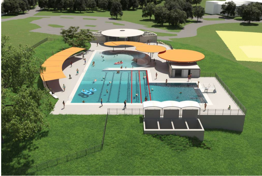
Rendering, Givens Aquatic Facility

Givens Aquatic Facility: The renovation for the aquatic facility is currently in the Site Plan permitting stage. This requires a hearing before the Planning Commission as part of the approval process. The meeting was held on October 11, 2022, and the project passed on consent. District 1