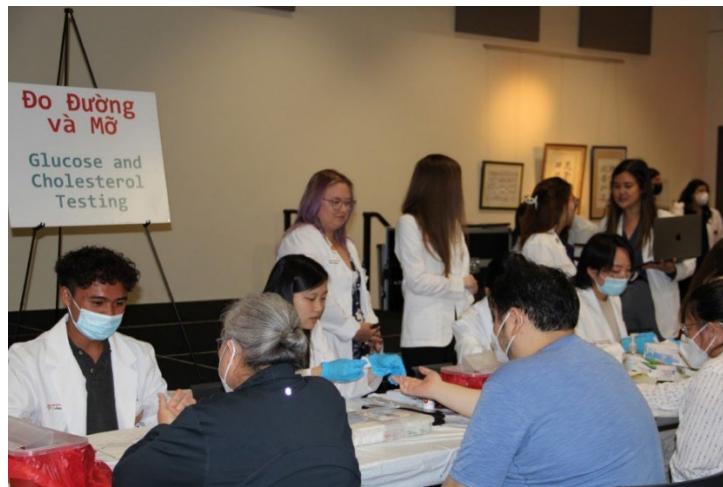
UT Pharmacy volunteers conducting Glucose and Cholesterol Testing

Asian American Resource Center's AVAMPS Health Fair: The Asian American Resource Center (AARC) began the new fiscal year with a first time Community Health Fair in collaboration with the Austin Vietnamese American Medical Professional Society (AVAMPS). The event took place on Saturday, October 1, 2022, with multilingual language support for Vietnamese, Korean, Chinese, Burmese, and Spanish speaking groups. This is the first time the event has been in collaboration with the AARC, allowing broader access to other Asian and non-Asian groups. Some of the services provided included vision, dental, cholesterol, blood pressure, and glucose screening, CPR education, and tabling by community organizations such as Light & Salt and Asian American Community Health Initiative (AACHI). Additionally, Austin Public Health administered 81 flu shots, 50 COVID-19 vaccines, and the University of Texas (UT) Pharmacy conducted 120 health screenings. 150 people across six ethnic groups attended the event, in addition to 124 volunteers, staff, and vendors.