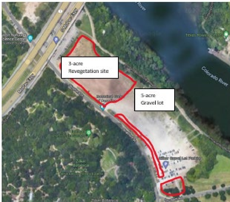
Aerial view of the Zilker Metro Park Maintenance Project. The red outline indicates areas off-use to the public during the maintenance period.

Prescribed Burn at Onion Creek Wildlife Sanctuary: The Land Management Program conducted the first every park and recreation led prescribed burn at Onion Creek Wildlife Sanctuary. All burn plans are reviewed and permitted by the Austin Fire Department (AFD) as well as implemented in partnership with AFD and other partner land management agencies. The successful permitting of this burn plan shows the importance of a multi-agency effort to manage public natural resources and reduce fire risk across Austin across jurisdictional boundaries. Prescribed burns are a critical tool for restoring ecosystem health and mitigating wildfire risk. Members of the PARD Prescribed Burn Team attended training at the annual Texas Interagency Incident Management Academy at Camp Swift in October. Several others are planned and will occur when weather conditions are right, and resources are available. District 2