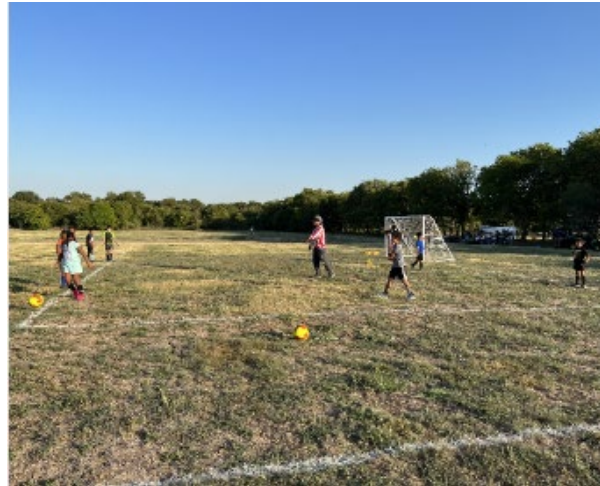
Soccer practices taking place at George Morales Dove Springs Recreation Center

Fall Youth Soccer: The George Morales Dove Springs Recreation Center fall youth soccer season kicked off on Saturday, October 8, 2022. This is the first youth soccer league to take place since the start of the pandemic in 2020. Parents, players and coaches are excited to be back to full league play. Currently, 95 participants are enrolled at the George Morales Dove Springs Recreation Center site. In total, 201 participants are enrolled between all the south district recreation sites.