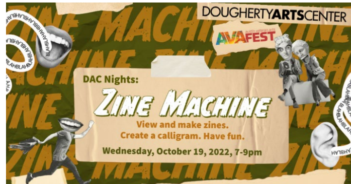
Dougherty Arts Center Community Night Banner

Austin Veterans Arts Festival Zine Machine: Dive into a world of zines and calligrams at our upcoming event Dougherty Arts Center Community Night: Austin Veterans Arts Festival Zine Machine on Wednesday, October 19, 2022, 7:00-9:00 PM. Create a reproduceable mini zine, discover a new form of expression, view select zines from Austin's Central Library's Zine Catalogue, and sign up for a Library Card. This event is part of the fourth annual Austin Veterans Arts Festival, created by the Veterans Suicide Prevention Channel to use the arts to promote wellness in Veterans. Attending Veterans will receive free therapeutic arts and craft kits provided by the Help Heal Veterans organization. There were 50 people in attendance. For more information, visit https://www.austintexas.gov/page/dougherty-arts-center-programs-and-events .