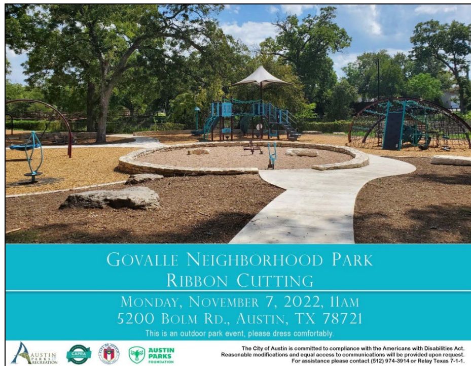
Ribbon Cutting Ceremony Flyer

Asian American Resource Center Phase 2 Design Reveal: The AARC Phase 2 project team will host a hybrid meeting revealing the schematic design on Thursday, November 17. The design will include a theater, multi-purpose space, gallery space, and parking alignment. The schematic design was developed based on the 2019 Facility Expansion Plan and community input provided through engagement opportunities throughout 2022. Attendees will be asked to share their reactions and feedback on the design. Additional opportunity for feedback will be available after the meeting for people who are unable to attend in-person or virtually.