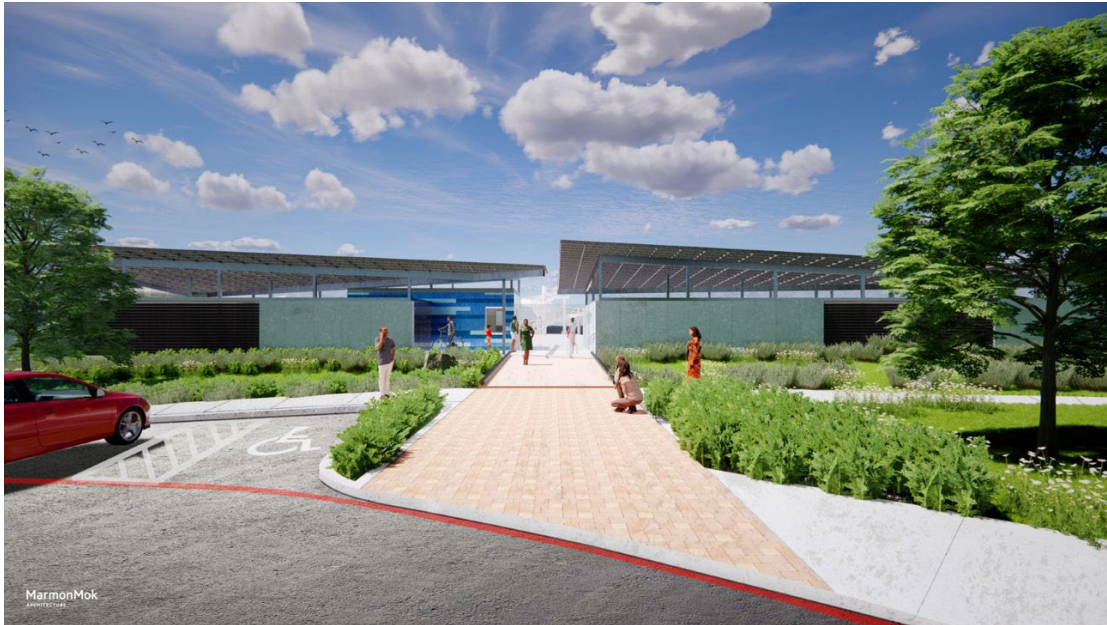
Rendering, Colony Park Aquatic Facility

Colony Park Aquatic Facility: The new aquatic facility planned for Colony Park is in the Site Plan permitting stage. This requires a hearing before the Zoning and Platting Commission as part of the approval process. The meeting was held October 18, 2022 and the project passed on consent. District 1