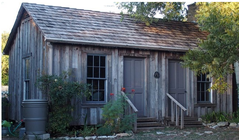
Haskell House