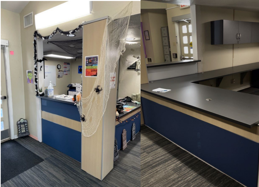
Alamo Recreation Center Front Desk

Parque Zaragoza Recreation Center Irrigation Project: The irrigation project at Parque Zaragoza Recreation Center is finally complete. The addition of outdoor irrigation for the recreation center's ballfield will provide much needed maintenance and services for the highly utilized field. Over the past two years, the site's ball field has implemented major improvements with the help of RBI to include new netting, the addition of batting cages, improved ball field lighting by Musco lights LLC, as well as field maintenance and oversight provided by the Dell Diamond field crew. District 1