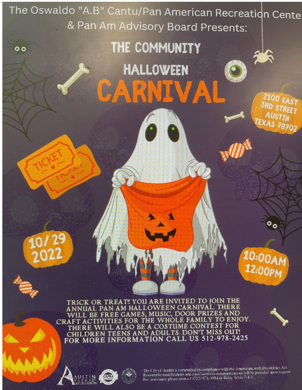
Community Halloween Carnival Flyer

Halloween Carnival: The Pan Am Recreation Center will host their Community Halloween Carnival on Saturday, October 29, 2022, from 10:00 AM-12:00 PM. Games, music, door prizes and craft activities for all.