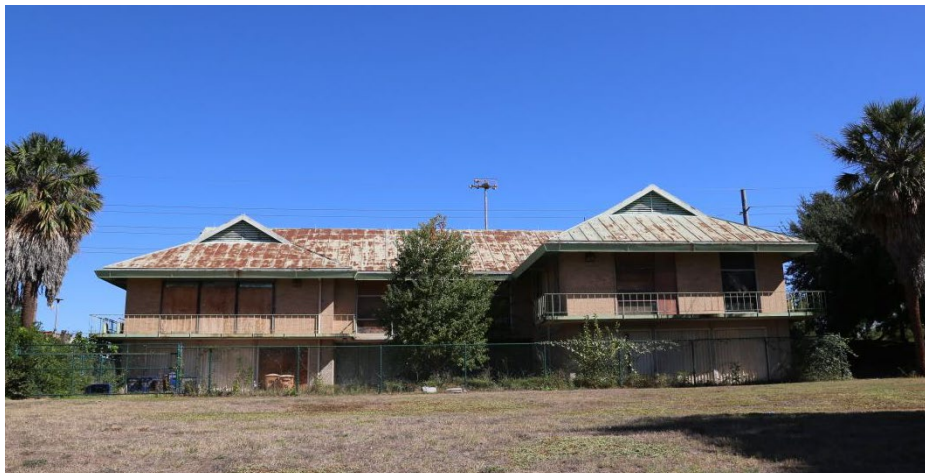
Nash Hernandez Building

Nash Hernandez Building Renovation: As a result of City Council Resolution 20220616-89 , a report was issued to Council studying the feasibility and financial impact of an Intergenerational Resource and Activity Center (IRAC) program in the Nash Hernandez Building. Several factors were considered as part of this feasibility study, including the programmatic limitations of an IRAC due to the building's physical layout, the renovation costs due to the poor condition of the building, the building location relative to other resources for older adults and childcare, and the fact that funding sources for the design and construction of a pilot IRAC facility have not yet been identified. Council was updated via memo on October 17, 2022. District 3