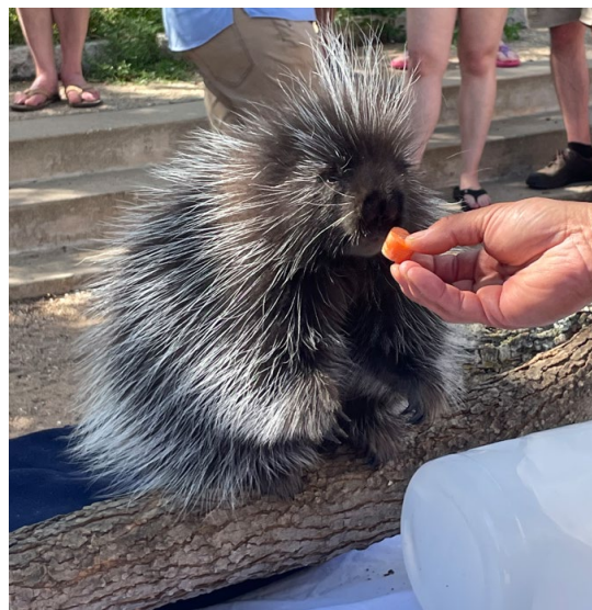
One of the newest animal ambassadors at the Austin Nature and Science Center

Austin Nature and Science Center Ambassadors: Two new porcupines became ambassador animals at the Austin Nature and Science Center over the last month. They made their debut at Austin Museum Day on September 24, 2022, with more than 500 people in attendance and will be officially named at Fall Fest on November 12, 2022, at the Austin Nature and Science Center. The Friends of Austin Nature and Science Center are taking name suggestions through their Instagram. Name suggestions range from “Pins and Needles” to “Quilly Nelson.” https://www.instagram.com/friendsofansc/