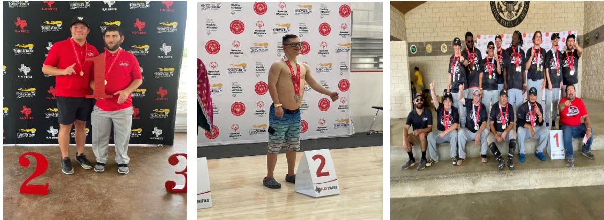
Special Olympic McBeth Participants Receiving Awards

Austin Nature and Science Center Ambassadors: Two new porcupines became ambassador animals at the Austin Nature and Science Center over the last month. They made their debut at Austin Museum Day on September 24, 2022, with more than 500 people in attendance and will be officially named at Fall Fest on November 12, 2022, at the Austin Nature and Science Center. The Friends of Austin Nature and Science Center are taking name suggestions through their Instagram. Name suggestions range from “Pins and Needles” to “Quilly Nelson.” https://www.instagram.com/friendsofansc/