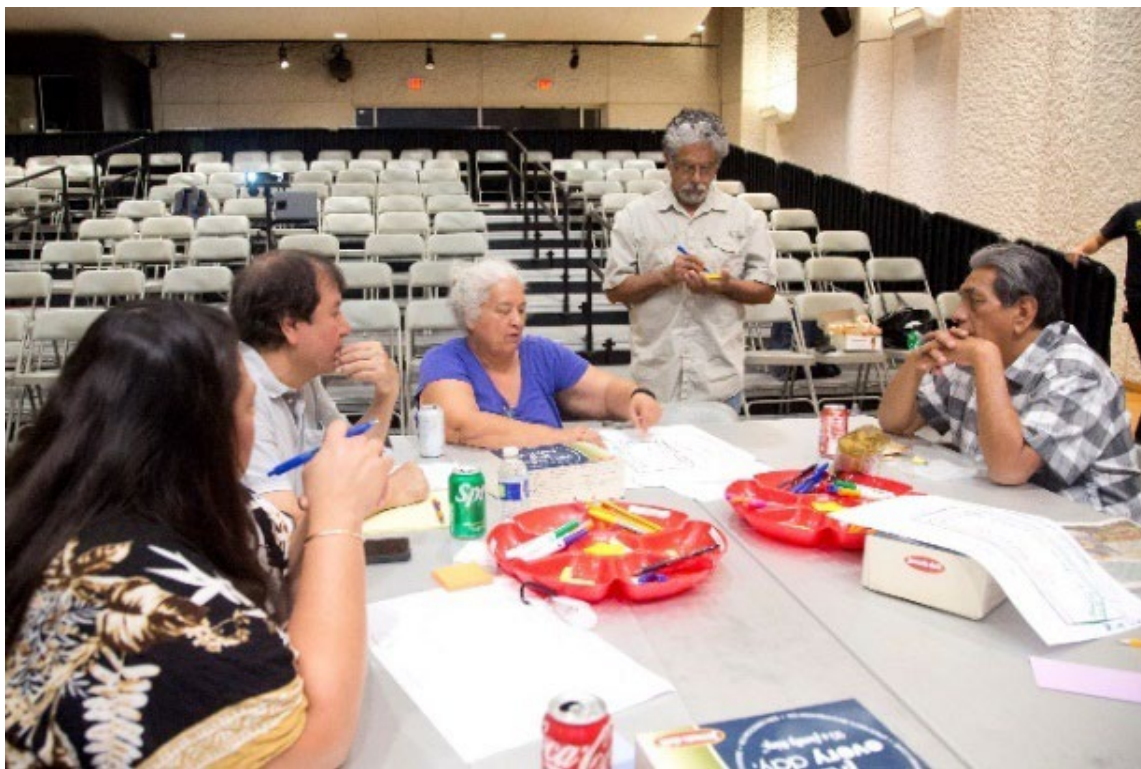
Members of the community providing feedback

64 Rainey Street Community Community Engagement: The Emma S. Barrientos Mexican American Cultural Center (ESB MACC) and the Advisory Board held a community engagement event on Thursday, September 29, 2022, to get feedback for the 64 Rainey Street property. After years of leasing the space for staging for the high-rise at 70 Rainey Street, the lot at 64 Rainey Street is now available to develop into a meaningful park space for visitors. Under the guidance of City Council Resolution no. 20220609-123 , the Parks and Recreation Department in collaboration with the Mexican American Cultural Center Advisory Board (MACC Board) sought community input on this future park space. The results will be shared with the City Council to prioritize funding. There were 27 people in attendance. The project website can be found at https://www.austintexas.gov/department/64-rainey-street-park-planning .