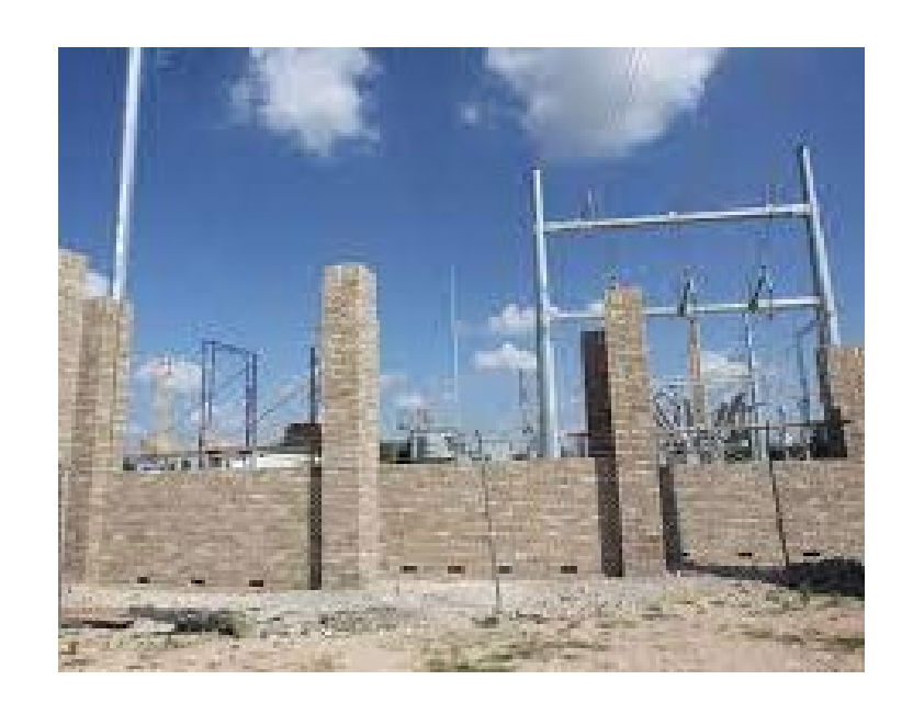
High Voltage Circuit Breakers