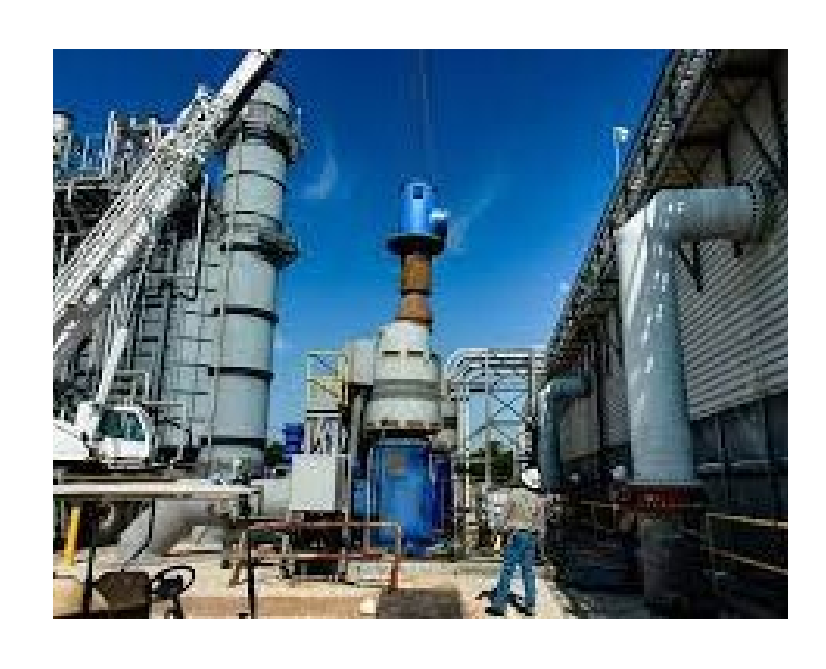
Updates to the Control System at Sand Hill Energy Center