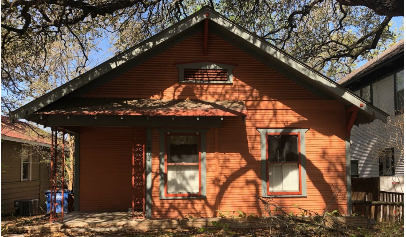
Demolition Permit Application, 2022