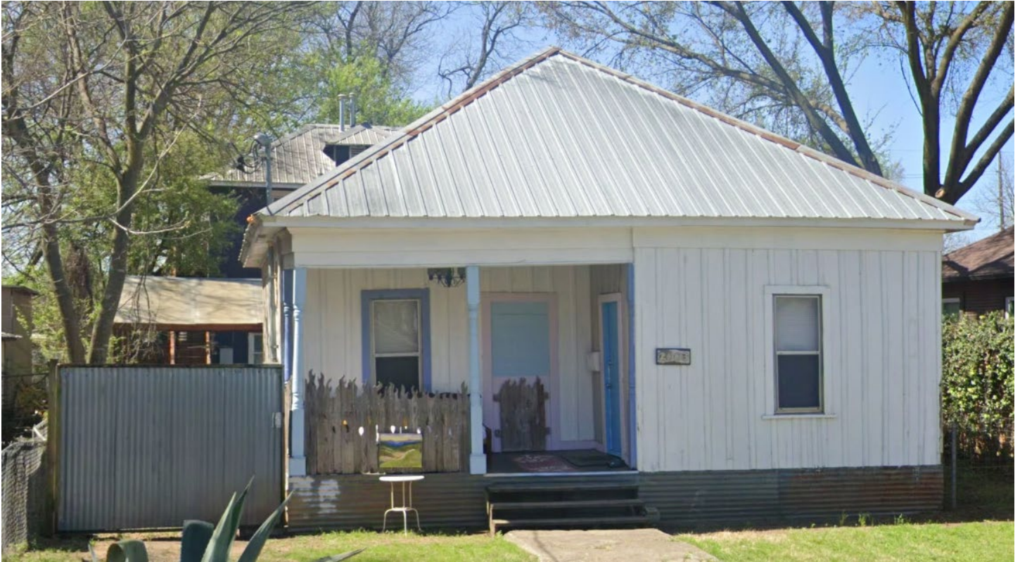
Google Street View, 2022