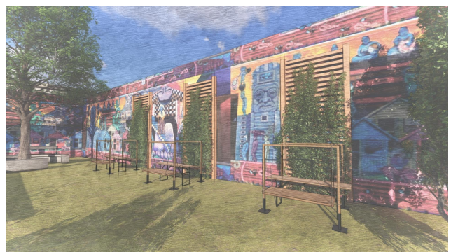
Interactive seating against wall