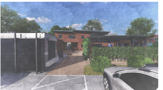
Entrance from parking lot