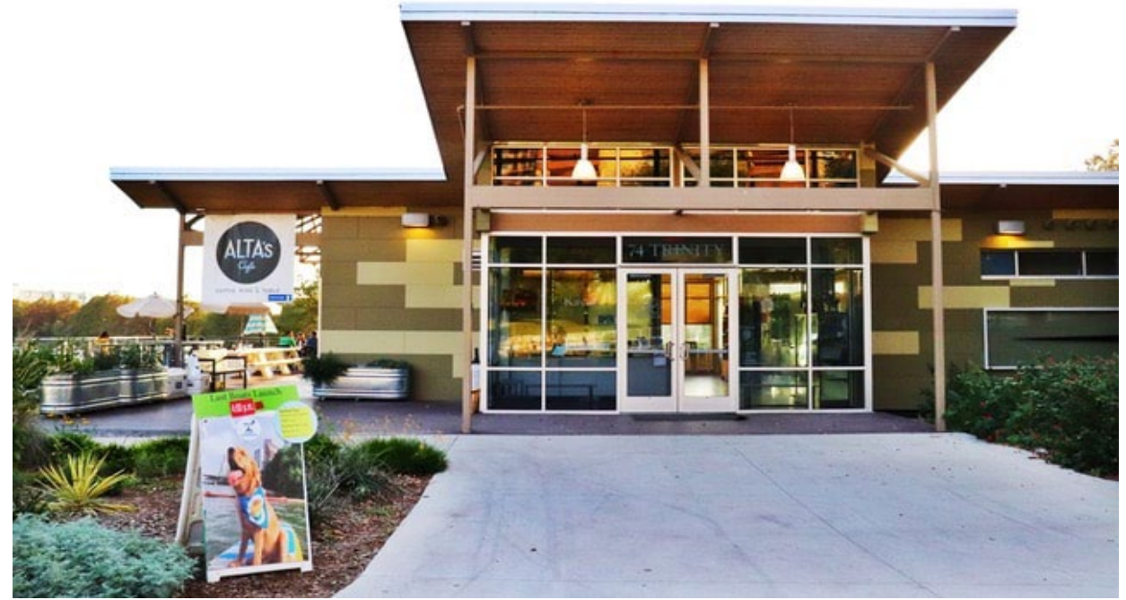
Waller Creek Boathouse, 74 Trinity Street, street facade