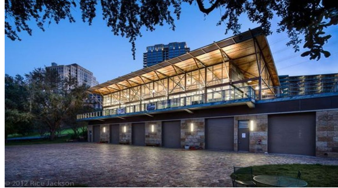
Waller Creek Boathouse, lake facade