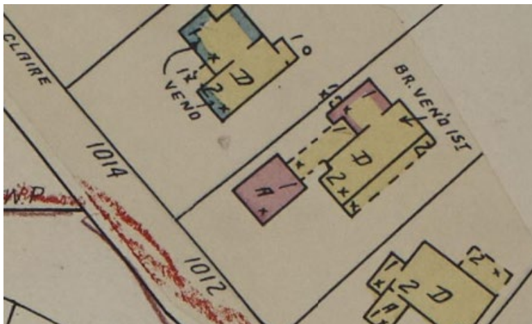
Sanborn map, 1962