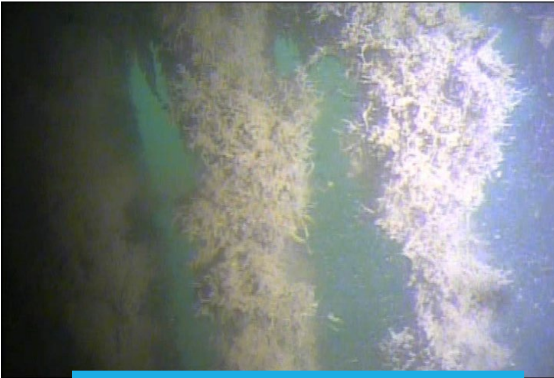
Typical soft growth on Ullrich Trash Rack