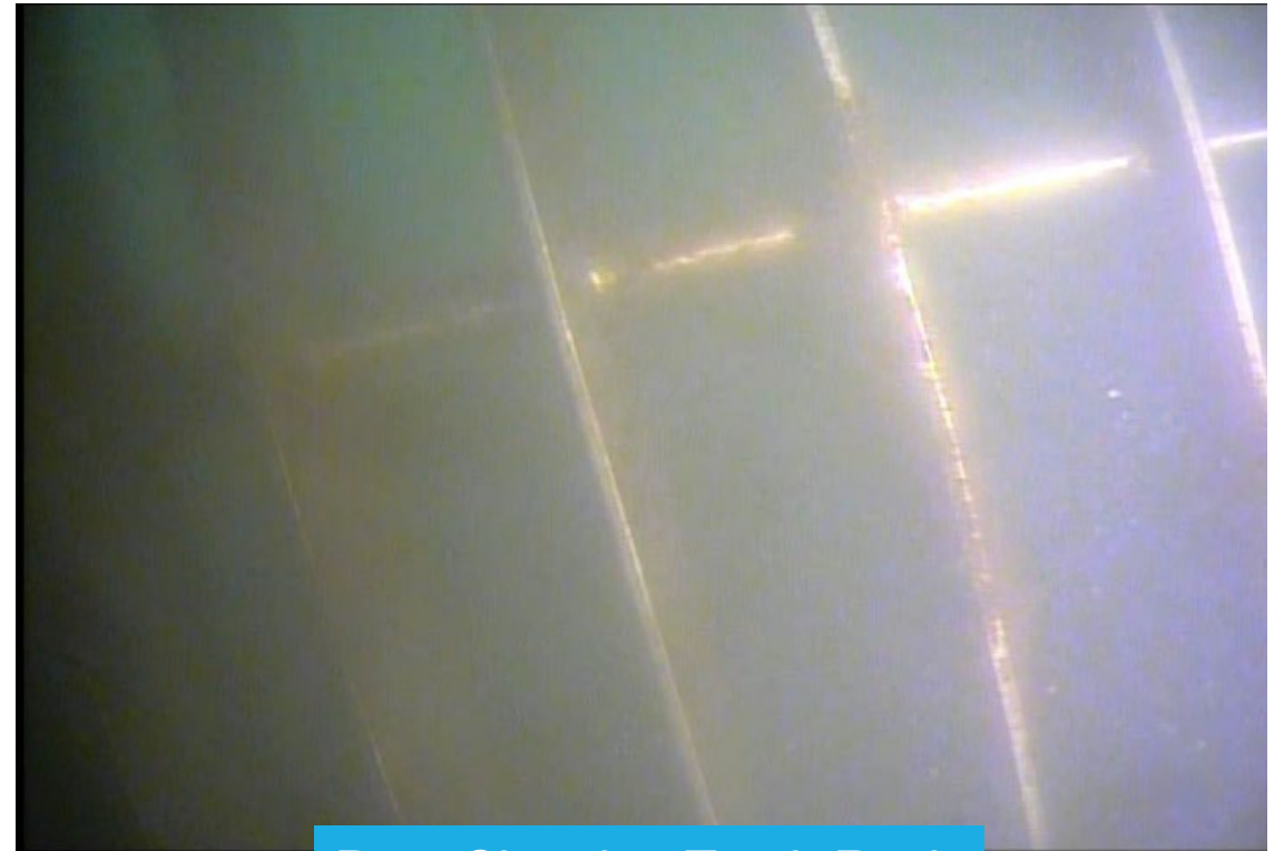
Post-Cleaning Trash Rack