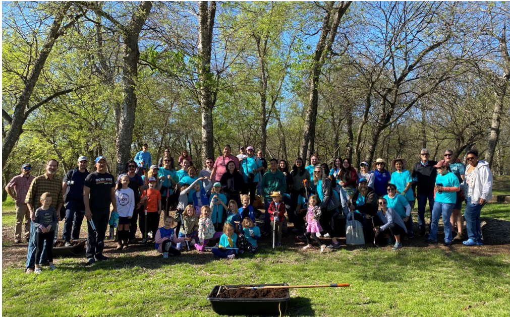
Group photo of volunteers at Kendra Page Neighborhood Park

It's My Park Day Spring 2023 Update: On Saturday, March 11 th , It's My Park Day occurred across Austin with 84 volunteer projects. With Department staff leading many volunteer efforts around Austin to prioritize high-need sites found within our Nature Equity Map , equity was at the forefront. Together, teams collected 42,500 pounds of trash, and spread 663 cubic yards of mulch, which runs as long as 6.63 football fields. Additionally, over 3,300 volunteers contributed nearly $300,000 to our parks through the Department's partnership with Austin Parks Foundation. All Districts