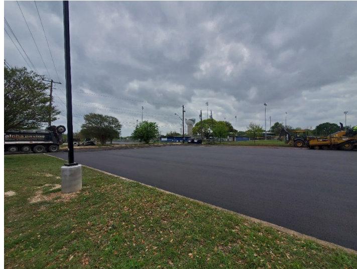
Fresh asphalt at the Delwood Sport Complex

Bartholomew Park/Delwood Sport Complex Parking Lot Repairs: As part of the Department Asphalt IDIQ Contract, the department was able to prioritize parking lot improvements in time for Youth Baseball and Softball Opening Day at Delwood Sports Complex on March 25 th . Asphalt repairs, overlay, and new parking stripes were completed on March 22 nd . On March 29 th , after the new asphalt has cured, a sealcoat will be applied to the entire parking lot to provide a uniform and finished look. The project cost approximately $70,000 total and was funded by 2018 Bonds for Parking & Road Improvements. District 4