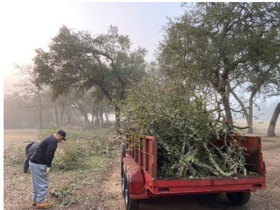
Golf ATX Crews Cleaning Up Storm Debris at Grey Rock and Jimmy Clay Golf Courses