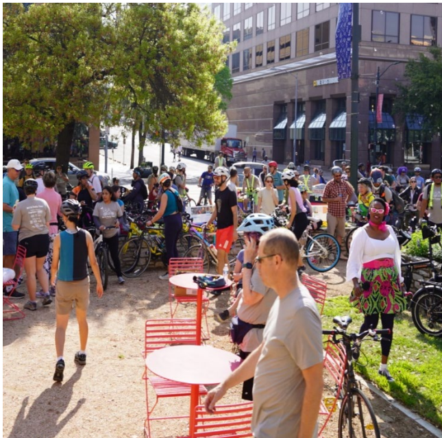
Old Bakery & Emporium Park During Bike Mural Tour

Old Bakery & Emporium Bike Mural Tour: On March 11 th , at 10:30 a.m., the Bike Mural Tour participants arrived at the Old Bakery & Emporium to hear about a future mural on the North side of the Old Bakery & Emporium Building. Participants were asked to take part in a survey that included different types of murals that viewers may be interested in seeing on the North wall. There were 250 attendees at the event. District 1