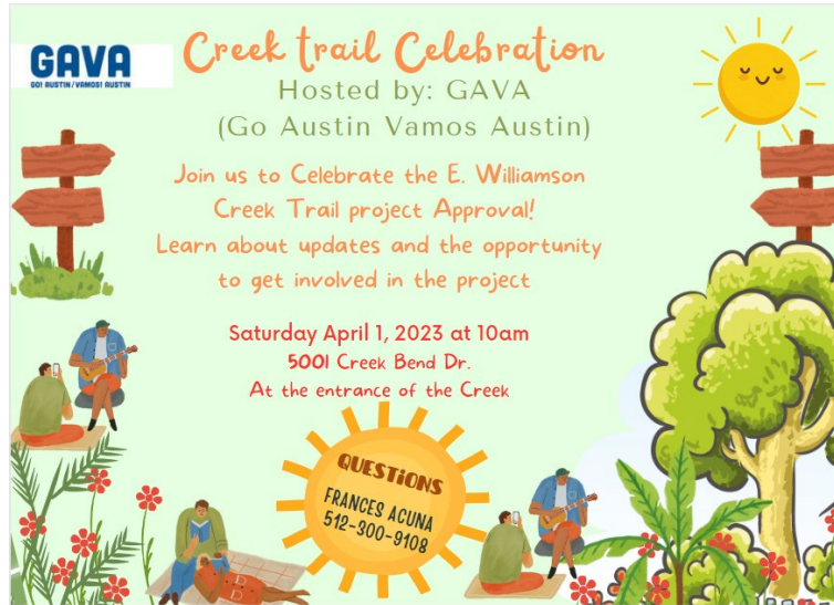
Event flyer for Creek Trail Celebration at 5001 Creek Bend Drive

Creek Trail Celebration: A community event to celebrate the approval of the project proposed in Donde Corre El Agua (Where the Water Runs) plan for the East Williamson Creek Trail will be held on April 1 st at 10 a.m. The plan was presented to the Parks and Recreation Board at the July 25, 2022 meeting. The event is hosted by GAVA (Go Austin, Vamos Austin). District 2