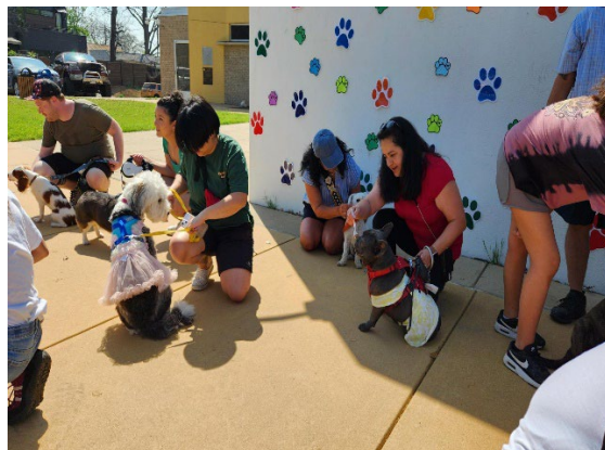
Rodolfo "Rudy" Mendez Recreation Center Hosts Their 10 th Annual Dog Extravaganza

Varsity Generation Events: Rodolfo "Rudy" Mendez Recreation Center hosted three sessions Bringing Seniors Together, Lucky BINGO and luncheon. Varsity Generation participants from the Varsity Generation were invited to attend the event at Mendez Recreation Center on March 16 th , from 10 a.m. - 12 p.m. The event included food, prizes, and BINGO giveaways to those in attendance. 54 people participated in the event.