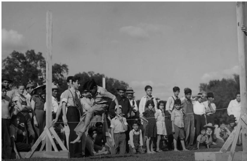
Still from Parque Zaragoza: Comunidad, Cultura, y Resiliencia

Historic Preservation and Tourism Program Updates: The Department was honored at 2023 Texas Recreation and Park Society Institute and Expo February 28 th - March 3 rd , with two notable awards. The Department-produced documentary, Parque Zaragoza: Comunidad, Cultura, y Resiliencia , was selected to receive the TRAPS 2023 Promotion & Marketing Excellence Award – Class I out of a pool of more than 140 submissions. The video highlights the remarkable history of a beloved park, Parque Zaragoza , that emerged from discriminatory city plans and policies, overt racism, and systemic inequities that pushed the Mexican American community into East Austin. Additionally, Pan American Neighborhood Park has been named at 2023 Lone Star Legacy Park. The opening of the park and recreation center in 1956 was an incredible victory for East Austin and provided a civic space focused on teaching English as a second language, U.S. citizenship classes, and acclimating many Latinos to life in Austin. After the Hillside Theater opened at Pan American Park in 1958, the space was cemented in the community as the scene of live music and fraternization. Hosting scores of acts ranging from local favorites to statewide headliners, performances still happen at the Hillside Theater to this day, making it the longest-running outdoor concert series in Austin. The Department will arrange a ceremony later in the year at Pan American Neighborhood Park to celebrate the Lone Star Legacy designation.