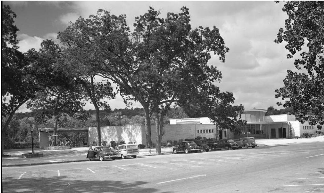
Photo of the Barton Springs Bathhouse in 1947

https://www.austintexas.gov/departments/barton-springs-bathhouse-rehabilitation