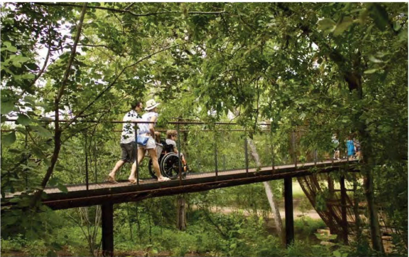
Kingsbury Commons, Pease Park, Austin, TX

IN THE CITY OF AUSTIN, NEW FACILITIES SHOULD ACHIEVE MINIMUM GREEN BUILDING RATING PROGRAM CERTIFICATIONS