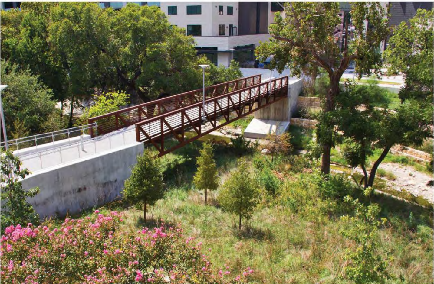
Dell Medical, UT Campus, Austin, TX