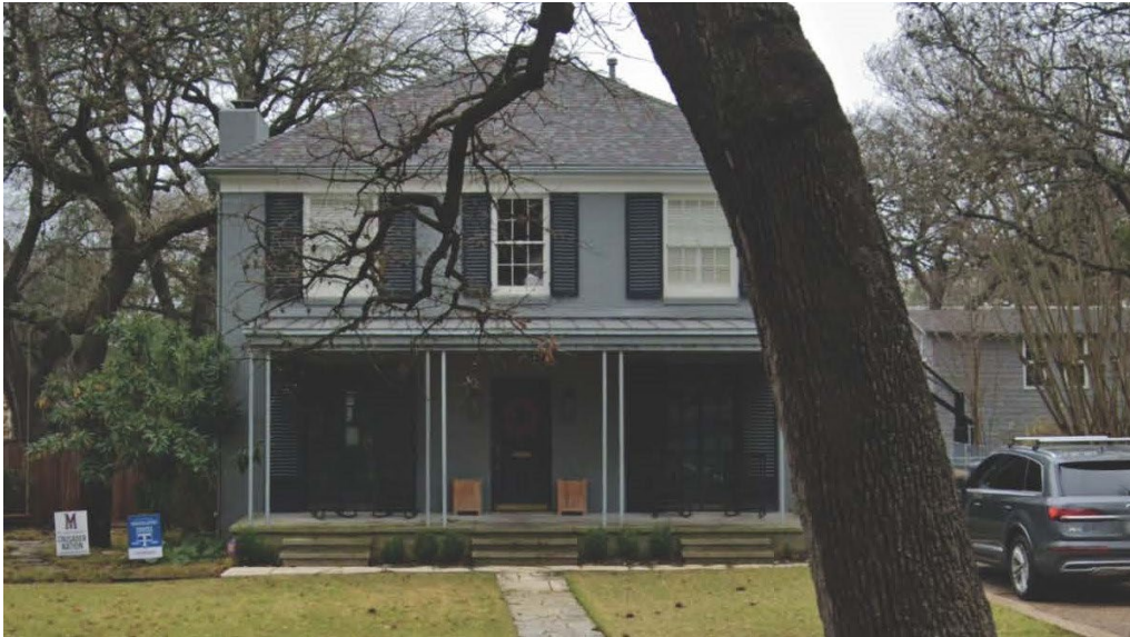
Google maps – 2023