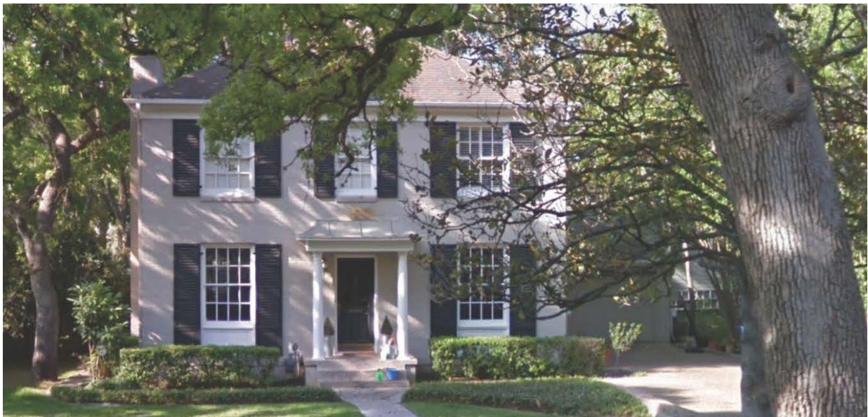
Google Maps – 2013