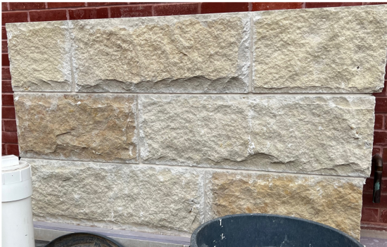
Limestone stone sample