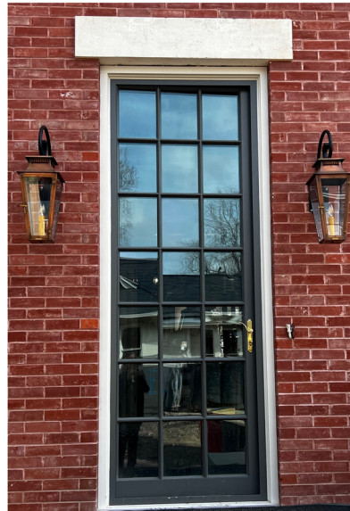
MHB Steel Doors (match Main House addition)