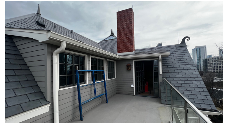
Roof Selection: Synthetic Slate (match Main House) OR Composition shingles