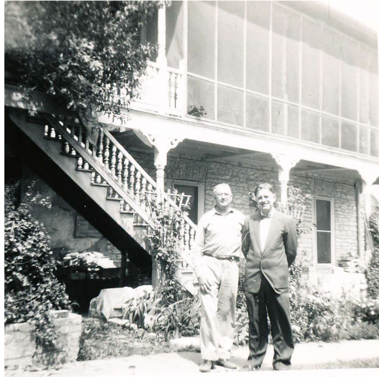
Historic Photos c. 1940 Double-gallery porch and staircase

The photo to the right shows two different patterns of turned balusters: one at the upper gallery, and one at the stair