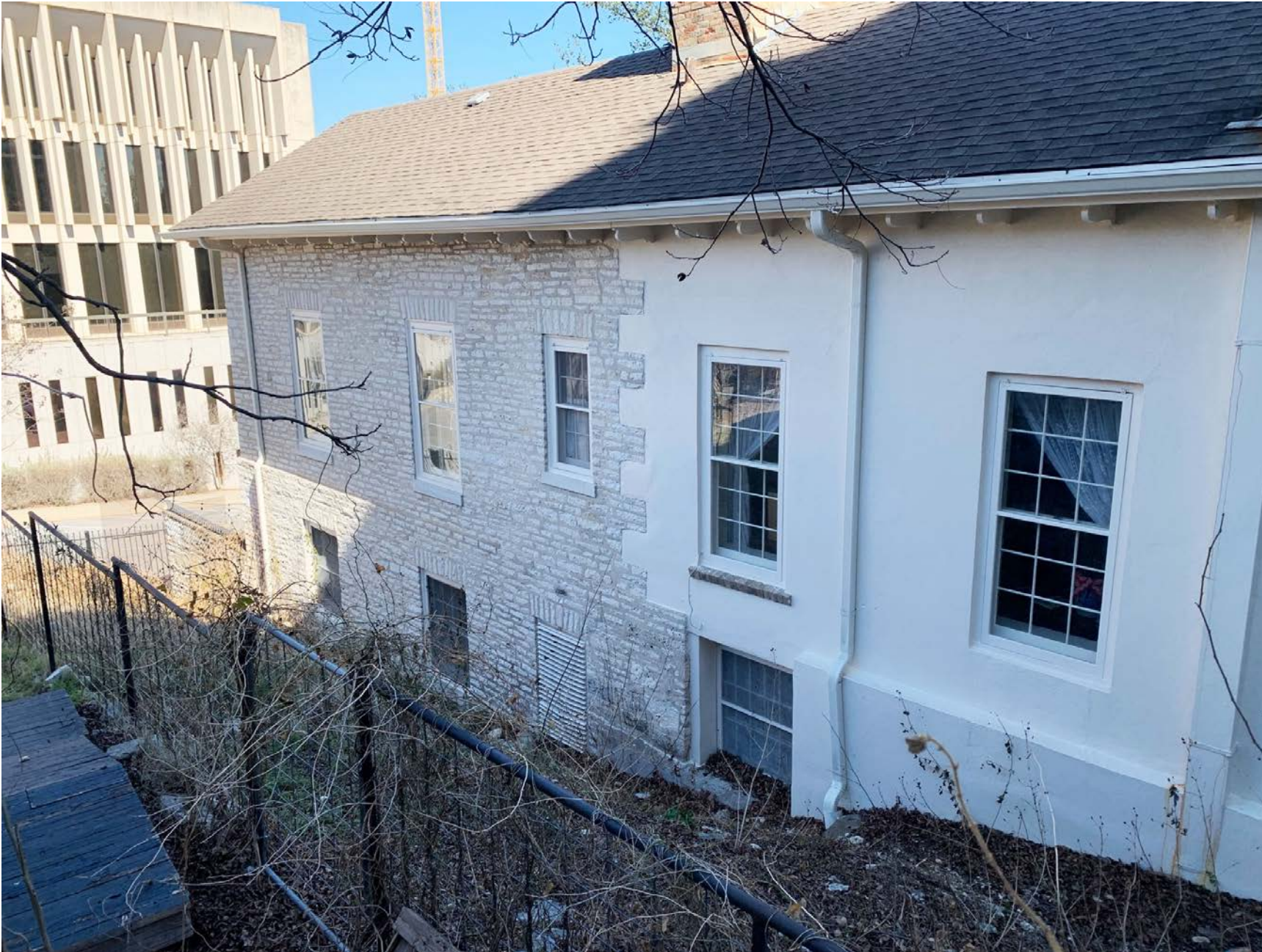
WEST ELEVATION, 2022