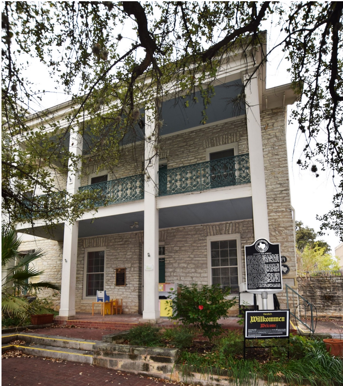
EAST ELEVATION, 2022