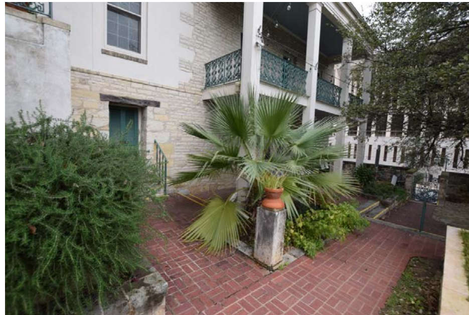
NEW STAIR LOCATION