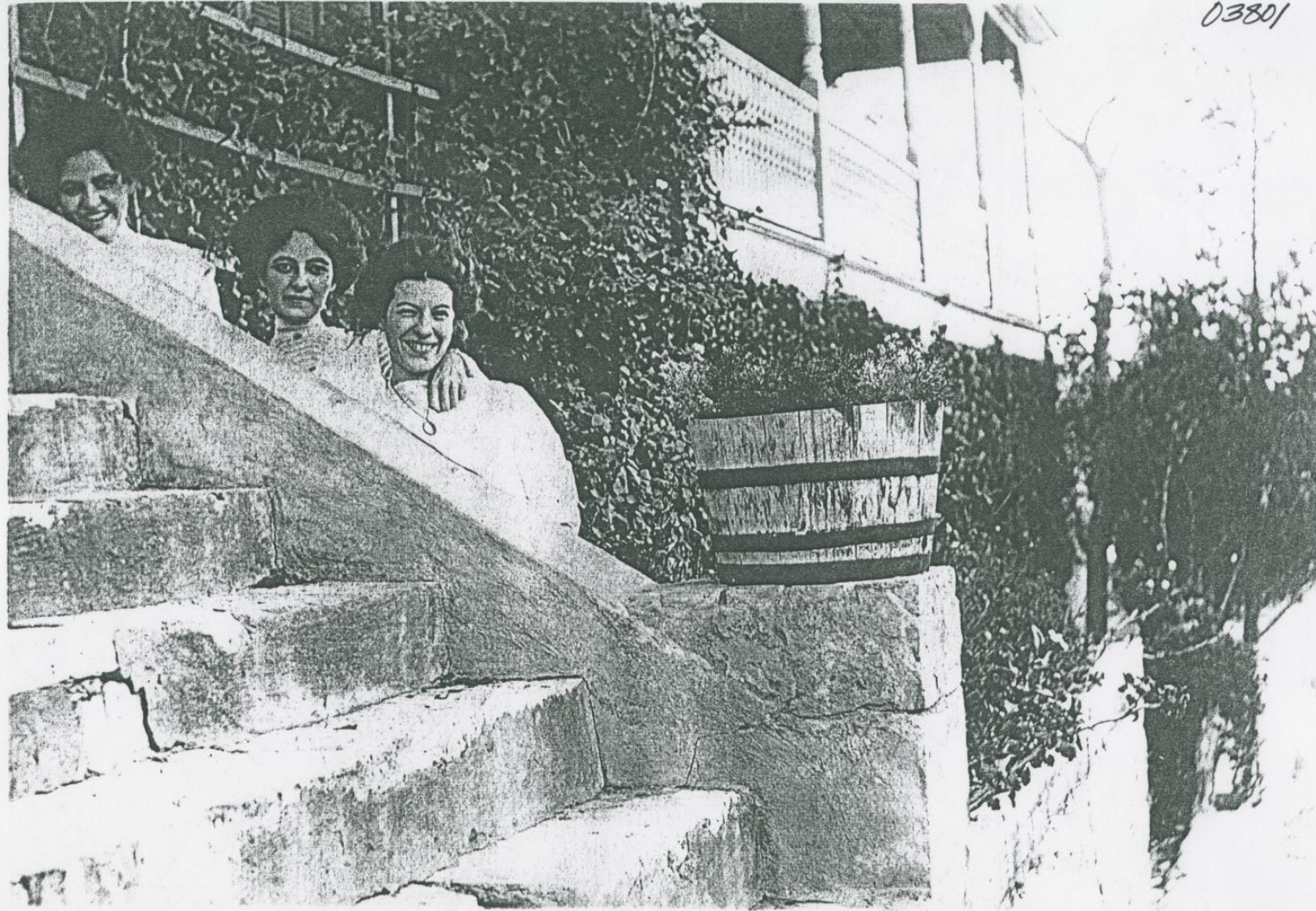
Picture of front elevation (east side) of German Free School circa 1918