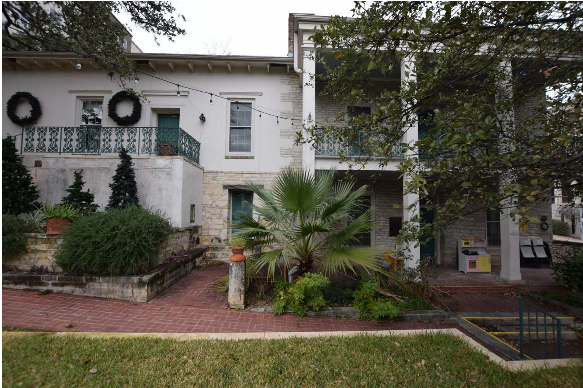
EAST ELEVATION, 2022