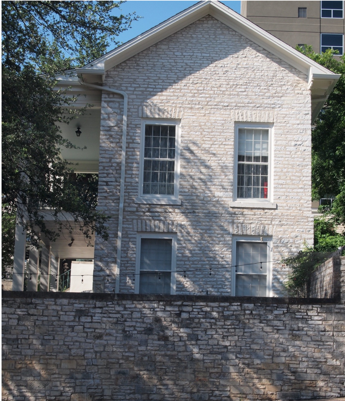
NORTH ELEVATION, 2022 As seen from 10 th Street