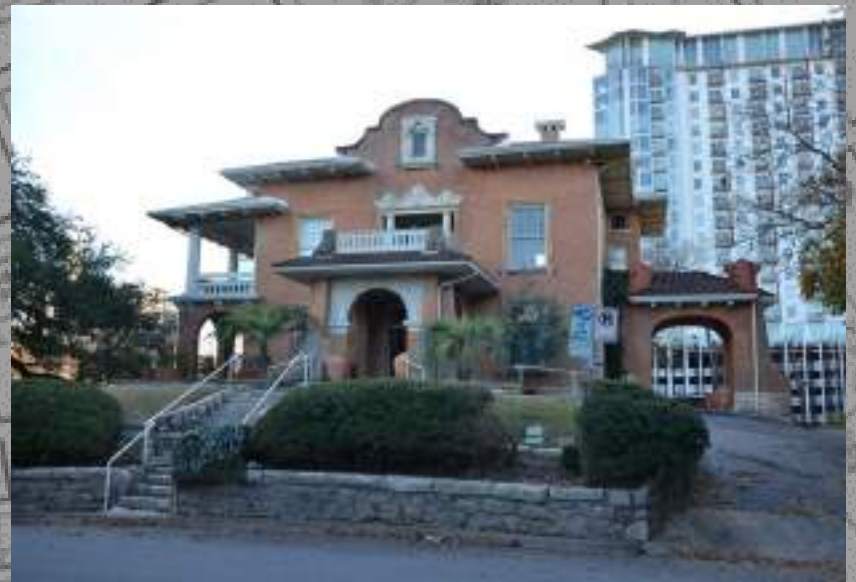
603 W. 8 th Street. Photo by HHM, 2019.