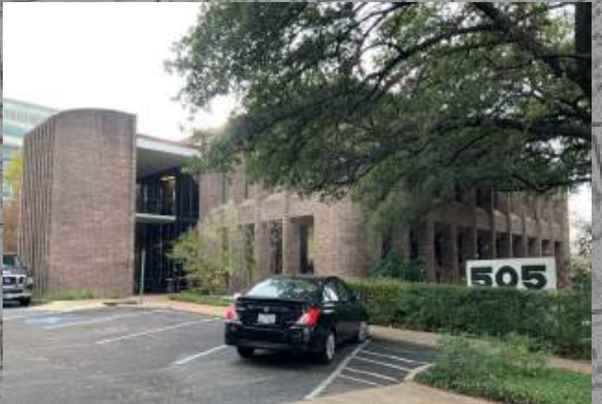
505 W. 12 th Street. Photo by HHM, 2019.