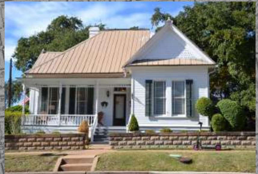
900 Rio Grande Street. Photo by HHM, 2019.