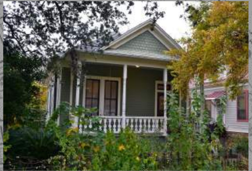
1102 West Avenue. Photo by HHM, 2019.