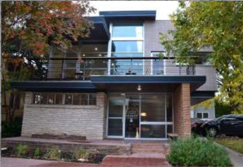
110 Nueces Street. Photo by HHM, 2019.