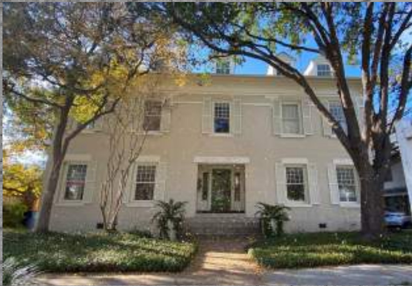
1002 West Avenue.