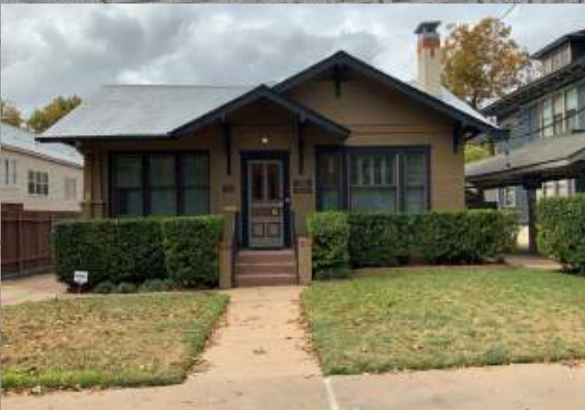
710 West Avenue. Photo by HHM, 2019.