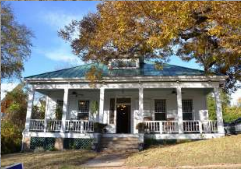
704 W. 9 th Street.