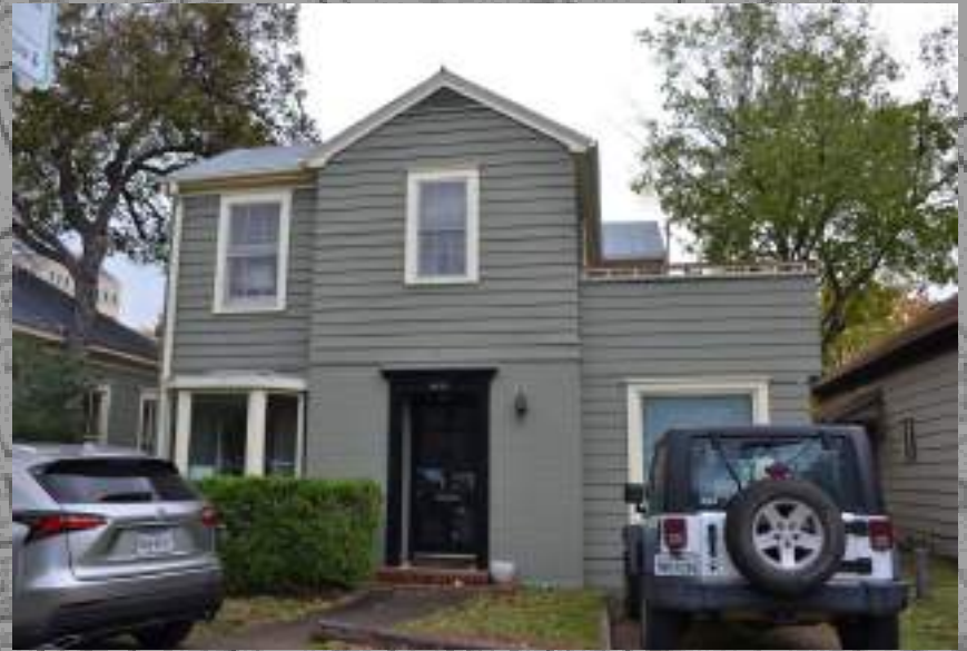
603 W. 14 th Street.