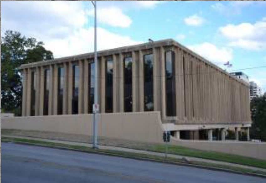
1411 West Avenue. Photo by HHM, 2019.