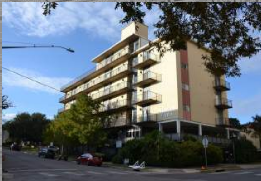
710 West Avenue. Photo by HHM, 2019.