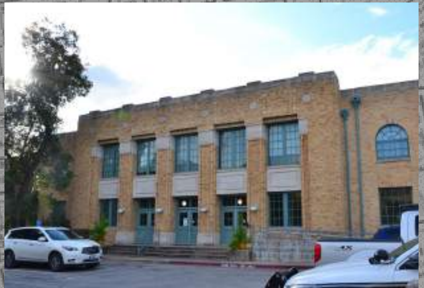
1218 West Avenue. Photo by HHM, 2019.