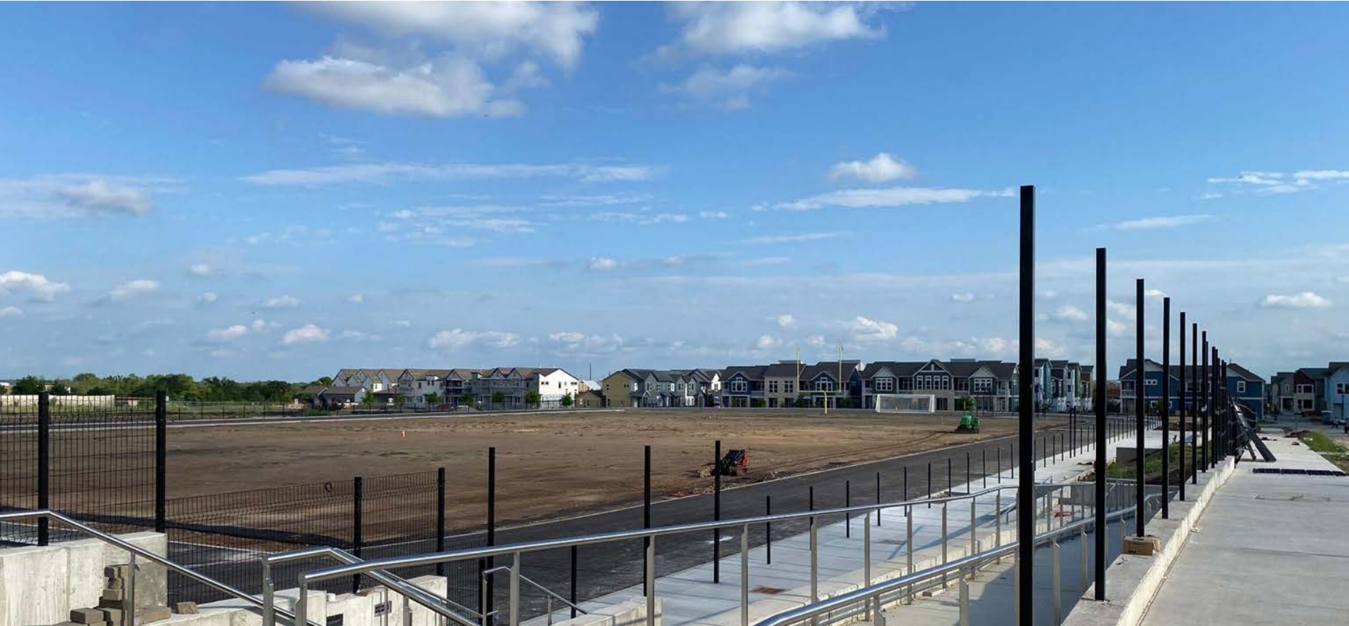
Football Field and Athletics Track