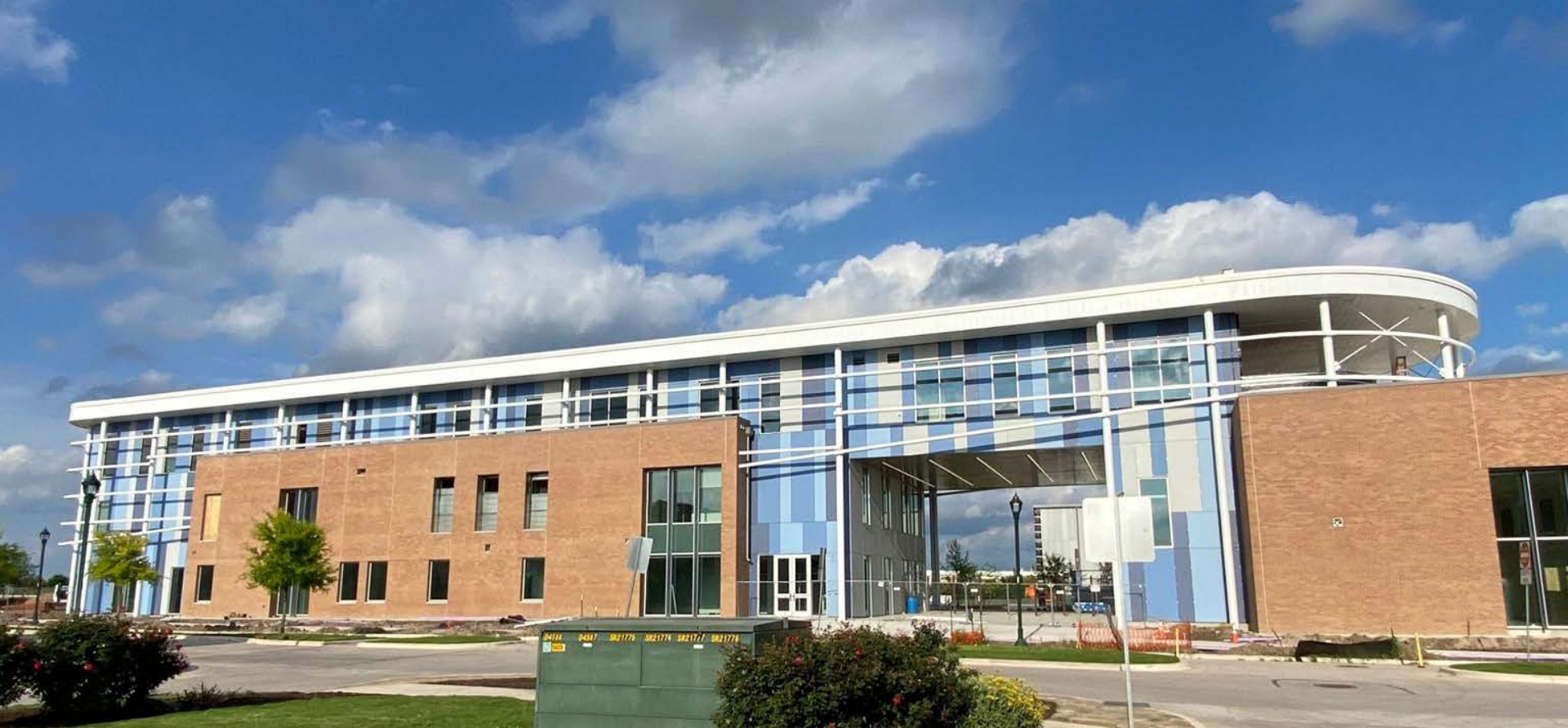
View from Camacho Street