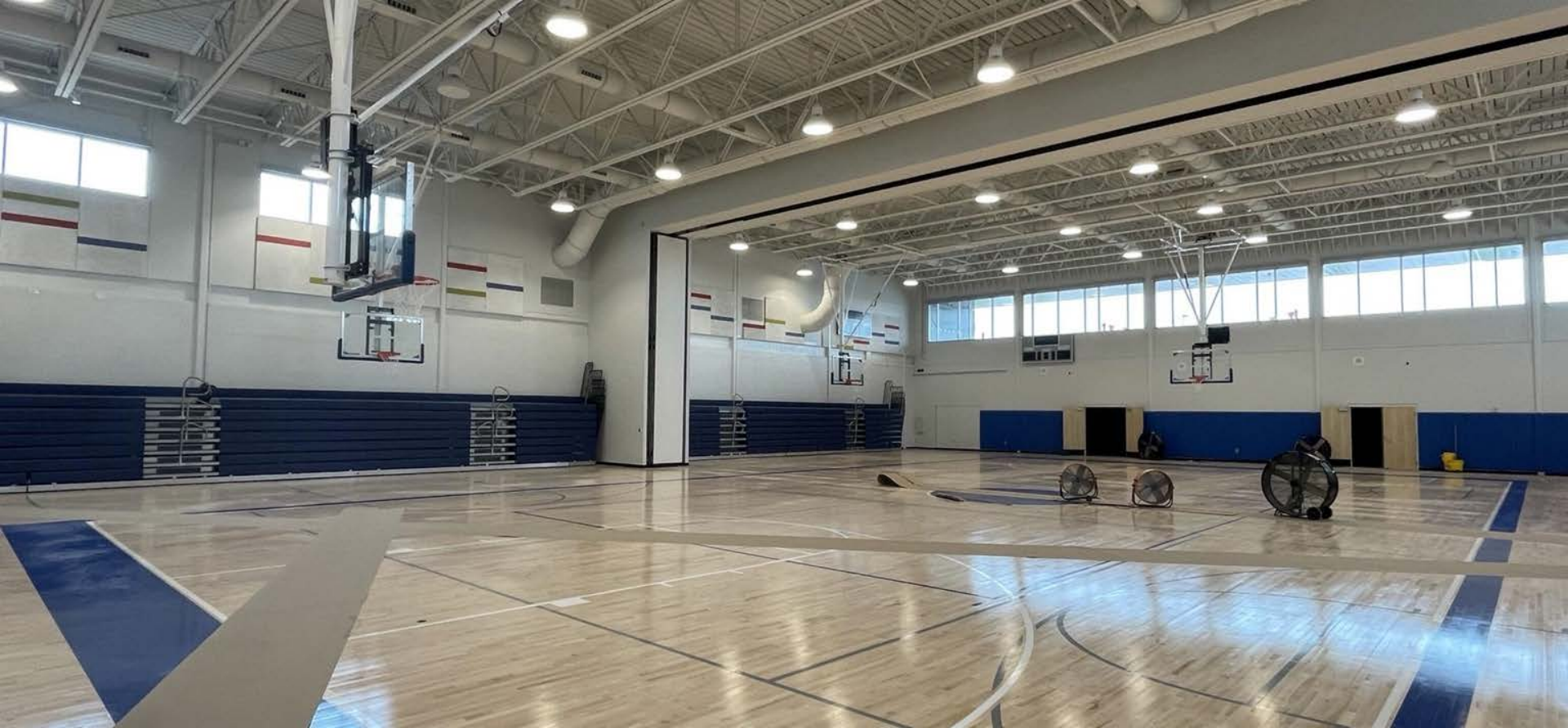
Indoor Gym with one competition and two practice courts