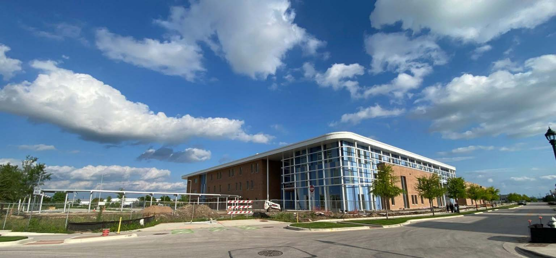
View from McBee Street