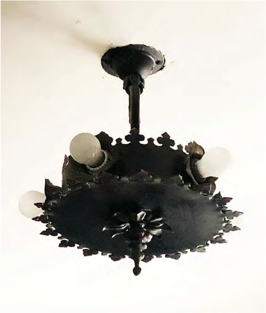
Dining room light fixture