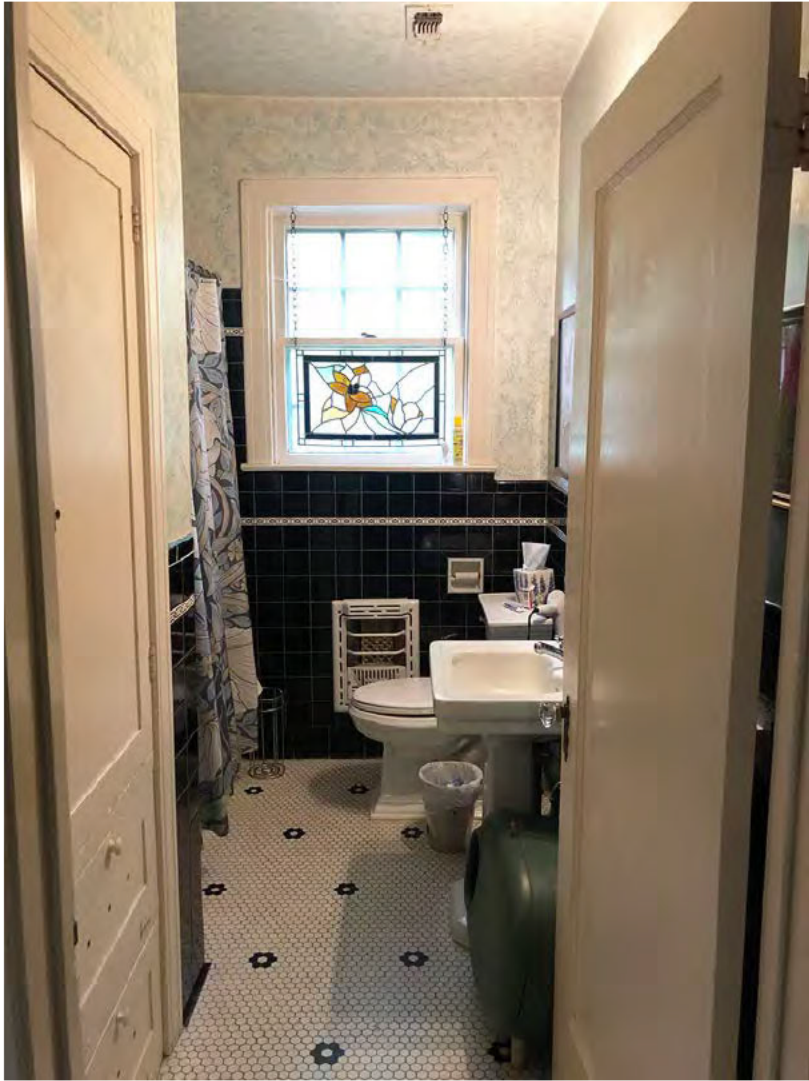
Bath with original tile