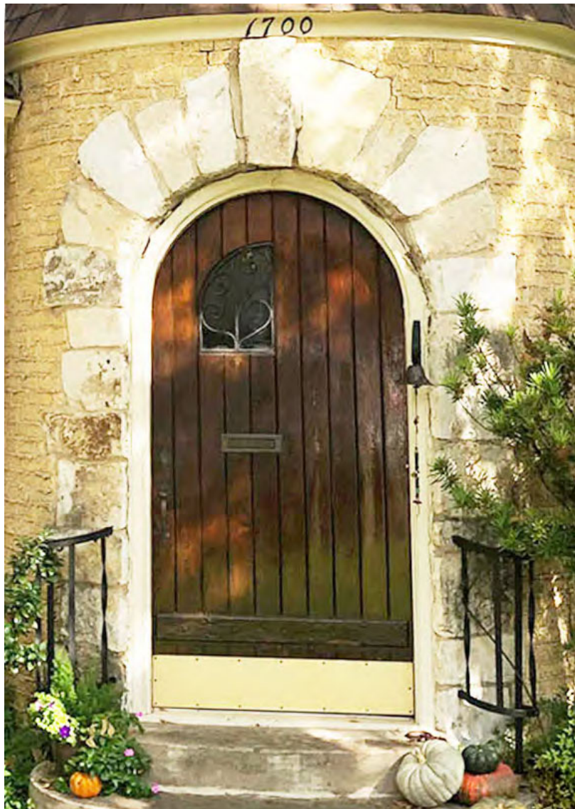
Original front door