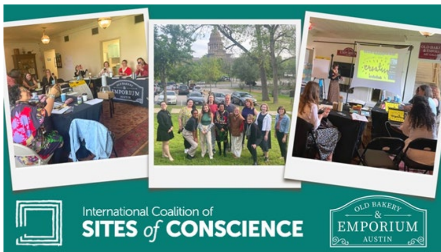
Photos Depicting the Attendees at Proceedings of the International Coalition of Sites of Conscience

The International Coalition of Sites of Conscience Conference: The Old Bakery & Emporium hosted a two day conference April 24-25 for The International Coalition of Sites of Conscience that included two days of presentations and thoughtful discussion. Museum professionals came from all over the United States to engage with Museum staff. The International Coalition of Sites of Conscience is the only global network of historic sites, museums, and memory initiatives that connects past struggles to today's movements for human rights, turning memory into action. There were 15 participants at the event.