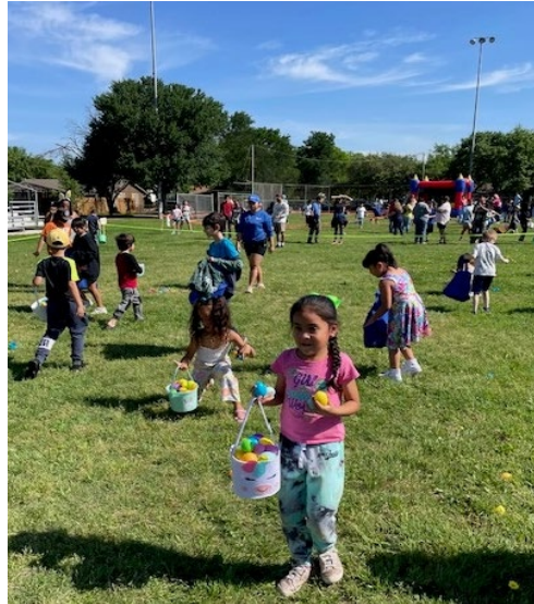
2023 Spring Fling egg hunt

hunt, bounce house, and carnival games. Guests were also treated with popcorn, snow scones, and cotton candy. Approximately 250 community members attended.