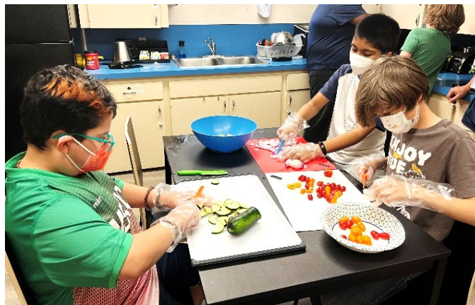
Chop It Like It's Hot

It's Hot Cooking Club: 13 youth are enrolled in Hancock Recreation Center's After School Program Cooking Club on Tuesdays in April. They will meet weekly to cook and learn about healthy and delicious snacks while getting a cool take home kit and their very own apron.