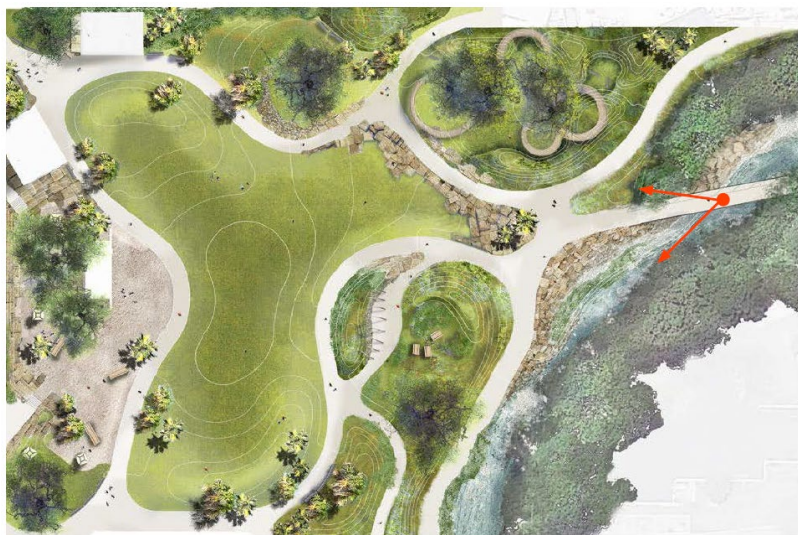
Concept design for Palm Park, Michael Van Valkenburgh Associates Inc

Waterloo Greenway – Palm Park: On April 19 th , the project team presented the Palm Park Schematic Design and Design Development Phase Plan to the Waller Creek Local Government Corporation for discussion and possible action. The contract amount for this phase plan proposal is $775,066. Districts 1 and 9