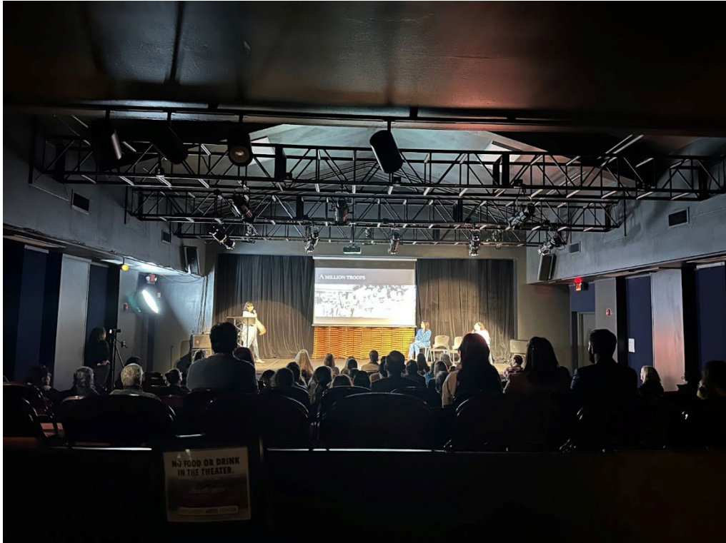
"The Other Side" Artist Talk and Guest Lecture taking place in the Dougherty Arts Center's Theatre

Elisabet Ney Museum: Hyperreal Film Club Screening of Marie Antoinette. The Ney and Hyperreal Film Club partnered to create a magical evening in the courtyard of the Elisabet Ney Museum for a screening of Sofia Coppola's stylish 2006 biopic MARIE ANTOINETTE starring Austin resident KIRSTEN DUNST. The night started with a tour of the museum and ended with an outdoor film screening with over 200 guests dressed in the period of Marie Antoinette. A majority of the guests had never visited the museum. 200 people were in attendance.