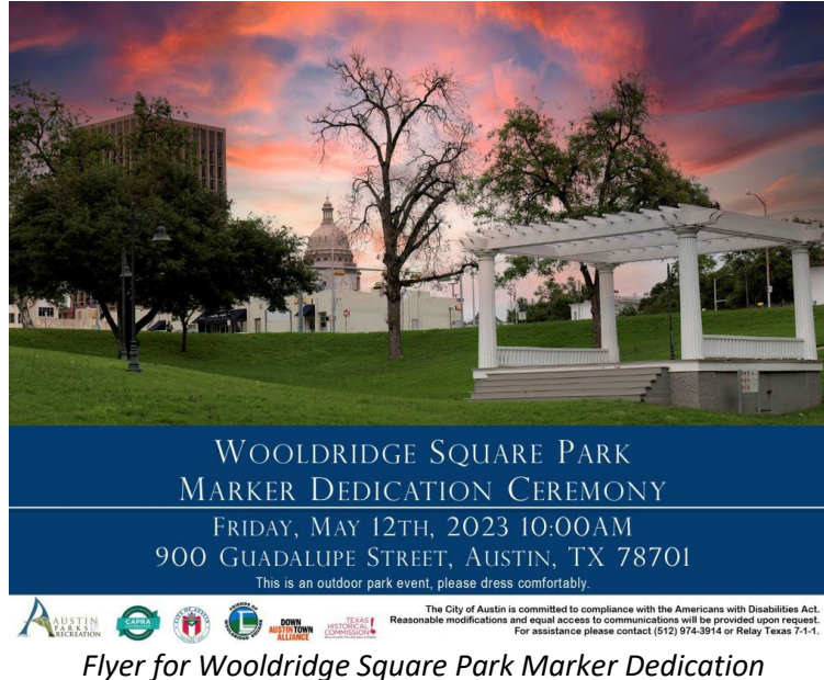
Flyer for Wooldridge Square Park Marker Dedication

Oakwood Chapel Restoration, All Together Here Memorial Event: The Parks and Recreation Department (Department) will hold a dedication at 2 p.m., Saturday, May 20 th , for a permanent monument memorializing the individuals who were discovered during the Oakwood Chapel restoration. The dedication is part of the All Together Here memorial event taking place May 19–21. The events will be free and open to all, with options for both drop-in tours and RSVP'd events. Information can be found on the Oakwood Chapel website. A detailed memo was sent to Mayor and Council April 5 th . District 1 https://www.austintexas.gov/departments/oakwood-cemetery-chapel