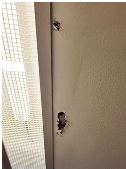
Damage to the Center from AC Water Damage

Butler Landfill Zilker Metro Park Maintenance Project: December 2022 saw the application of the winter hydroseed on the 3-acre revegetation area. A permanent hydroseed mix was applied on top of the winter cover crop growth on April 4 th and 5 th . This represents the final phase of the maintenance improvements made to the Butler Landfill site, which included regrading to prevent ponding, new gates to control vehicular access, a pedestrian gate near Lou Neff Road, and an irrigation system to support the three revegetated acres. The revegetated area will remain closed until 90% of the area exhibits established vegetation, which is expected to take 60-to-90 days depending on weather conditions. Future uses for the lot will be determined according to the Zilker Park Vision Plan. The maintenance project was funded by C3 Presents. District 8