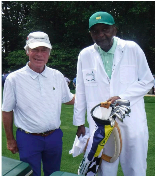
Ben Crenshaw and His Longtime Caddy and friend Carl Jackson