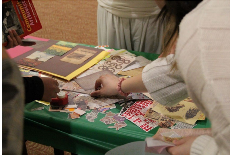
Attendees Participating in the Zine-Making workshop