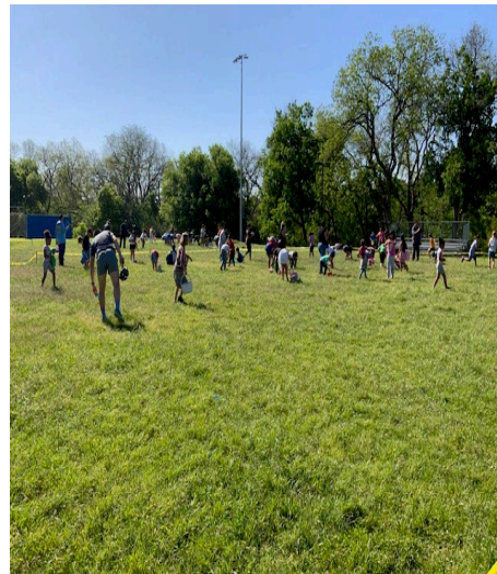
Photo with Easter Bunny and Easter Egg Hunt at Dittmar Recreation Center

Spring Fling at George Morales Dove Springs Recreation Center: The George Morales Dove Springs Recreation Center held its annual Spring Fling Event on Saturday, April 1 st from 10:30 a.m. – 2 p.m. This free community event featured an Easter egg hunt, arts & craft activities, family friendly games, prize giveaways, and snacks and beverages for guests. This outdoor event was attended by over 1,100 participants.