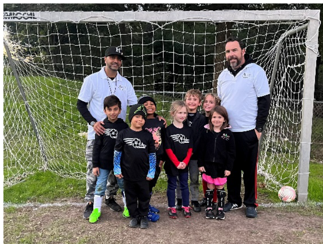
Participants and volunteer Parent Coaches from last Fall Season

Hancock Tiny Tots Workshop: Five children participated in the Hancock Recreation Center's April Tiny Tot Easter Workshop on April 7 th from 9 a.m.-1 p.m. Children had a fun morning of egg hunts, games and spring-themed arts and crafts.