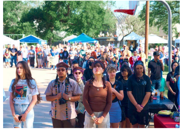
Parque Zaragoza Recreation Center Supported the Communities Cesar Chavez Known as the Sí, se puede March