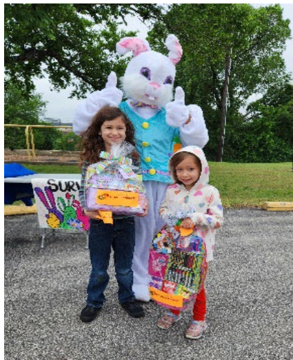
Annual Easter Egg Hunt at Mendez Recreation Center

Texas VegFest: The Texas VegFest occurred on Saturday, April 8 th from 11 a.m. - 6 p.m. at Fiesta Gardens West End. The annual event had over 3,000 people in attendance over the course of the day.