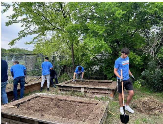
Virginia L. Brown Recreation Center Senior Service Day

Youth Programming/Spring Fling: On Saturday, April 1 st , Gus Garcia Recreation center hosted their annual Spring Eggstravaganza Event from 10:30 a.m.-12 p.m. Four recreation centers and nine vendors collaborated in part with each other to cultivate a festive experience for the community that also included an egg hunt for participants ages 0-12 years old, carnival games for everyone to enjoy, prizes, a moon bounce, adult potato sack race and food. 543 people were in attendance.