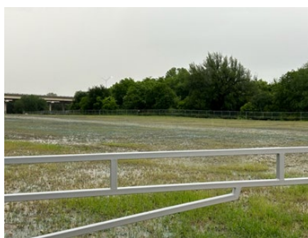
Fresh application of hydroseed mix at the Butler Landfill

Butler Landfill Zilker Metro Park Maintenance Project: December 2022 saw the application of the winter hydroseed on the 3-acre revegetation area. A permanent hydroseed mix was applied on top of the winter cover crop growth on April 4 th and 5 th . This represents the final phase of the maintenance improvements made to the Butler Landfill site, which included regrading to prevent ponding, new gates to control vehicular access, a pedestrian gate near Lou Neff Road, and an irrigation system to support the three revegetated acres. The revegetated area will remain closed until 90% of the area exhibits established vegetation, which is expected to take 60-to-90 days depending on weather conditions. Future uses for the lot will be determined according to the Zilker Park Vision Plan. The maintenance project was funded by C3 Presents. District 8