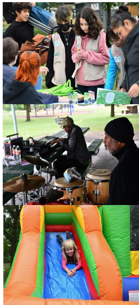
Playground Park Pop-Ups