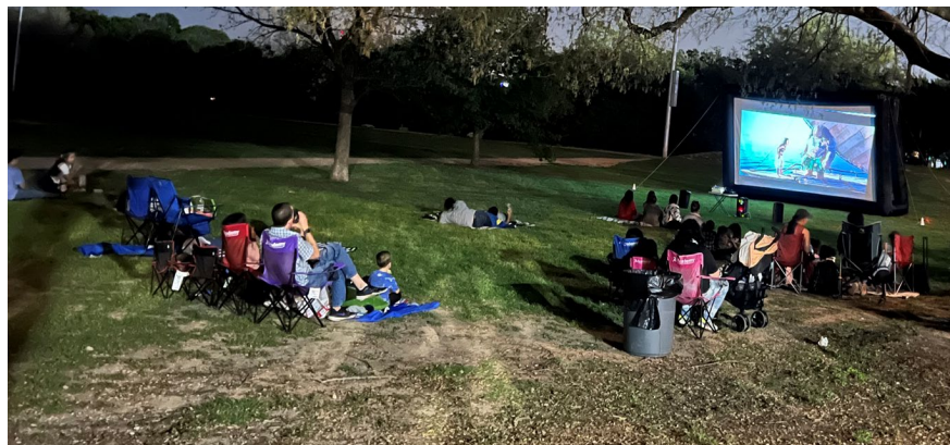
Community members enjoying Movie on the Field

South Austin Recreation Center: Spring Movie on the Field Series has begun. Movies are scheduled for March 10 th , April 14 th and May 12 th . About 40 people attended the March 10 th and April 14 th show. began in March at SARC. Our first screening was Moana that 40 community members enjoyed. Movie showings are scheduled for March 10 th , April 14 th , and May 12 th . About 40 people are expected to attend the May 12 th movie. (Boarders District 5)