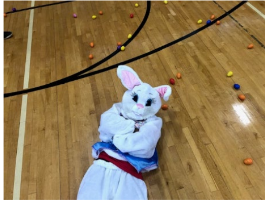
Givens Recreation Center hosts its annual Spring Fling Event

Bobcat Day at Texas State University: On Saturday, April 15 th , Delores Duffie Recreation Center coordinated a field trip to attend Bobcat Day at Texas State University in San Marcos. The day's event will include an on-campus tour and visit for recreation center teens from the 9 th to 12 th grade. Over 50 teens from recreation centers throughout Austin will be able to attend the event to get exposure and taste to the like of a Texas State Bobcat. The event will be free for all high school teens and include a free breakfast catered by Chick Fil A, and lunch onsite at the Texas State University cafeteria. Spots are limited and participants must register at their neighboring recreation center.