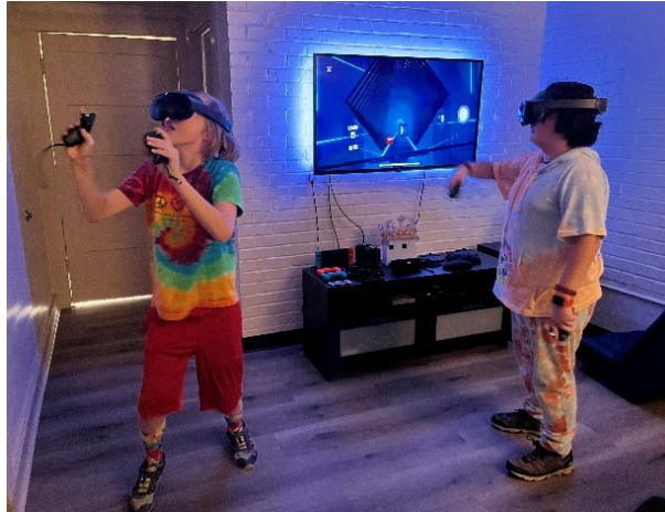
Preteens practicing how to use GG Well Played Games

It's Hot Cooking Club: 13 youth are enrolled in Hancock Recreation Center's After School Program Cooking Club on Tuesdays in April. They will meet weekly to cook and learn about healthy and delicious snacks while getting a cool take home kit and their very own apron.