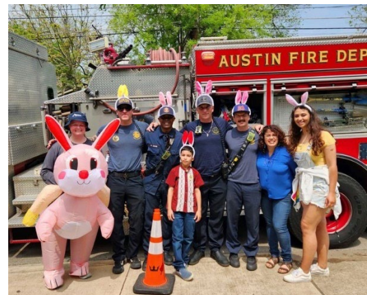
Spring Fling at Alamo Pocket Park