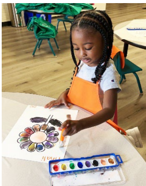
Tiny Tot Arts and Crafts

Hancock Tiny Tots Workshop: Five children participated in the Hancock Recreation Center's April Tiny Tot Easter Workshop on April 7 th from 9 a.m.-1 p.m. Children had a fun morning of egg hunts, games and spring-themed arts and crafts.