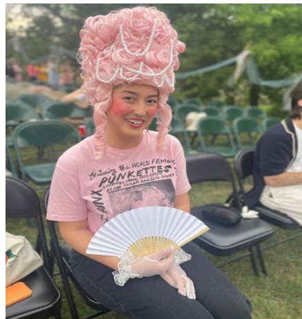
Woman in bright pink Marie Antoinette wig at Ney's film event, Marie Antoinette

Elisabet Ney Museum: Hyperreal Film Club Screening of Marie Antoinette. The Ney and Hyperreal Film Club partnered to create a magical evening in the courtyard of the Elisabet Ney Museum for a screening of Sofia Coppola's stylish 2006 biopic MARIE ANTOINETTE starring Austin resident KIRSTEN DUNST. The night started with a tour of the museum and ended with an outdoor film screening with over 200 guests dressed in the period of Marie Antoinette. A majority of the guests had never visited the museum. 200 people were in attendance.