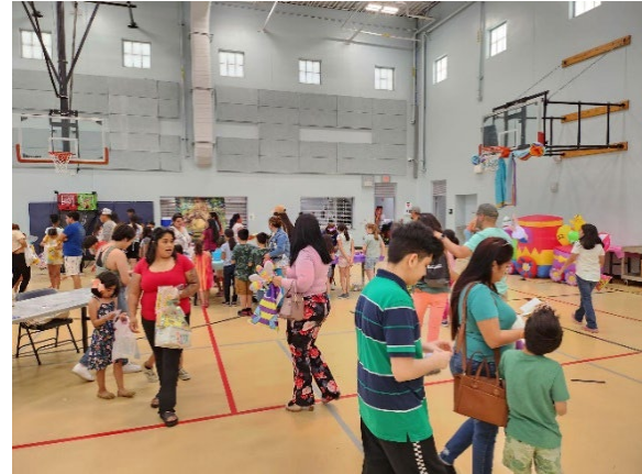
Turner- Roberts Recreation Center hosts its annual Spring Fling Event