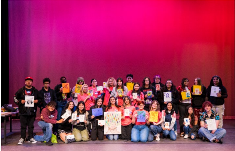
“Breaking Barriers” Conference took place in the Carver Museum, in the Boyd Vance Theatre