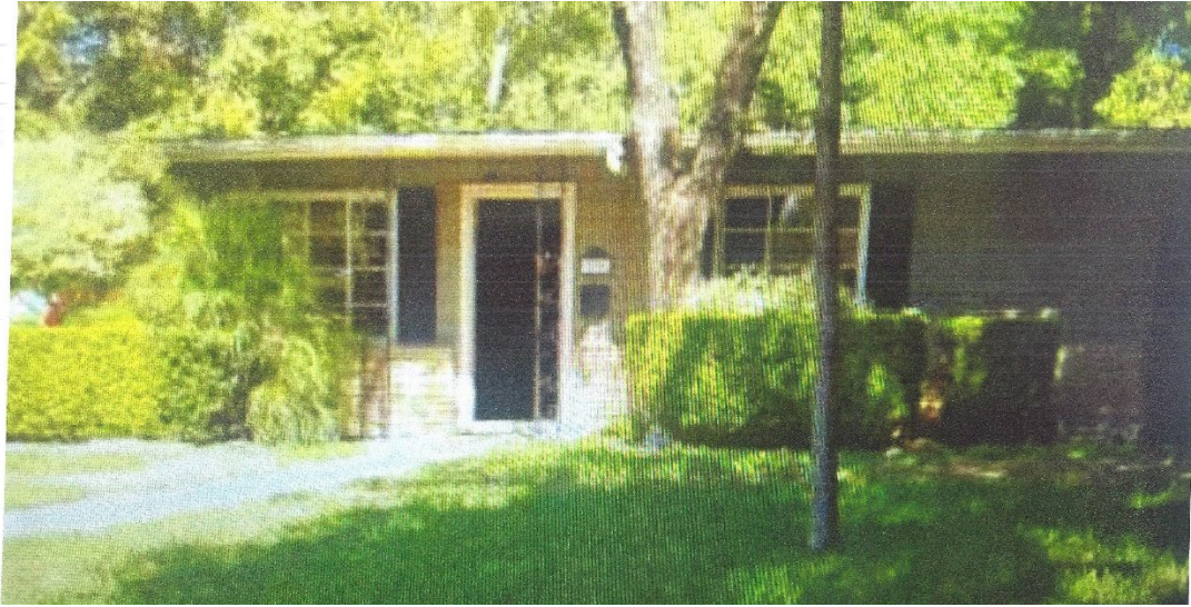
Demolition Application – 2023