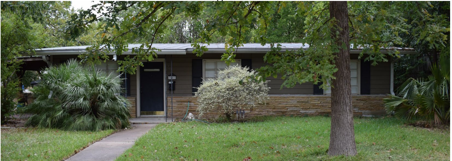
North Central Austin survey, 2020