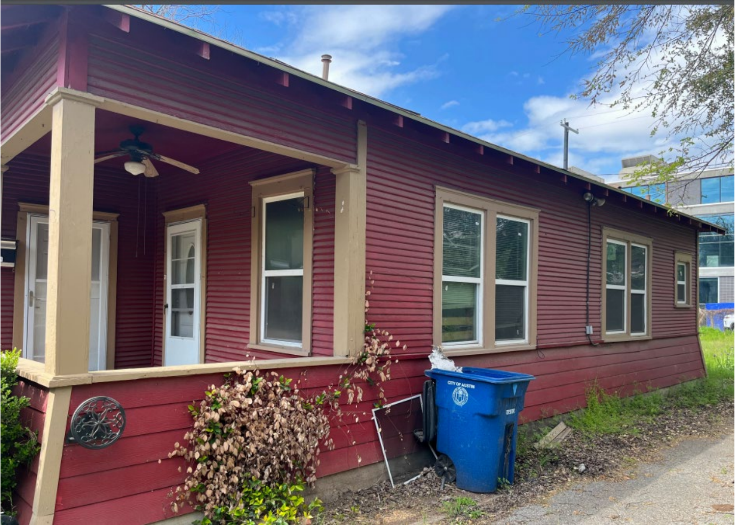
Demolition application, 2023