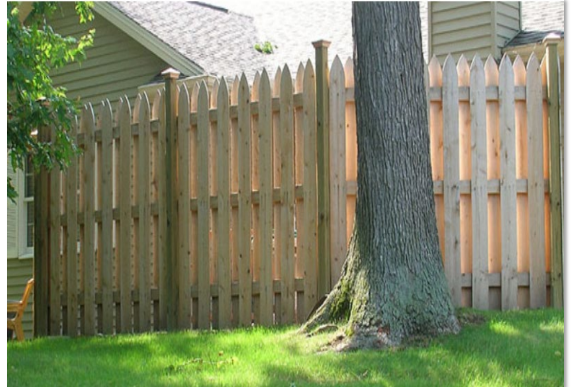
Potential for impalement