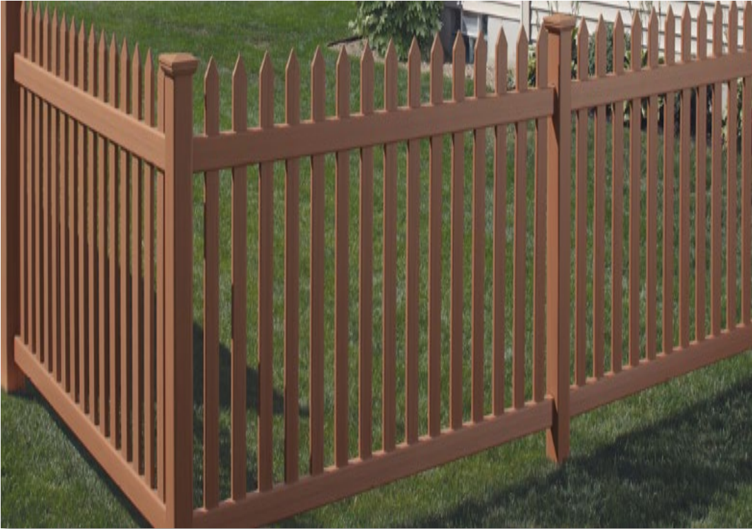
Gap between vertical members exceed 2” and potential for impalement