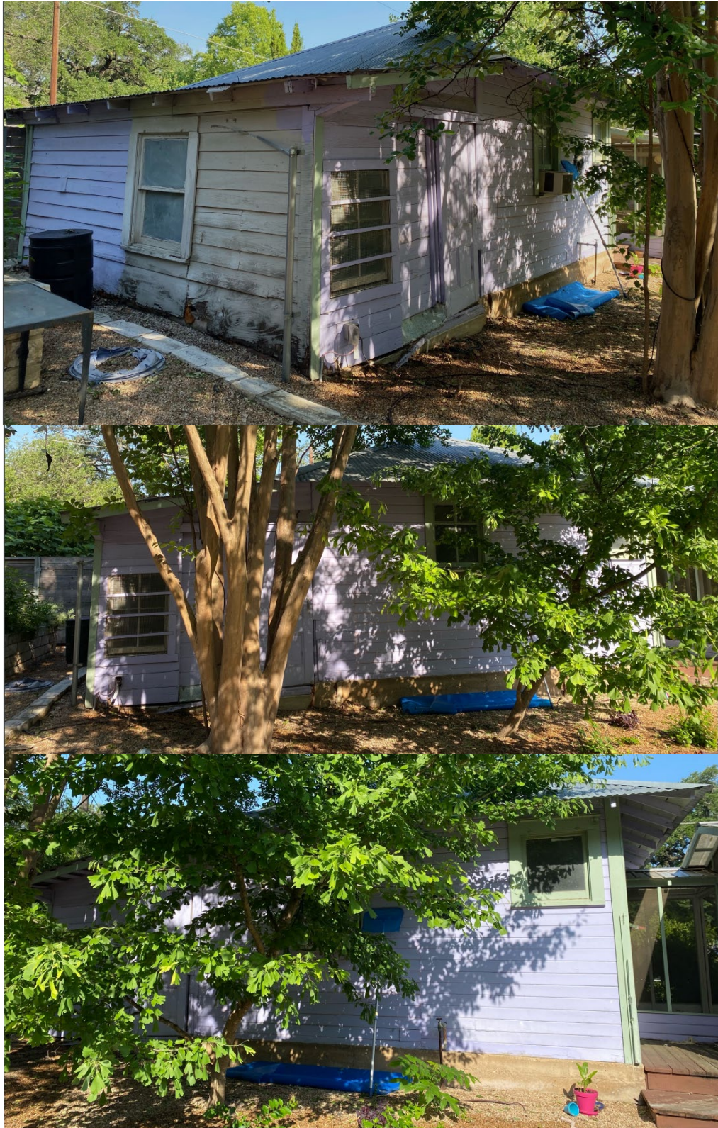
Permit application, 2023