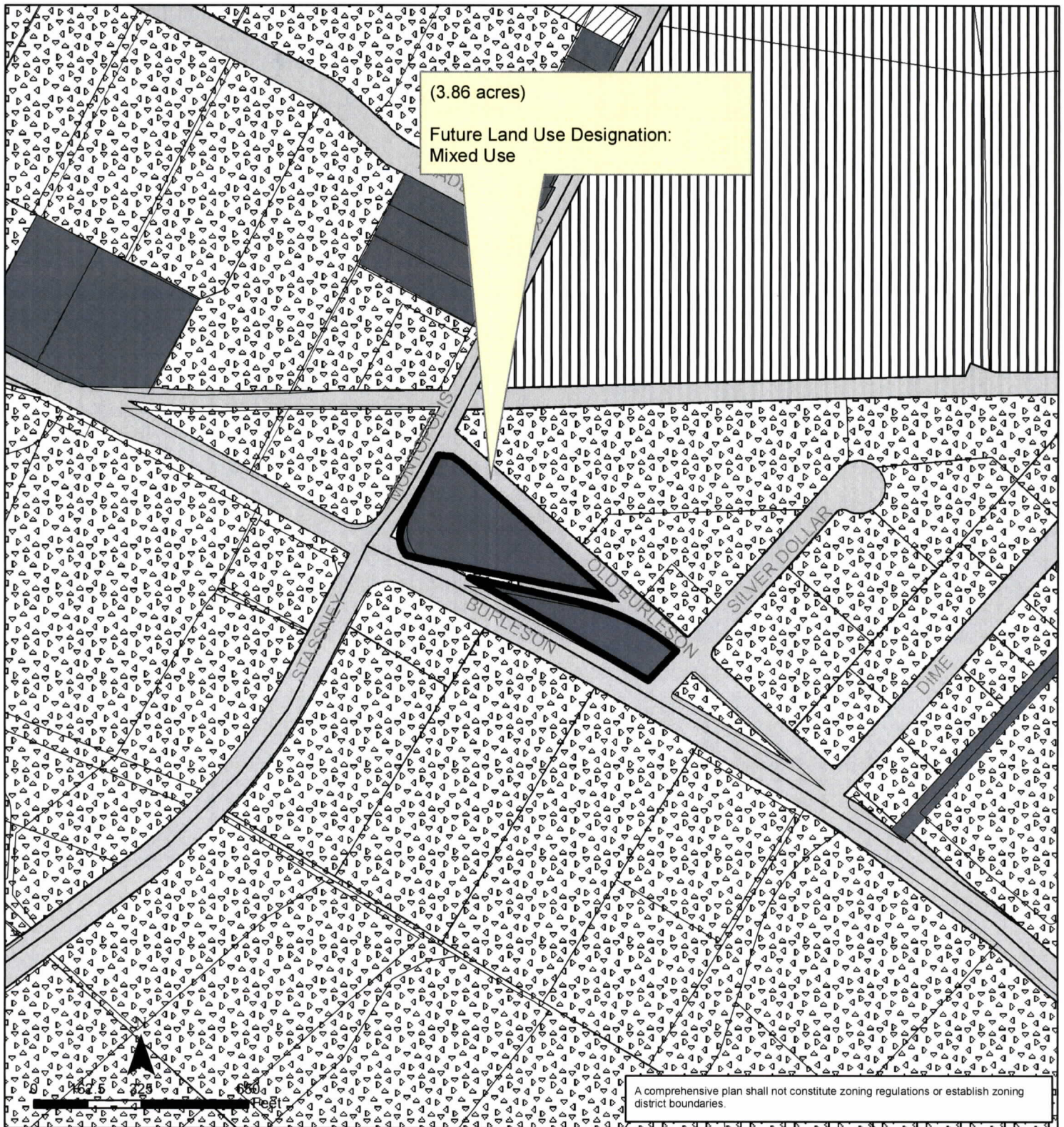
Exhibit A Southeast Combined (Southeast) Neighborhood Planning Area NPA-2022-0014.05

This product is for informational purposes and may not have been prepared for or be suitable for legal, engineering, or surveying purposes. It does not represent an on-the-ground survey and represents only the approximate relative location of property boundaries.