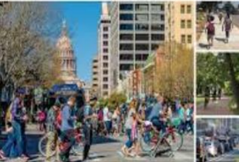
Austin Strategic Mobility Plan

A robust and fully maximized telework policy for City of Austin employees will move us closer to meeting the goals outlined the Austin Strategic Mobility Plan and Vision Zero.