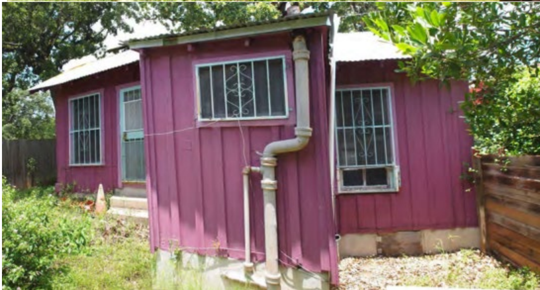
Demolition application, 2021