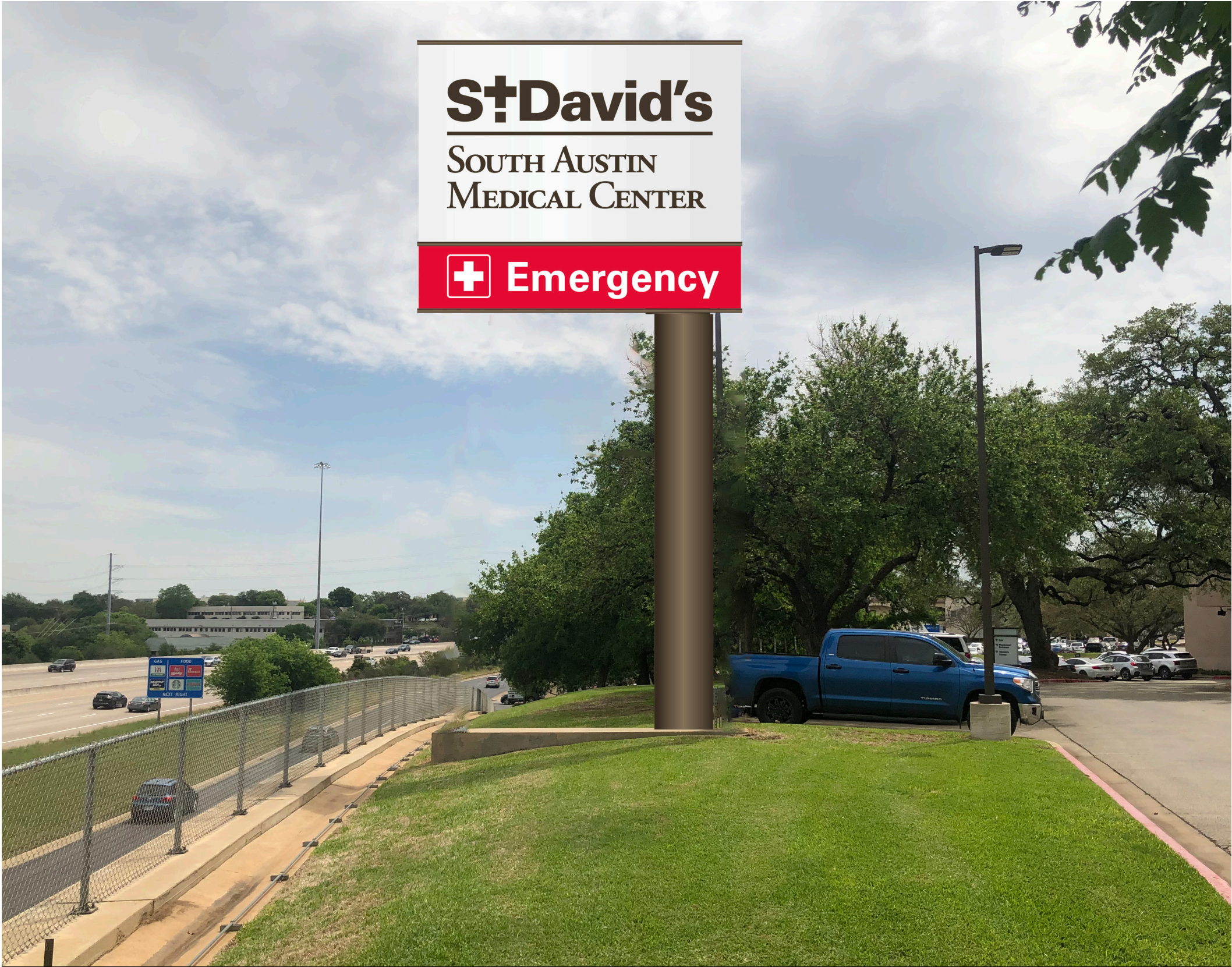
After: 253 SF