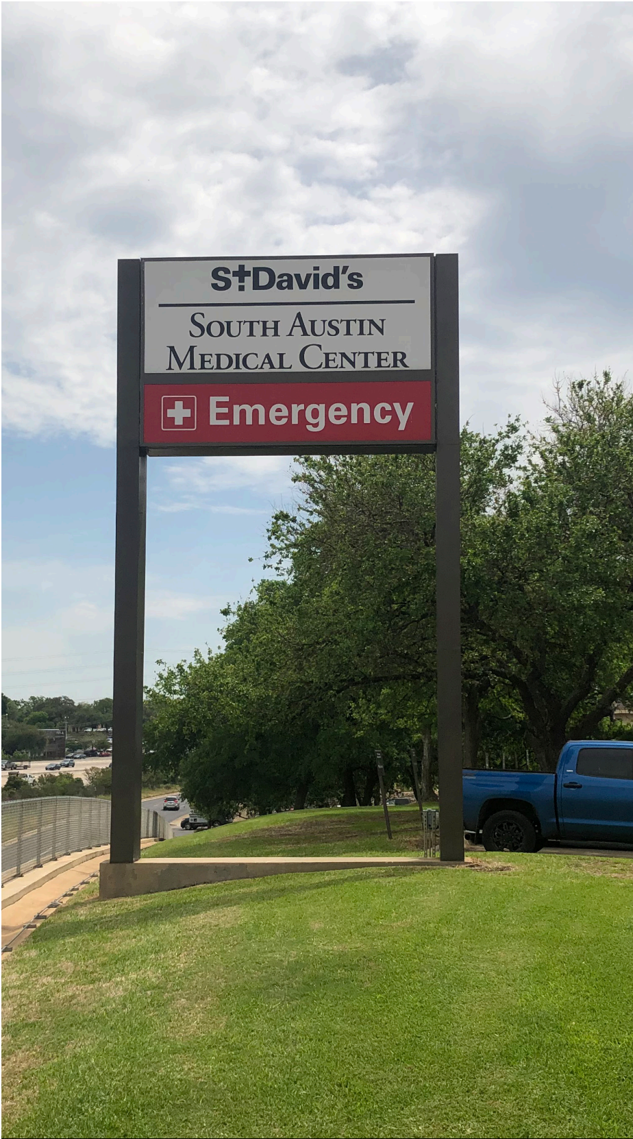
Before: 112 SF