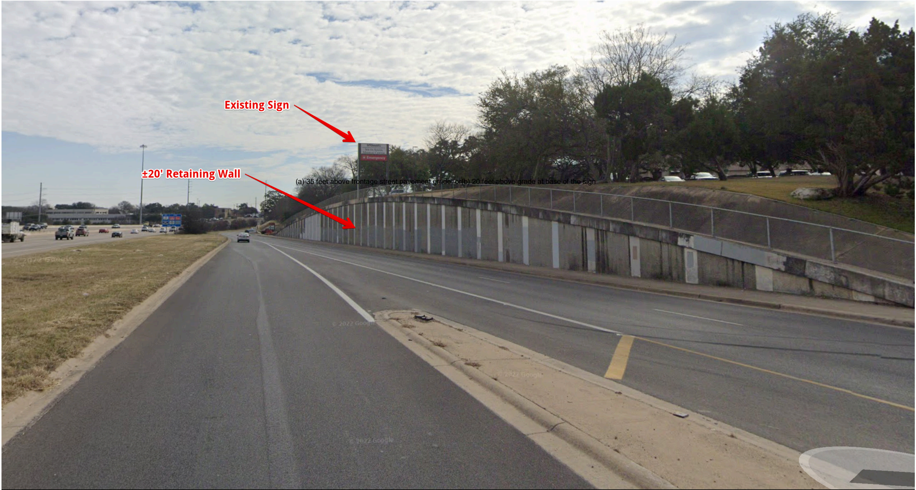
Extremely high retaining wall and topography make compliance with code a hardship.